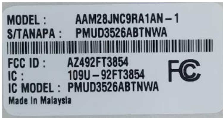
Figure 2: FCC/IC Label for XPR 5350e 136-174MHz 25W GOB GNSS Numeric Display