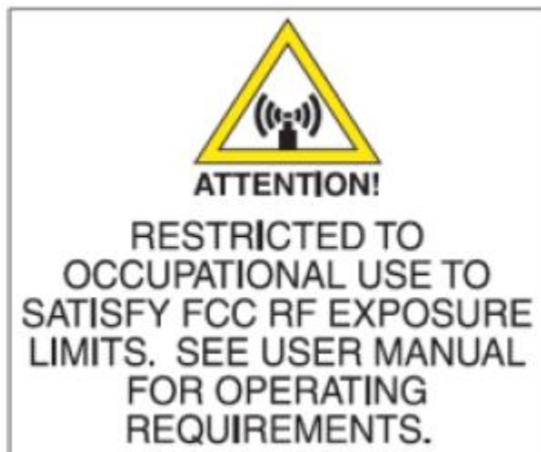
Figure 3: RF Exposure Warning Label