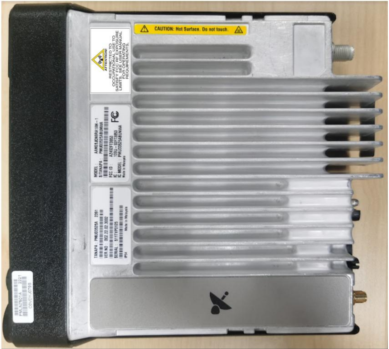
Bottom View (FCC/IC Label Location) Same for XPR 5550e Color Display and XPR 5350e Numeric Display