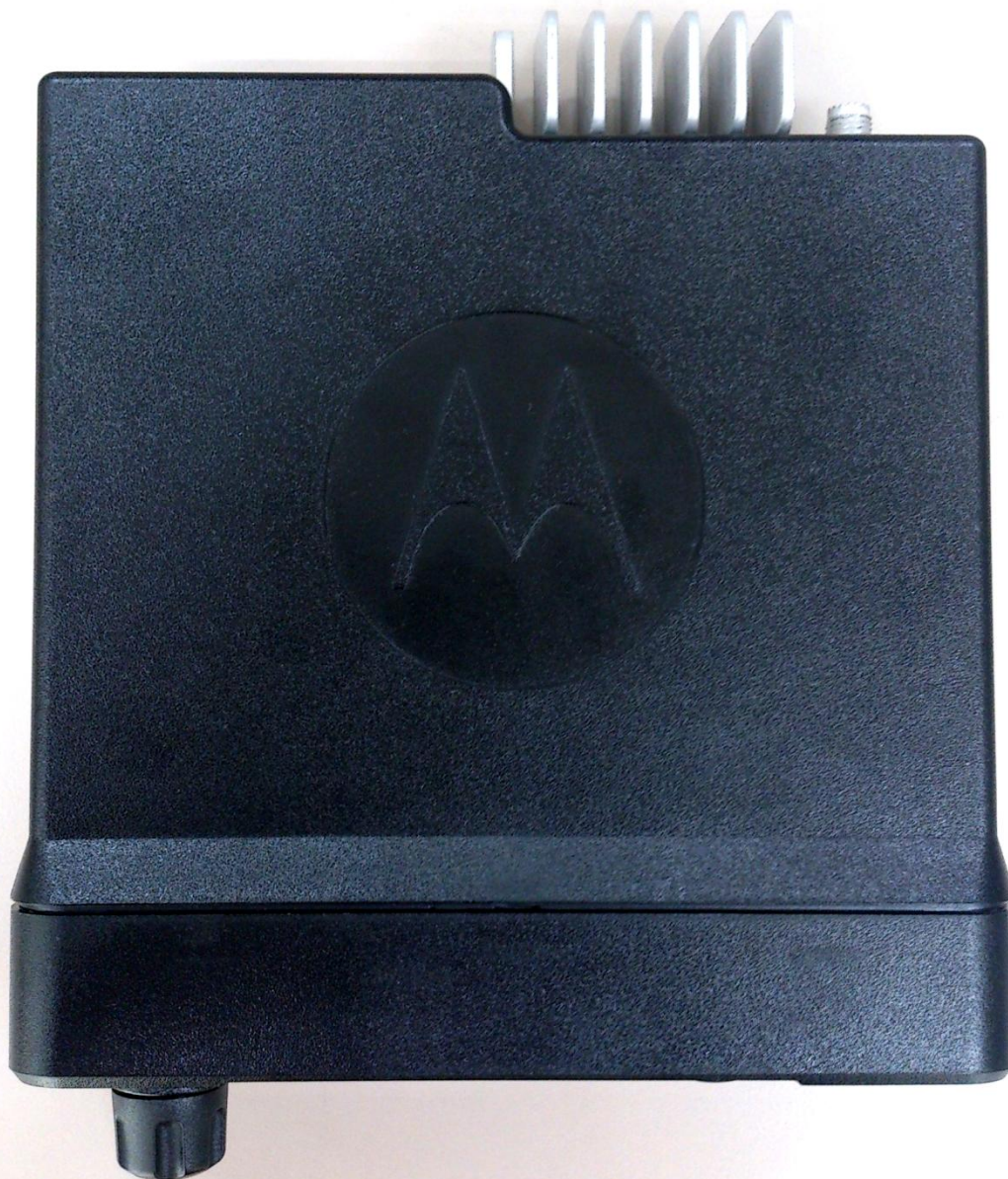
Top View (Same for XPR 5550e Color Display and XPR 5350e Numeric Display)