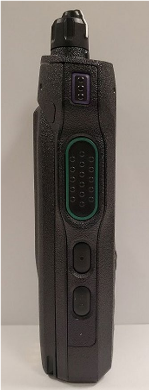
Side View (Left) with Battery - APX N50 / APX N30