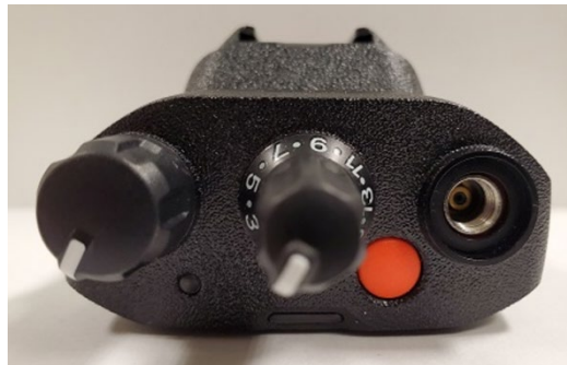
Top View with Battery - APX N50 for Hazloc Model / APX N30 for Hazloc Model