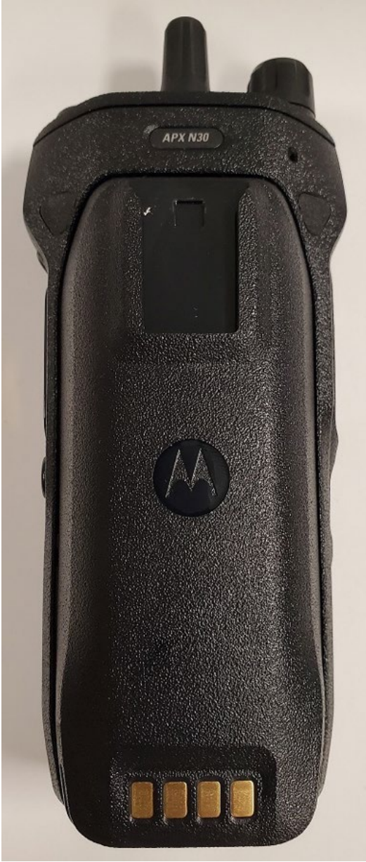
Back View with Battery - APX N30 for Hazloc Model