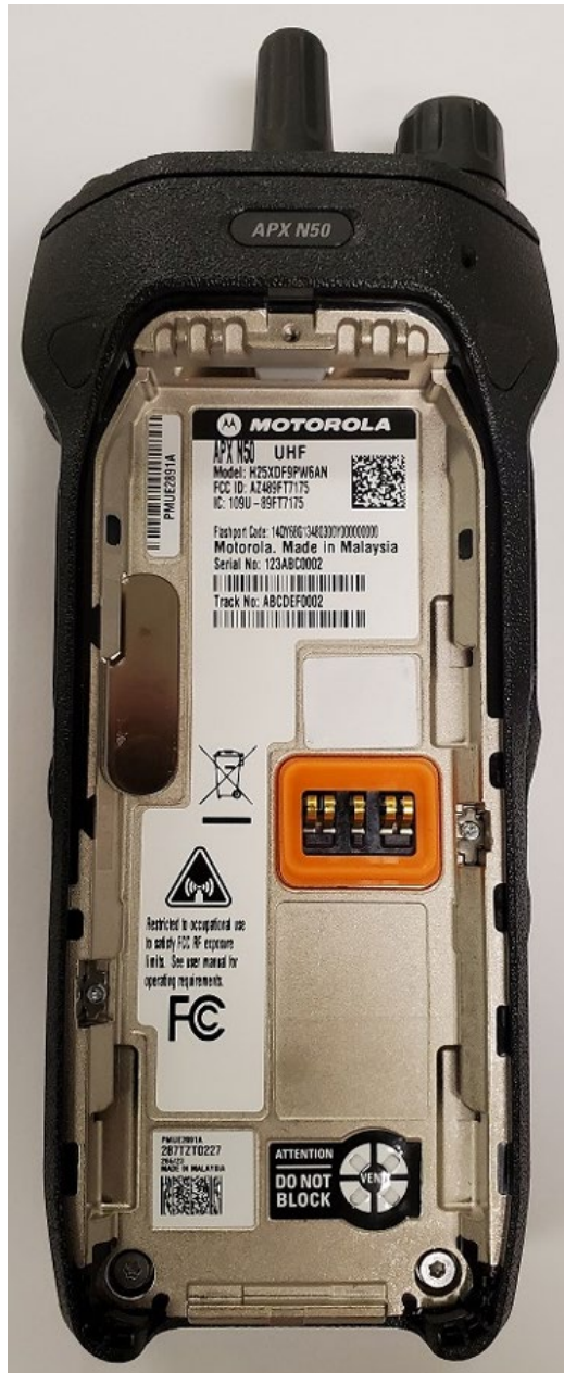
View of FCC/IC Label Location - APX N50