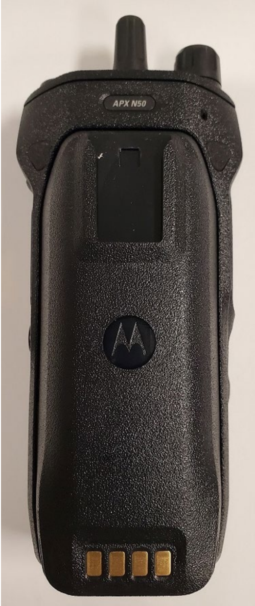
Back View with Battery - APX N50 for Hazloc Model