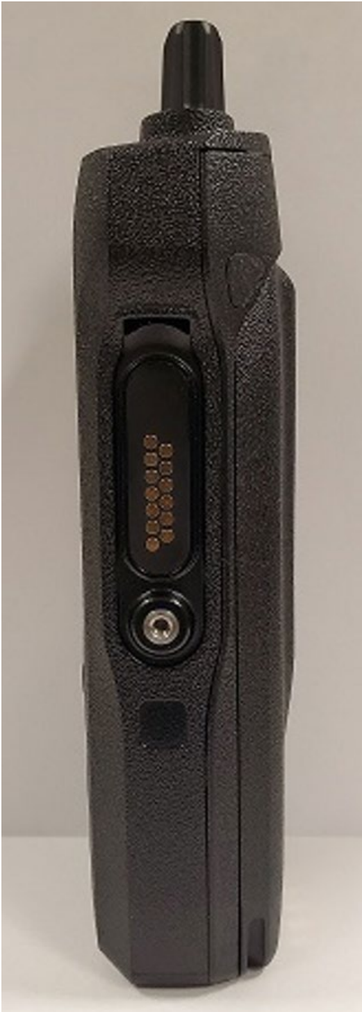
Side View (Right) with Battery - APX N50 / APX N30