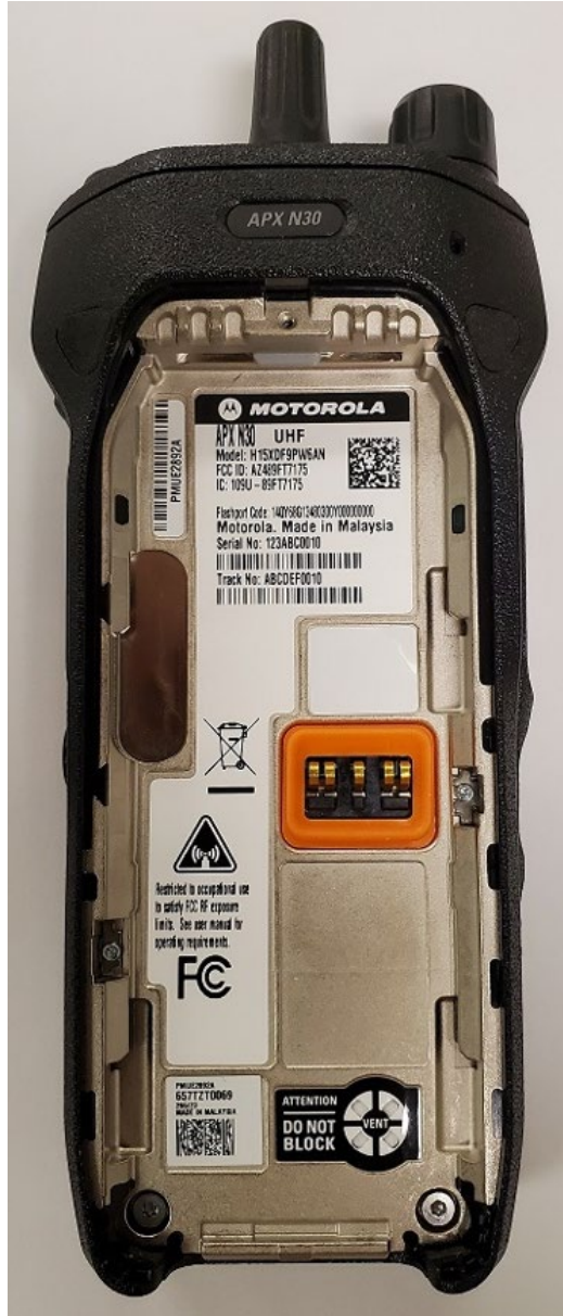
View of FCC/IC Label Location - APX N30