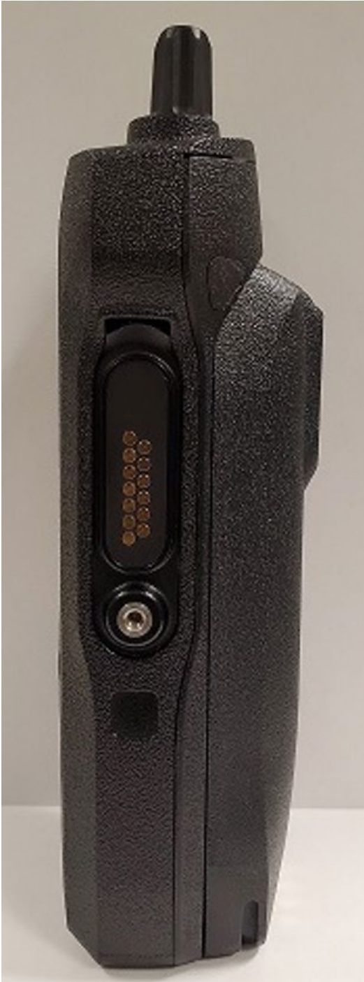
Side View (Right) with Battery - APX N50 for Hazloc Model / APX N30 for Hazloc Model