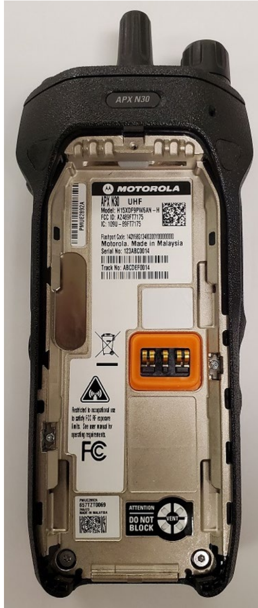
View of FCC/IC Label Location - APX N30 for Hazloc Model