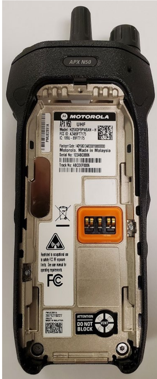
View of FCC/IC Label Location - APX N50 for Hazloc Model