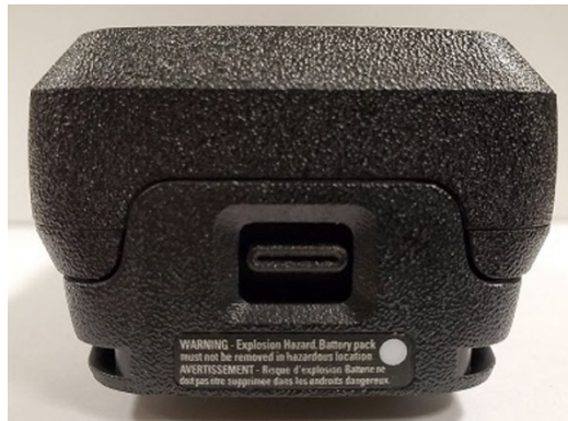
Bottom View with Battery - APX N50 for Hazloc Model / APX N30 for Hazloc Model