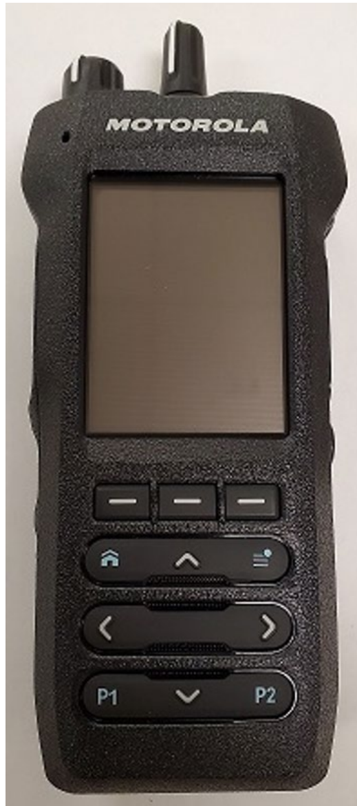
Front View with Battery APX N50 / APX N30 / APX N50 for Hazloc Model / APX N30 for Hazloc Model