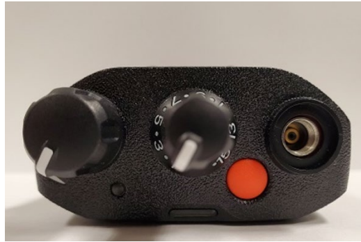
Top View with Battery - APX N50 / APX N30