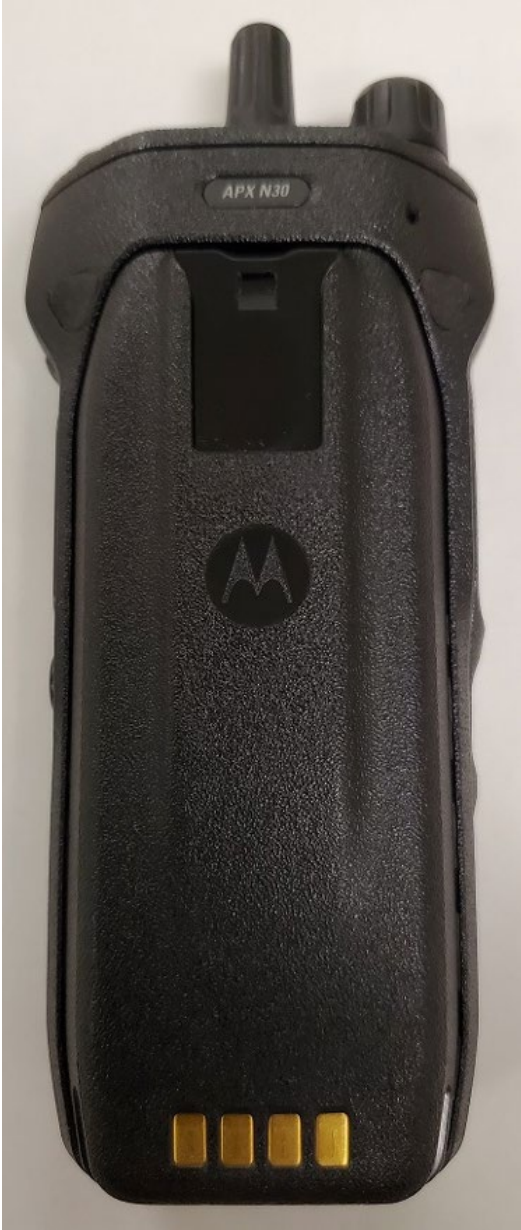
Back View with Battery - APX N30