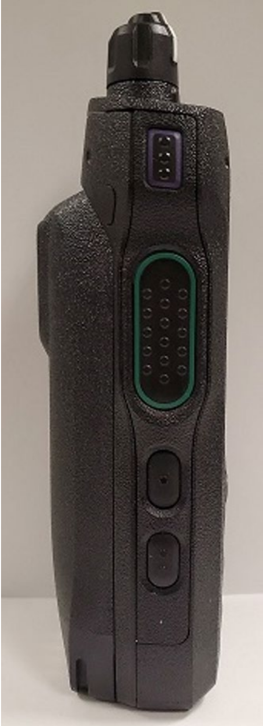
Side View (Left) with Battery - APX N50 for Hazloc Model / APX N30 for Hazloc Model