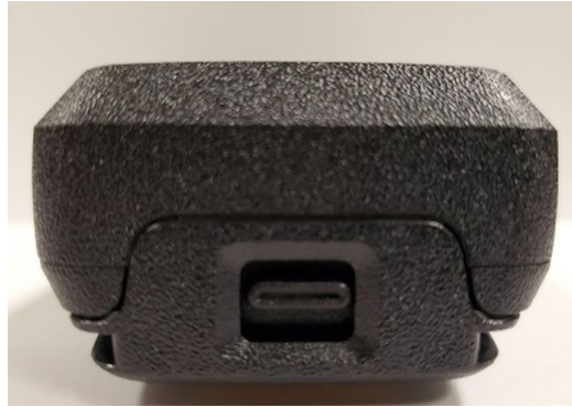
Bottom View with Battery - APX N50 / APX N30