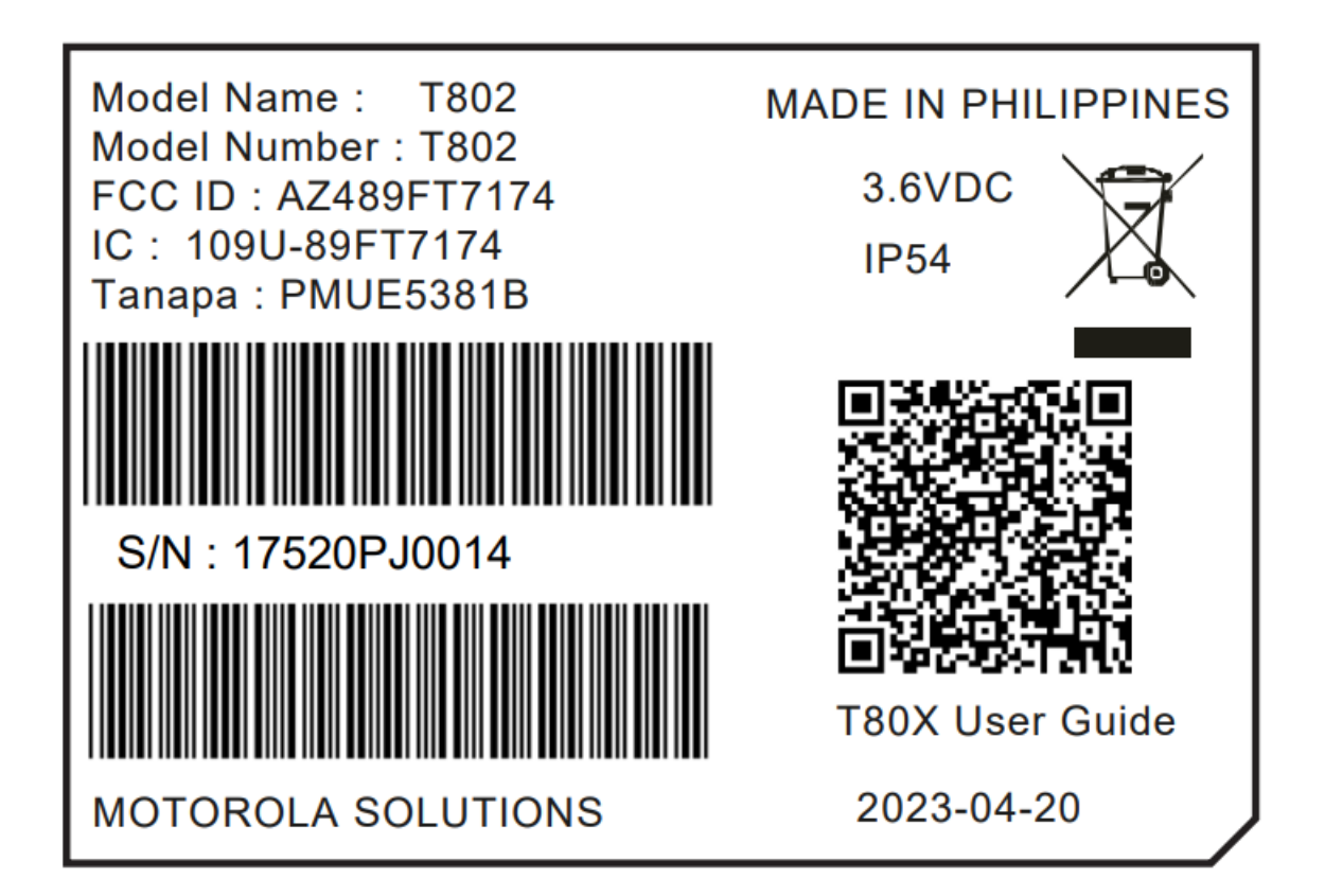
Figure 1: FCC/IC Label for T802

See Exhibit 3 for the actual location of the FCC/IC label on the device. Label Attached Below.