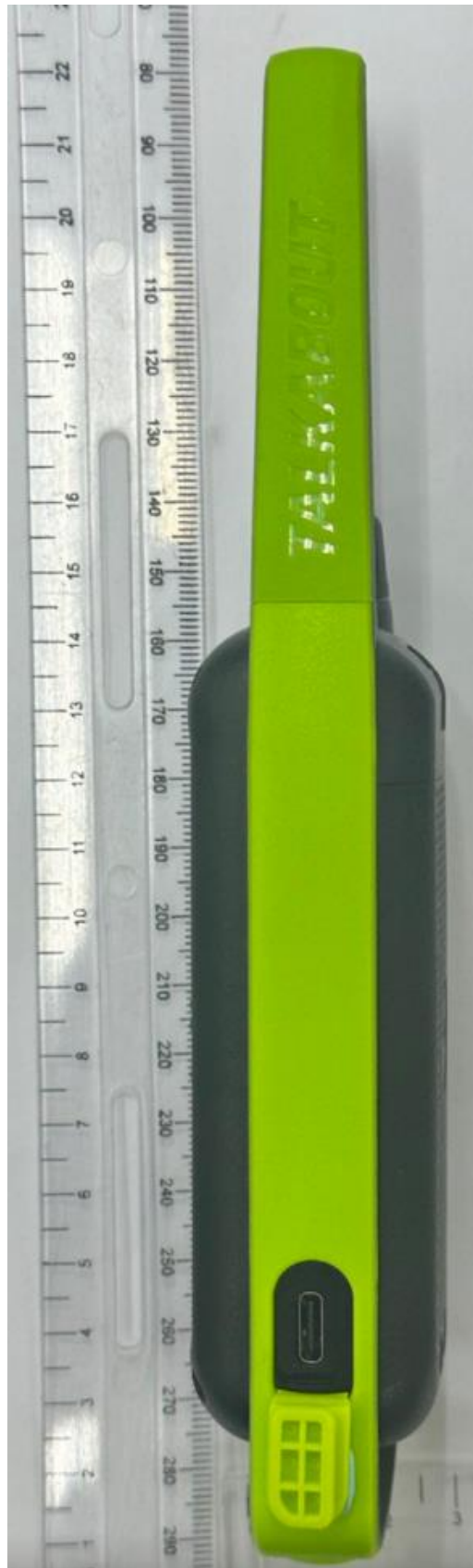
T803 USBC charging port cover opened