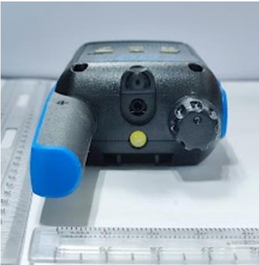
T802 Audio jack cover opened