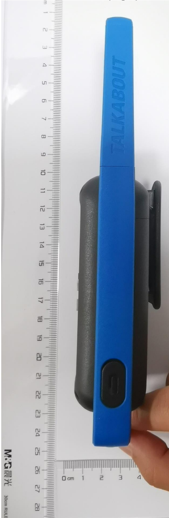
T802 USBC charging port cover closed