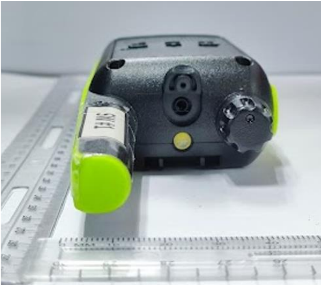
T803 Audio jack cover opened