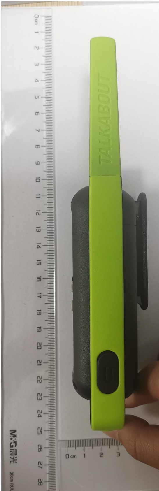
T803 USBC charging port cover closed