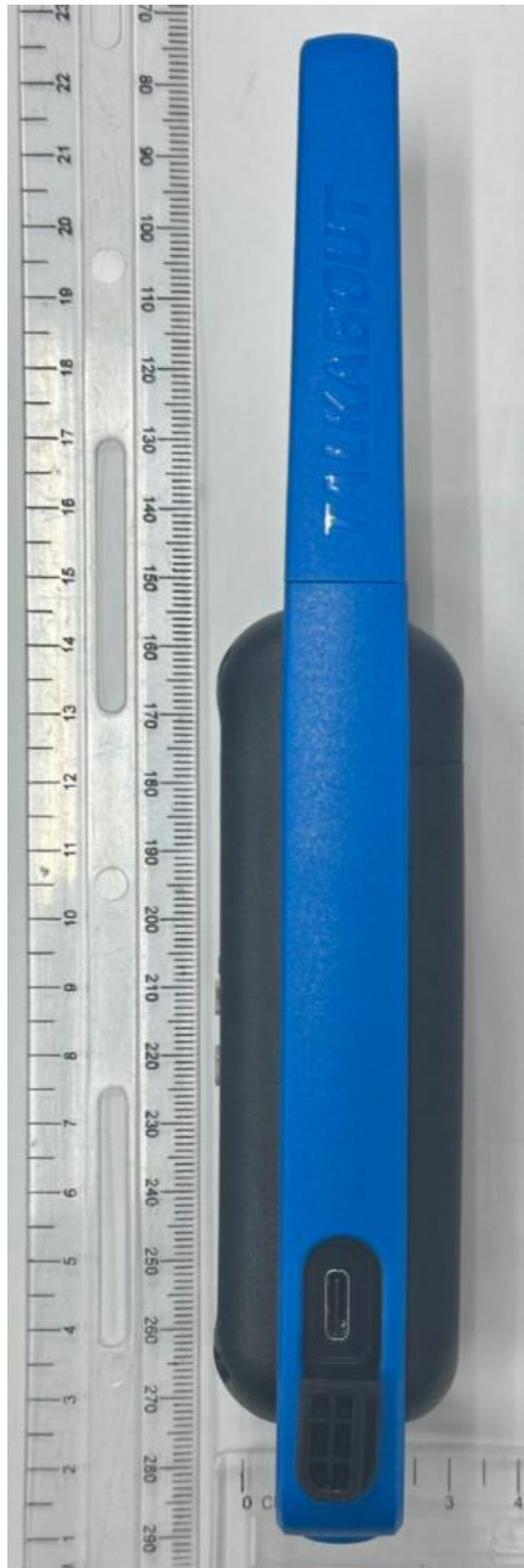
T802 USBC charging port cover opened