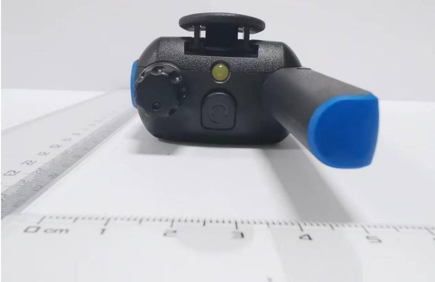
T802 Audio jack cover closed