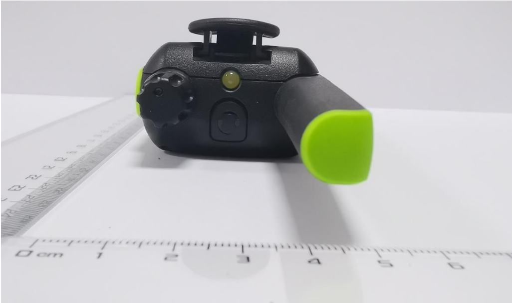
T803 Audio jack cover closed