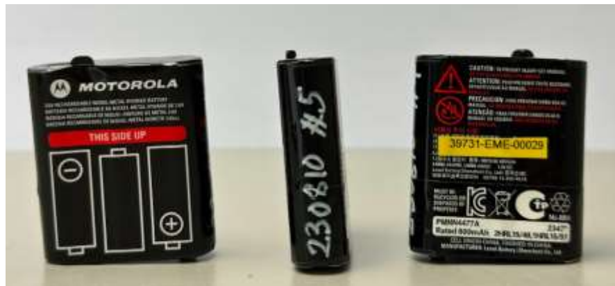
PMNN4477A: Front, Side and back view