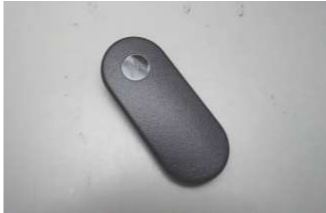
Belt clip 1564028V01 (PMLN7438A)