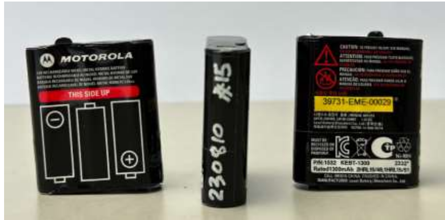
1532: Front, side and Back view