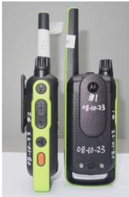
DUT w/ Belt Clip 1564028V01 (PMLN7438A) Side view and back view