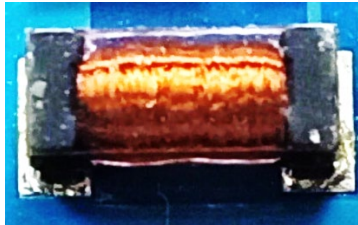
EXHIBIT 3B Antenna Photos and Dimensions (MPP)