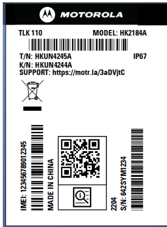
Figure 4: IC Device Label for TLK 110