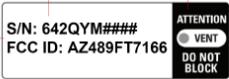
Figure 1: FCC Gore Label for TLK 110