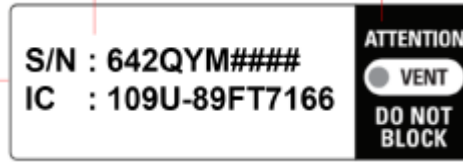
Figure 3: IC Gore Label for TLK 110