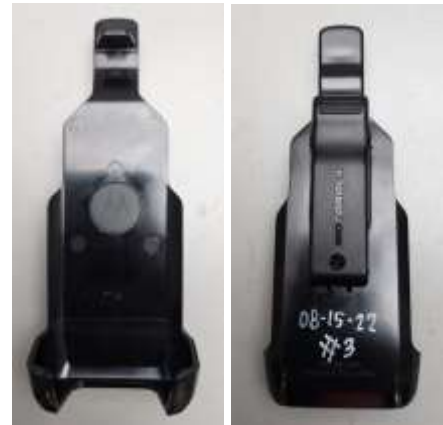
Carry Holster PMLN8439A