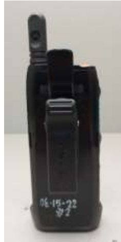
PMLN8439A (Back View)