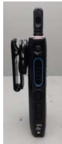
PMLN7128A (Side View)