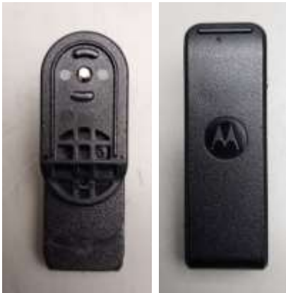
Belt Clip PMLN7128A