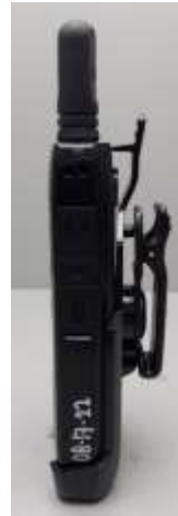
PMLN8439A (Side View)