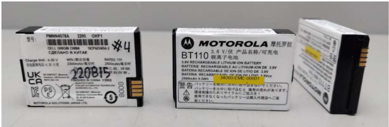
Back, Front, side View: PMNN4578A