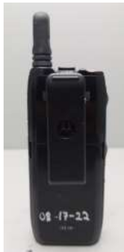
PMLN7128A (Back View)