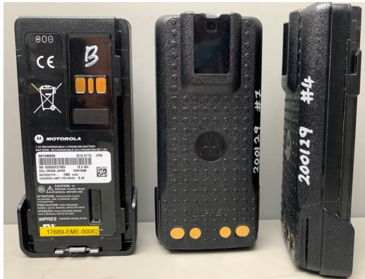
NNTN8560B Front, Back, and Side View