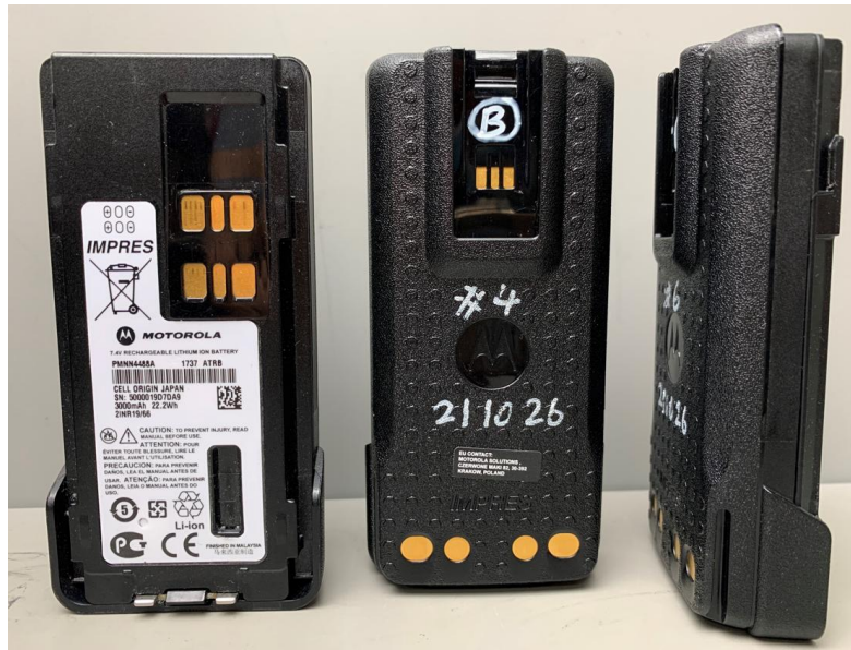
PMNN4488A Front, Back, and Side View