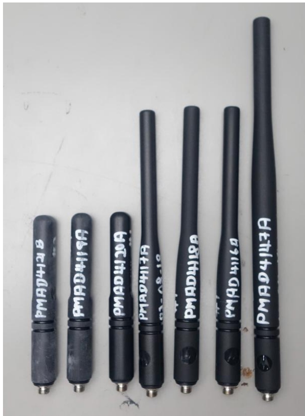
Left to Right: PMAD4121B, PMAD4119A, PMAD4120A, PMAD4117A, PMAD4118A, PMAD4116A, PMAD4147A

Note: only PMAD4116A, PMAD4117A & PMAD4118A were evaluated in the spot check