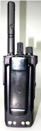
PMLN7296A Back view