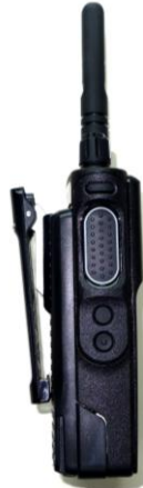
PMLN7296A Side view