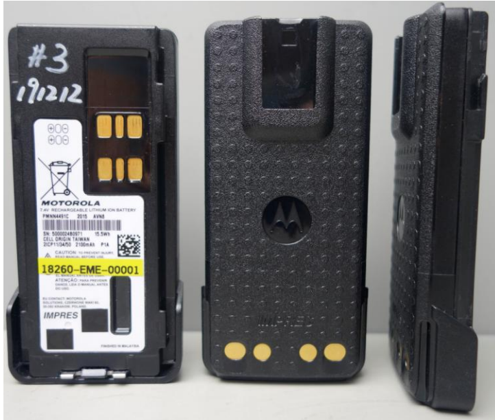
PMNN4491C Front, Back, and Side View