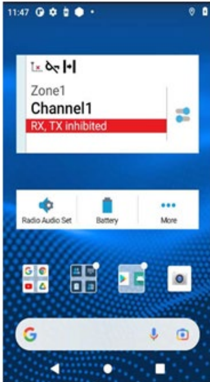
Step 1: Tap the More Button