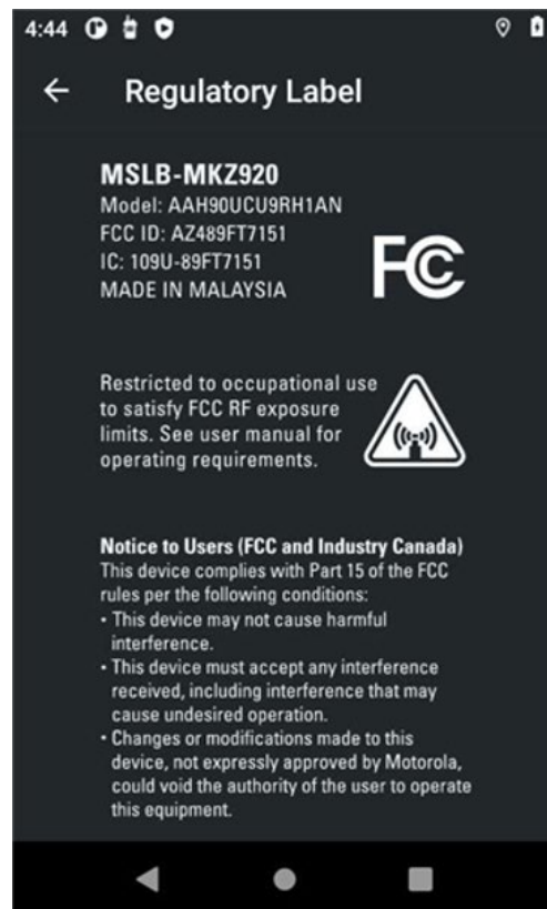
Figure 1: FCC/IC Label for MSLB-MKZ920 (Day Mode and Night Mode)