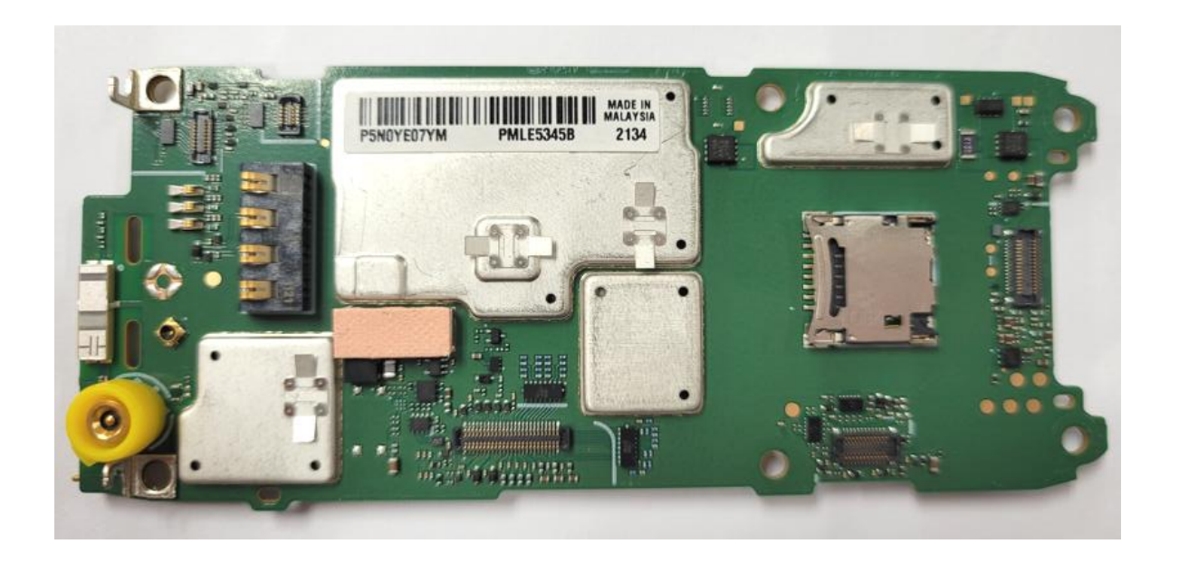
Exhibit 9C - RF Board with Shields (Bottom)

RF Board with Shields (Bottom), Model MXP600