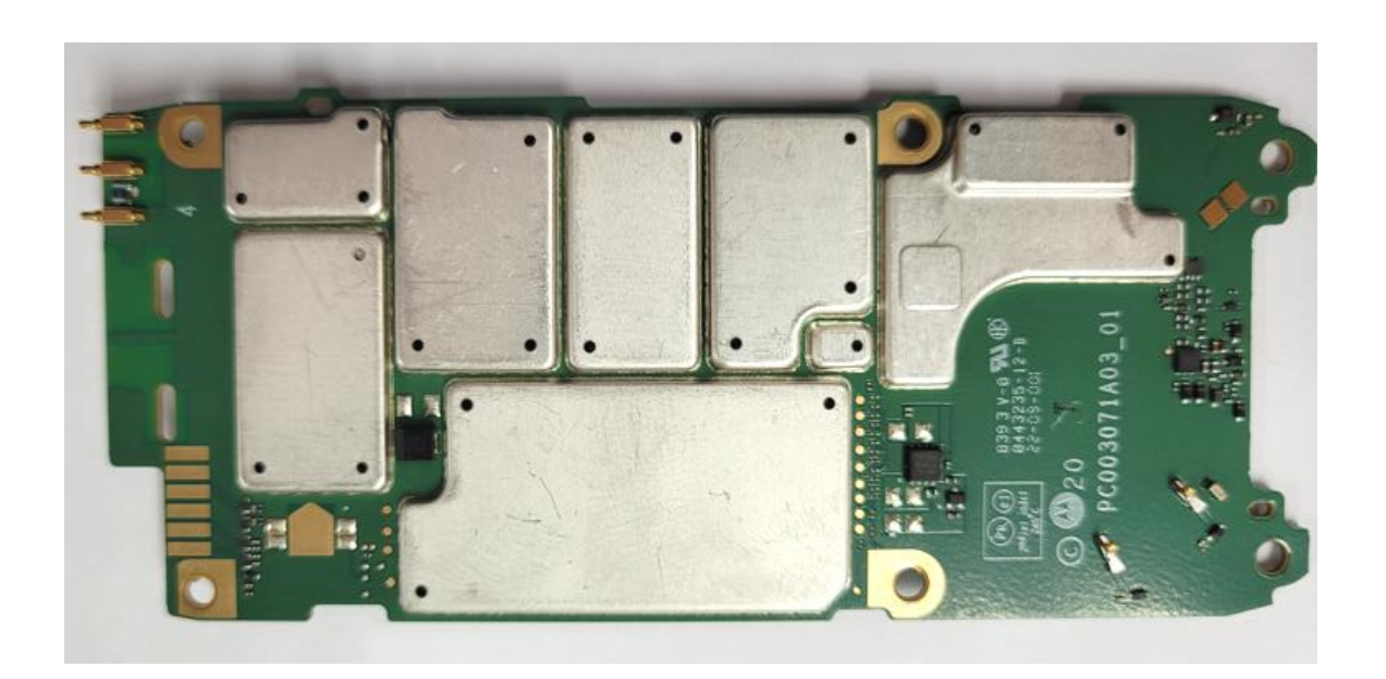
Exhibit 9A – RF Board with Shields (Top)

RF Board with Shields (Top), Model MXP600