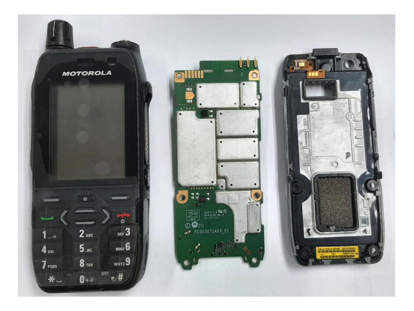
Exhibit 9E – RF Board with Chassis and Housing (Front Side)

RF Board with Chassis and Housing (Front Side), Model MXP600