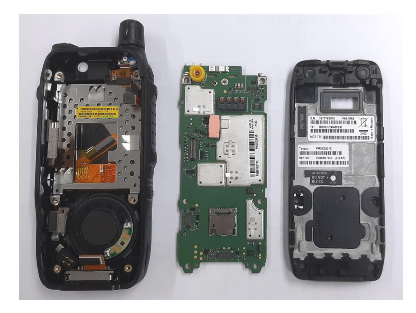
RF Board with Chassis and Housing (Back Side), Model MXP600