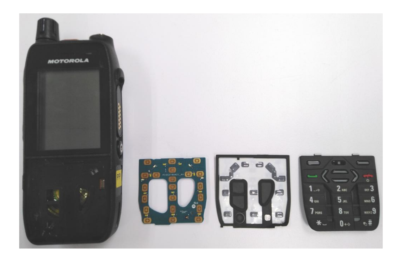
Exhibit 9G – Keypad Board (Front Side)