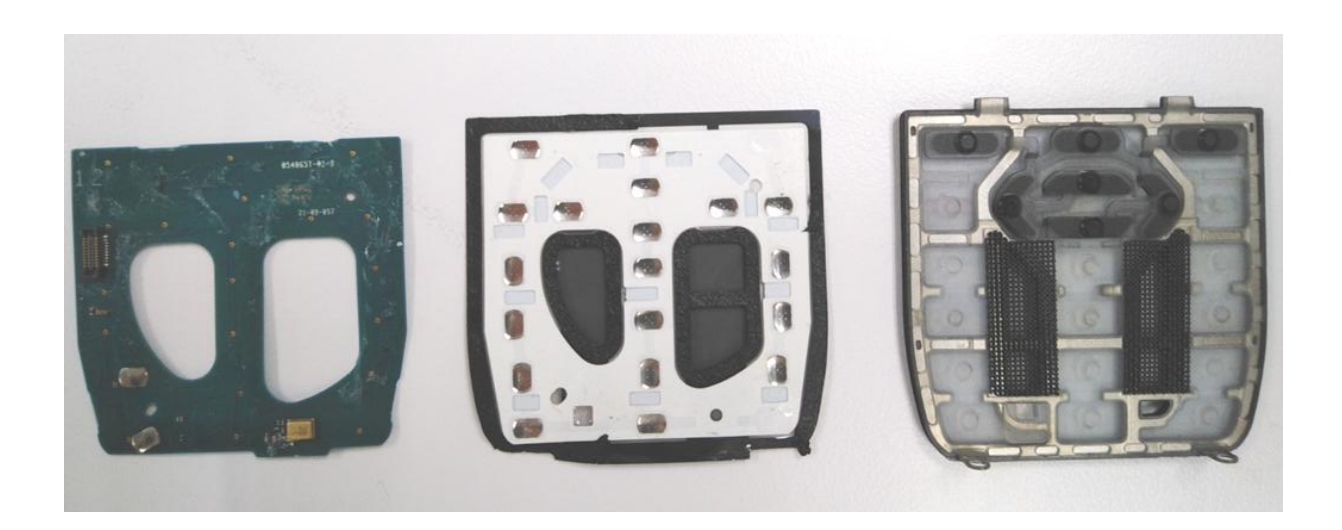
Exhibit 9H - Keypad Board (Back Side)