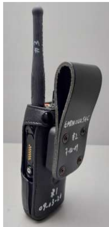
PMLN8185A w/PMLN8025A w/GMDN0445AC