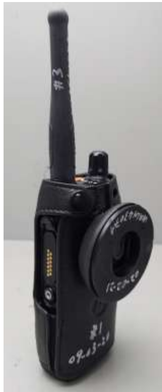
PMLN8185A w/PMLN8025A w/WALN4307