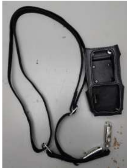
PMLN8184A w/o belt loop w/NTN5243A