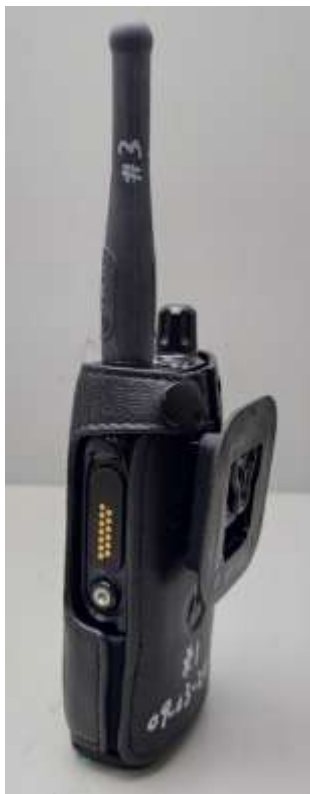
PMLN8185A w/PMLN8025A w/GMDN0386A