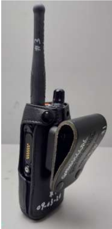
PMLN8185A w/PMLN8025A w/GMDN0566AC