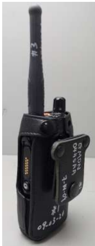
PMLN8185A w/PMLN8025A w/GMDN0445AA