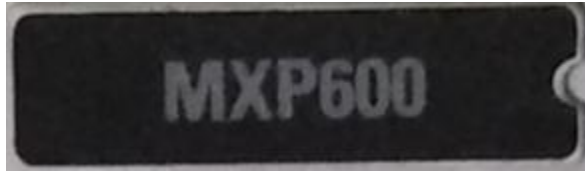
Figure 1: Product Name Label