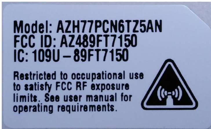
Figure 3: FCC/IC Label