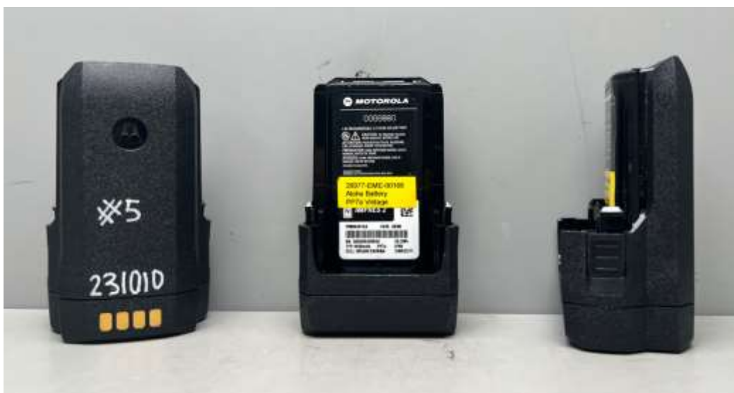
Side, Front, Back View: PMNN4818A