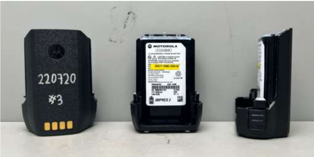
Side, Front, Back View: PMNN4816A