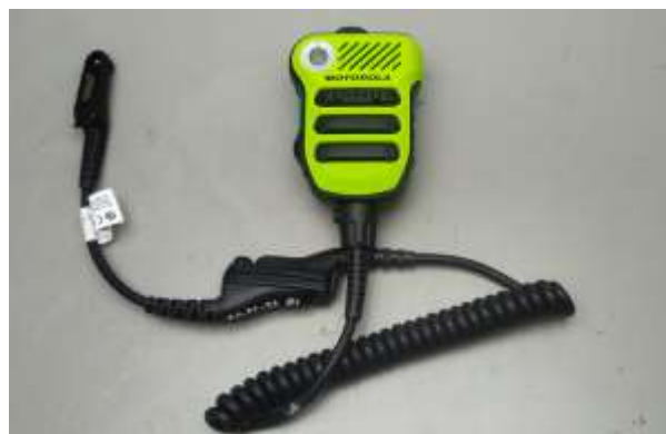
PMMN4137A w/ PMLN8334A