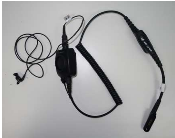
PMLN6829A w/ PMLN8334A w/ PMLN6827A