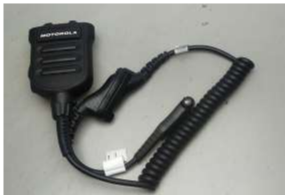
NMN6271A w/ PMLN8334A