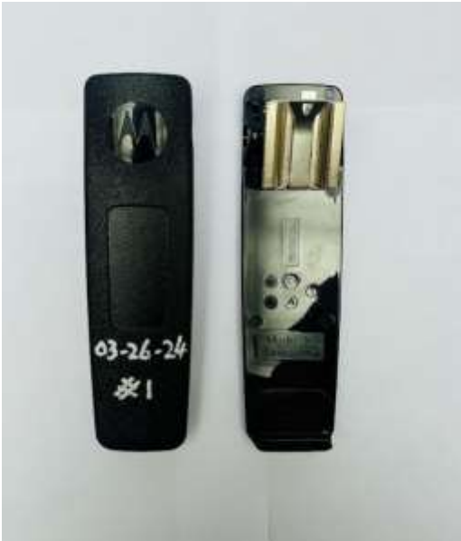
Belt Clip PMLN8508A