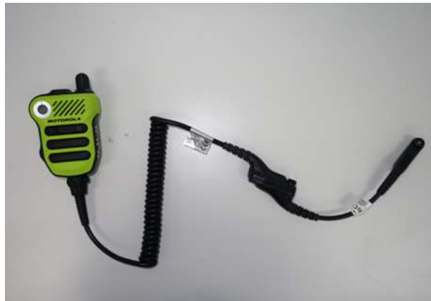
PMMN4132A w/ PMLN8334A