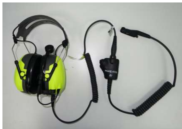
PMLN8265A w/ PMLN8297A