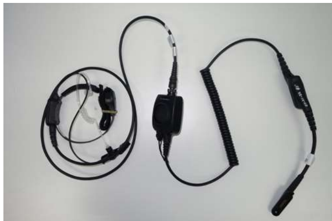
PMLN6827A w/ PMLN8334A w/ PMLN6828A