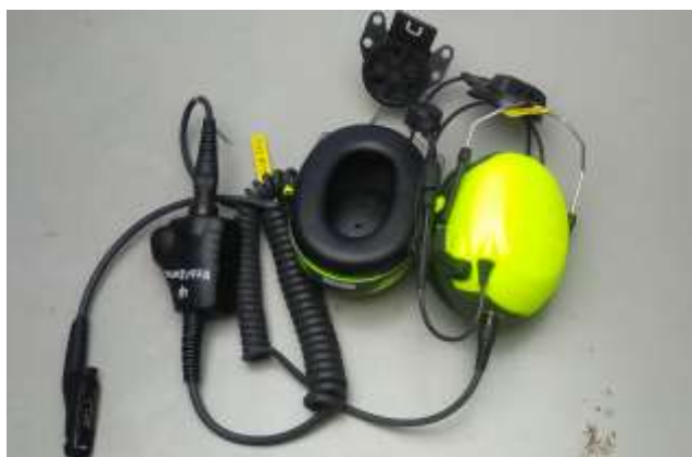
PMLN8267A w/ PMLN8297A