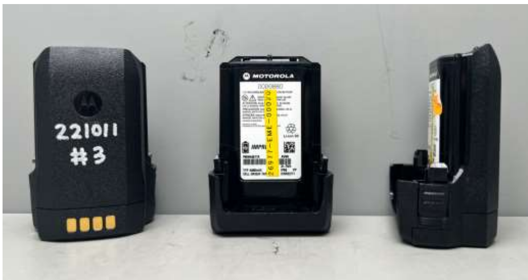
Side, Front, Back View: PMNN4817A