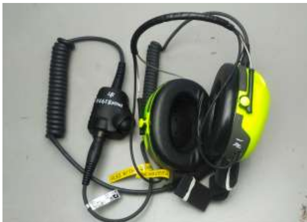
PMLN8266A w/ PMLN8297A