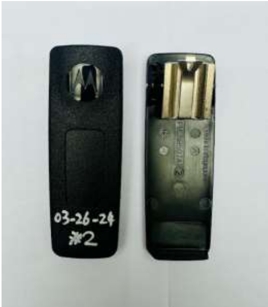
Belt Clip PMLN8507A