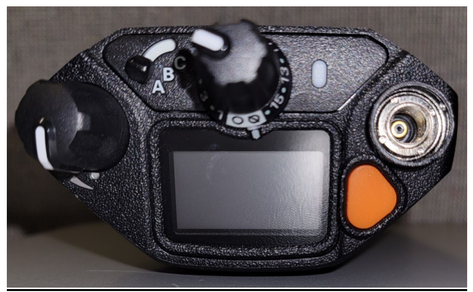
Top View with Battery