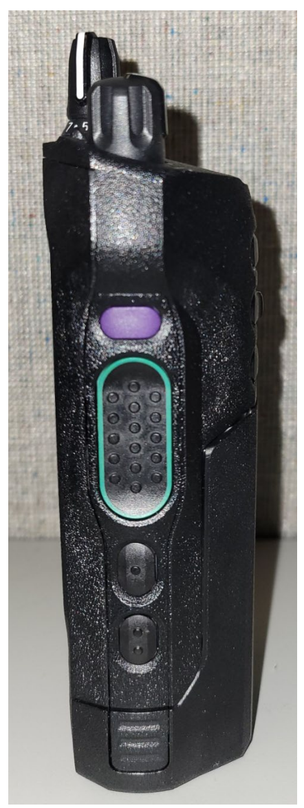
Side View (Right) with Battery