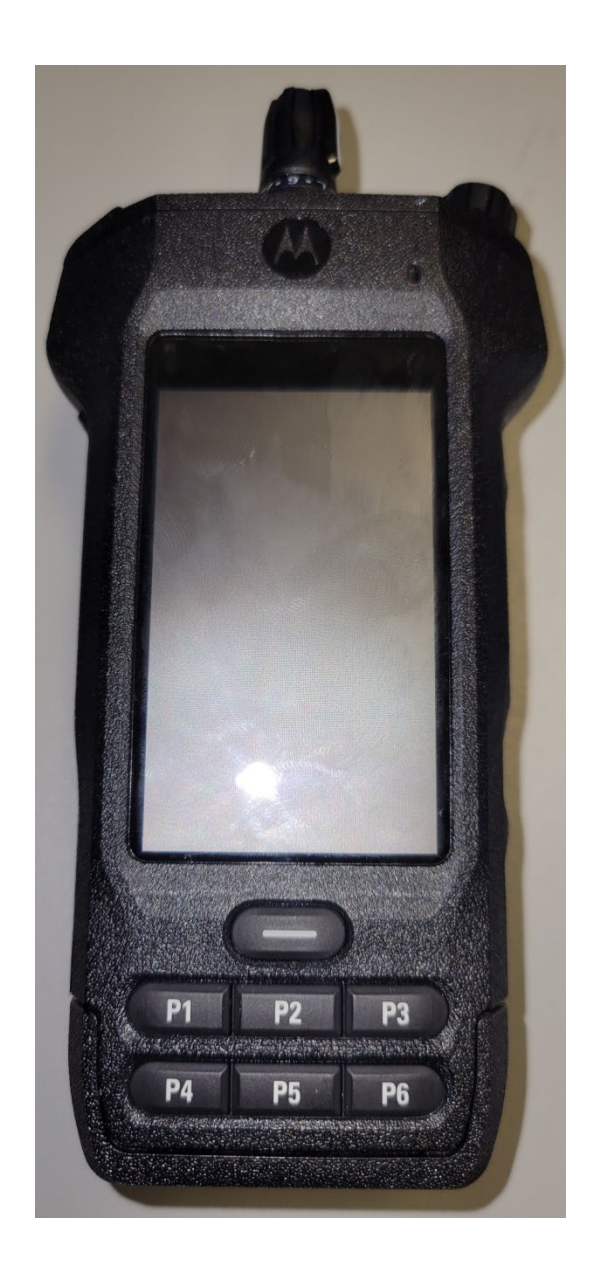
Front view with battery