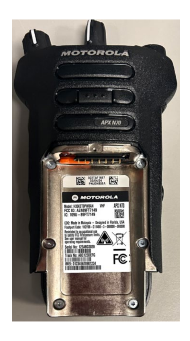
Exhibit 3C - View of FCC/IC Label Location

Model: H35KET9PW8AN VHF FCC ID: AZ489FT7149 IC: 109U - 89FT7149