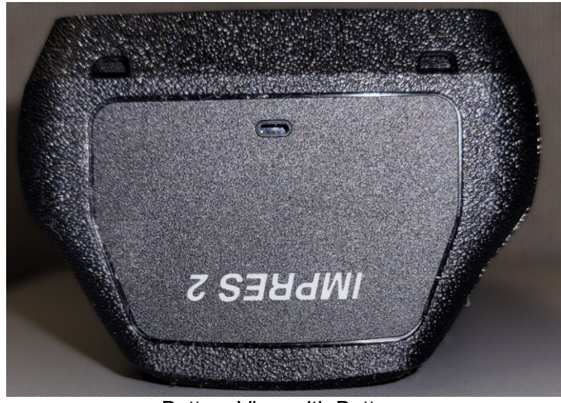
Bottom View with Battery