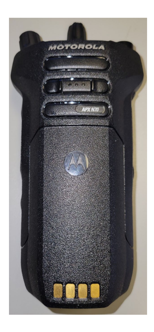
Back View with Battery