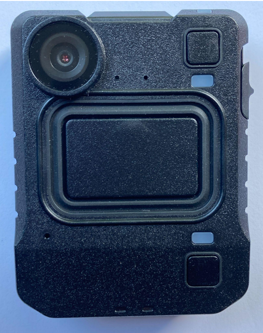
EXHIBIT 3A: Front View