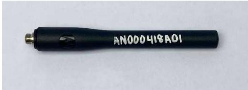
New Antenna Photo

Please refer to original filing report for other accessories