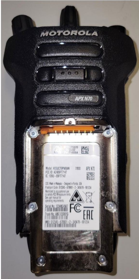
Back View (FCC/IC label) location (Model: H35UCT9PW8AN)