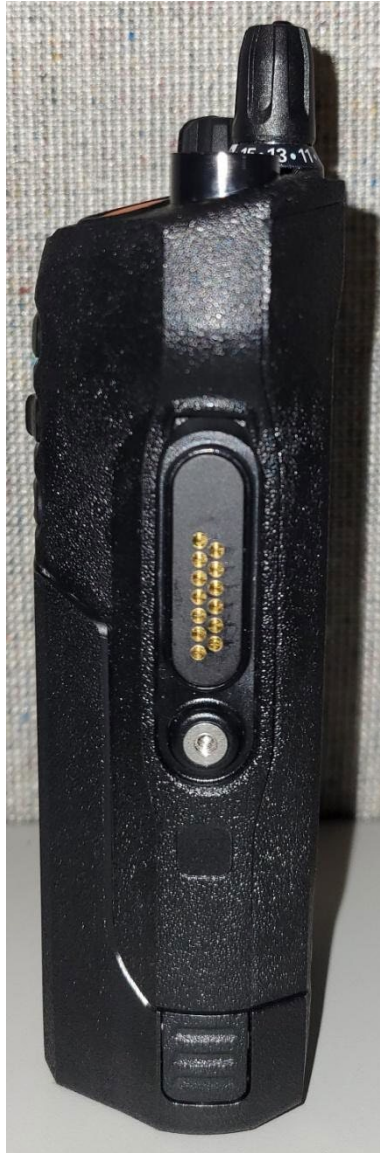
Side View (Left) with Battery