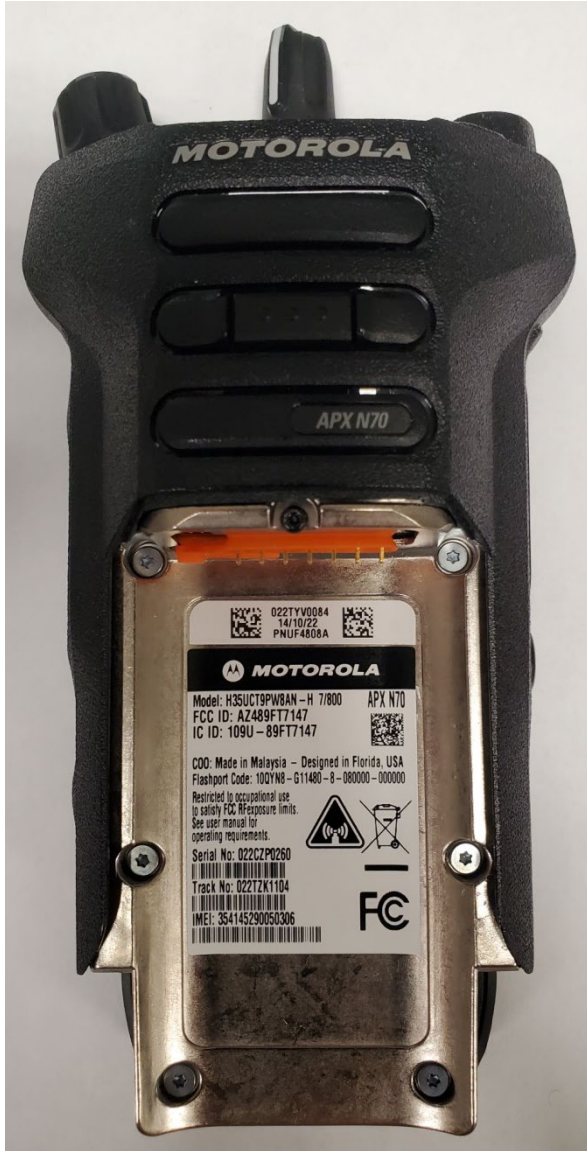
Back View (FCC/IC label) location (Model: H35UCT9PW8AN-H)