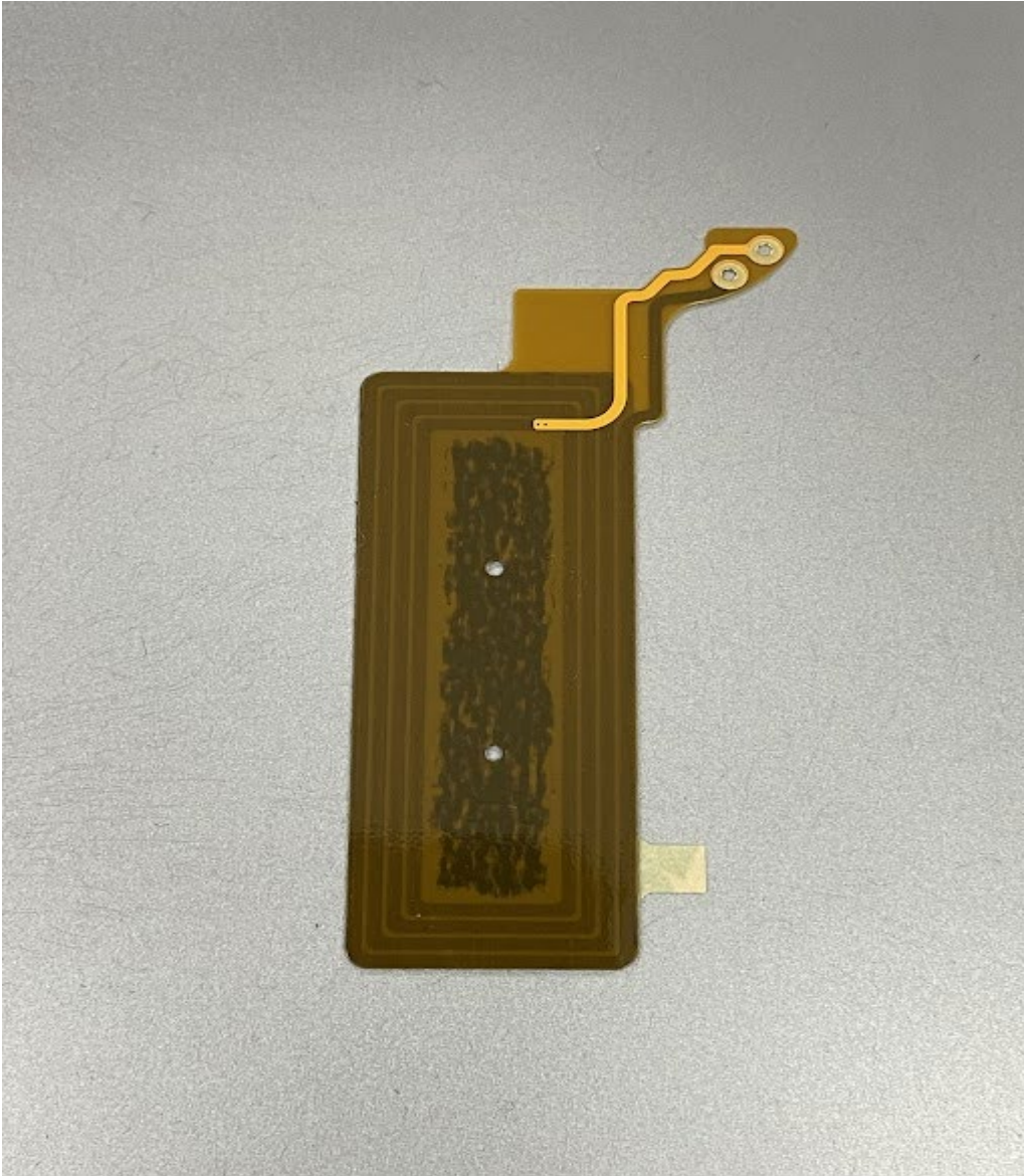
EXHIBIT 3A Antenna Photos and Dimensions (NFC)

The following are the Part 15 antenna information