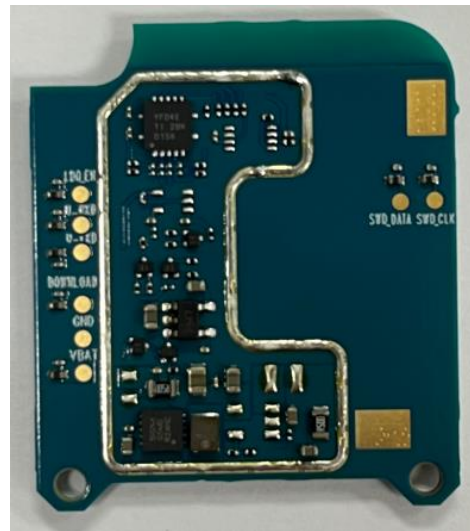
LMR WUS PCB