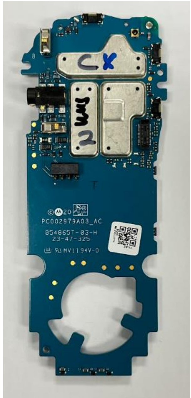
LMR WUS PCB