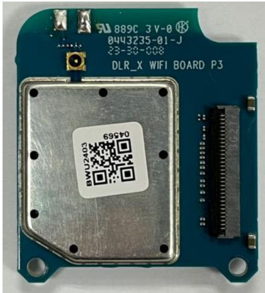
LMR Multek PCB