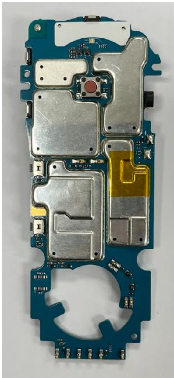
LMR WUS PCB