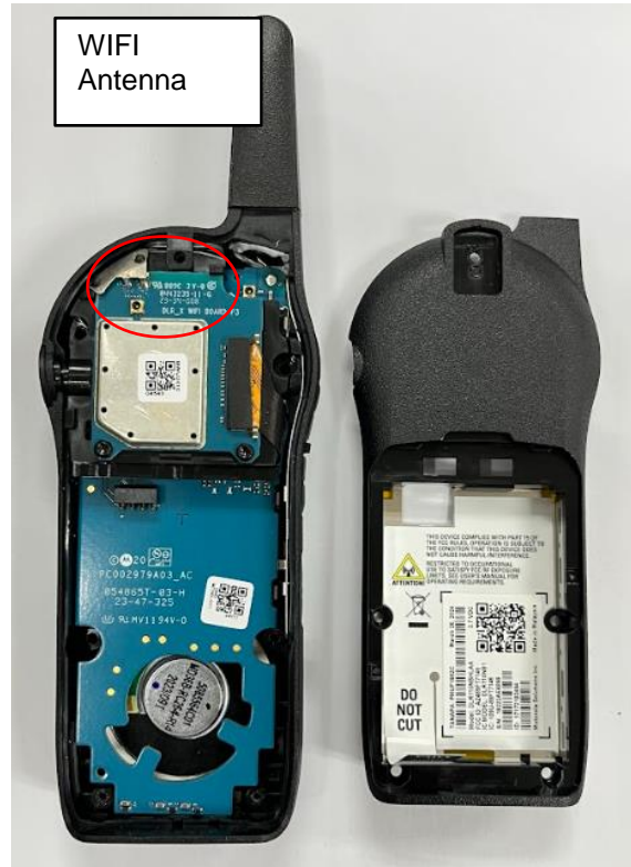
LMR WUS PCB