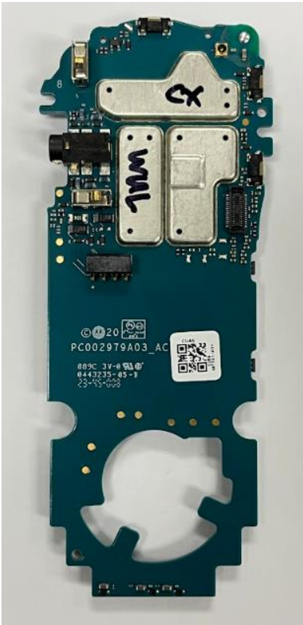
LMR Multek PCB