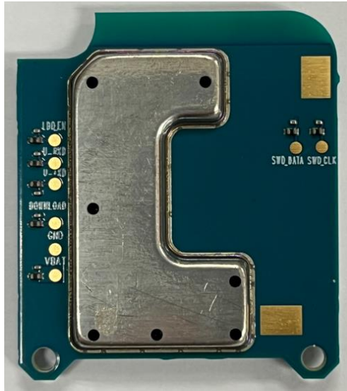
LMR Multek PCB