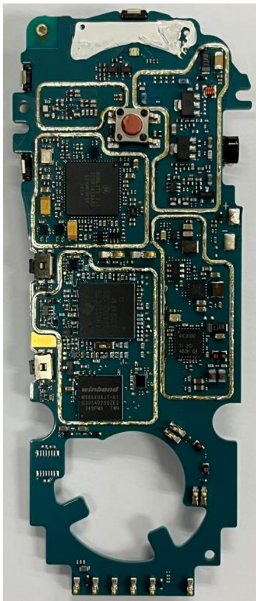
LMR Multek PCB