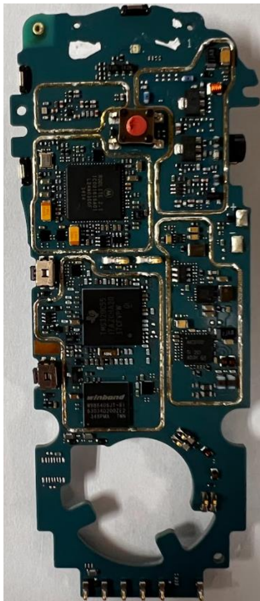
LMR WUS PCB