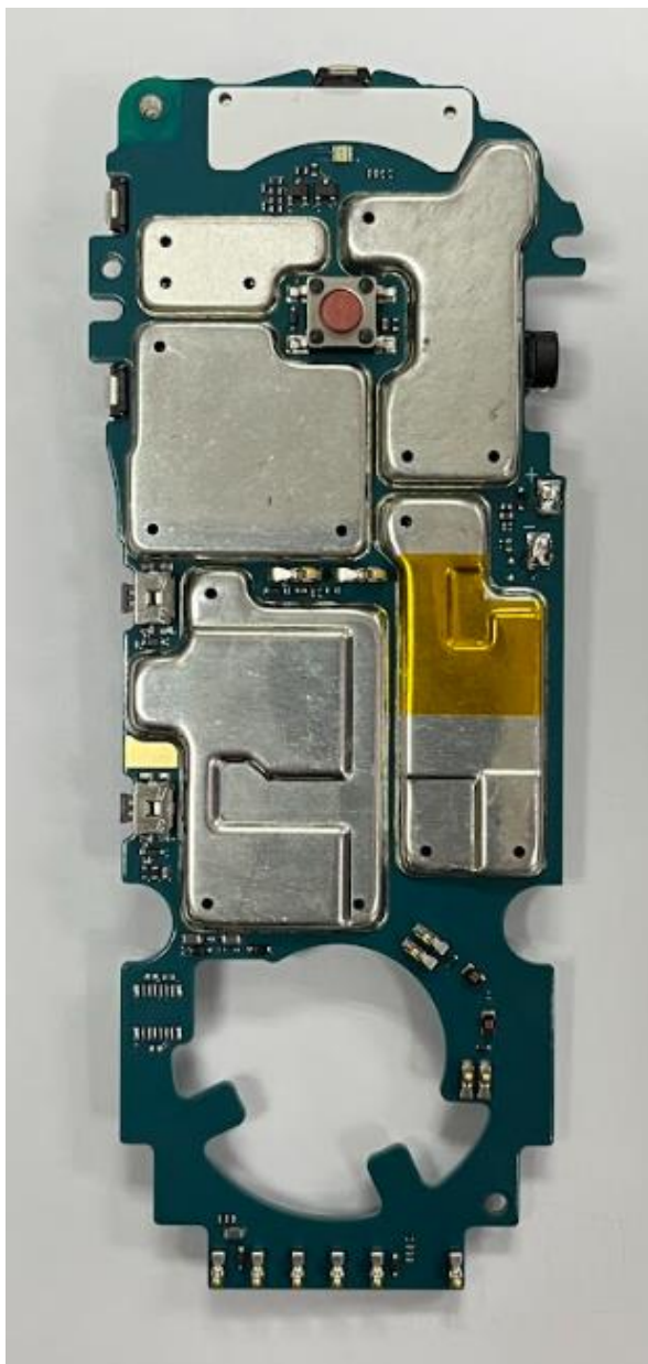
LMR Multek PCB