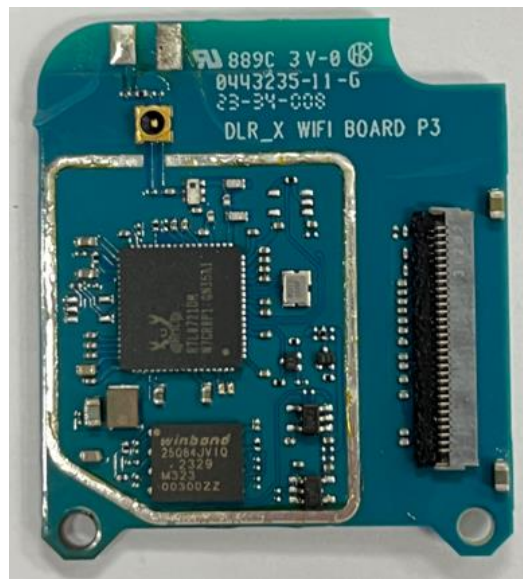
LMR WUS PCB