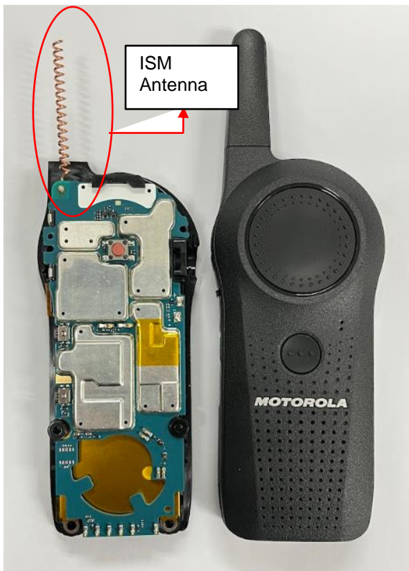
LMR Multek PCB