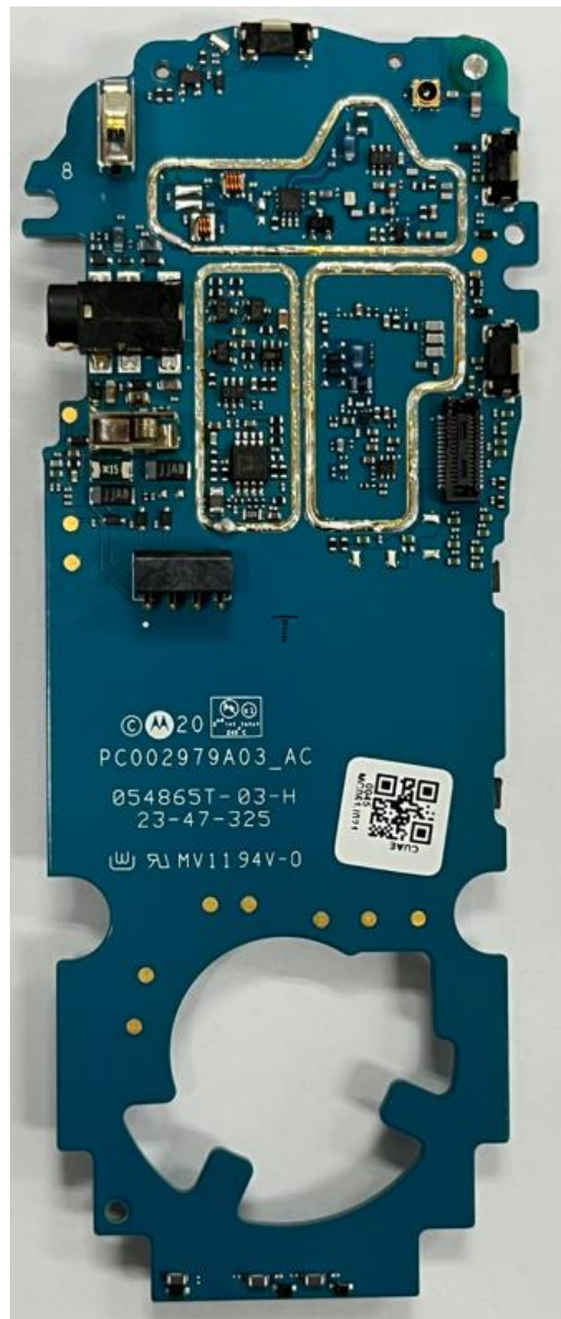
LMR WUS PCB