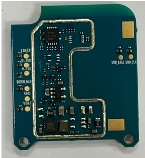
LMR Multek PCB