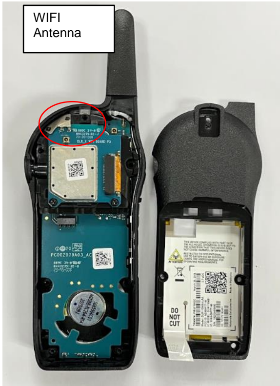
LMR Multek PCB