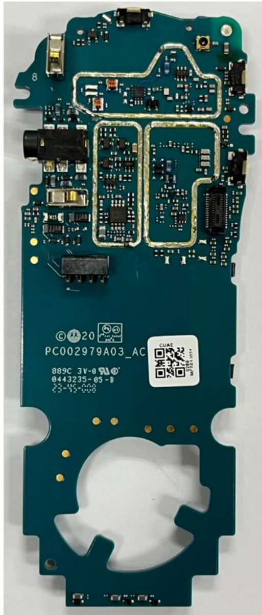
LMR Multek PCB