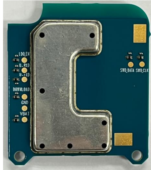
LMR WUS PCB