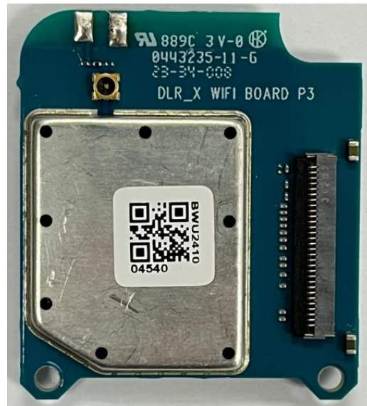
LMR WUS PCB