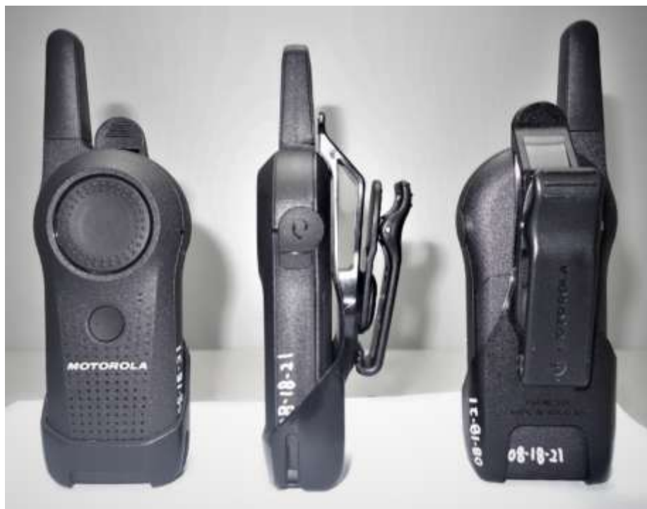
DUT with Body worn PMLN8392A front, side and back view