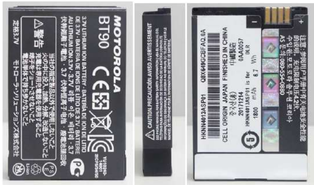
HKNN4013ASP01 (Front, side and back View)