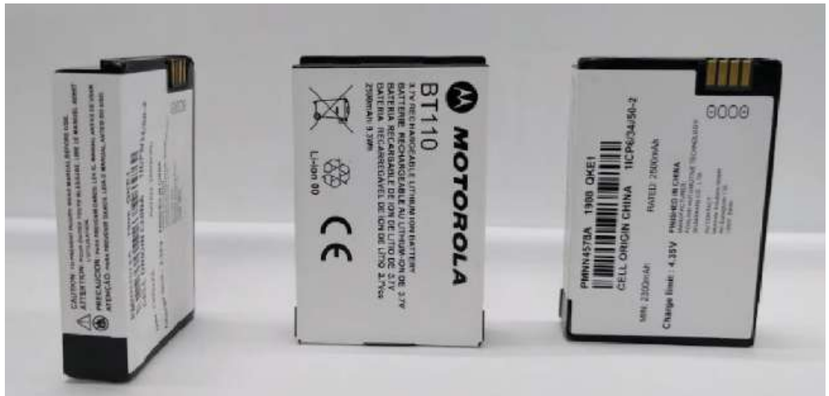
PMNN4578A (Side, Front and Back View)