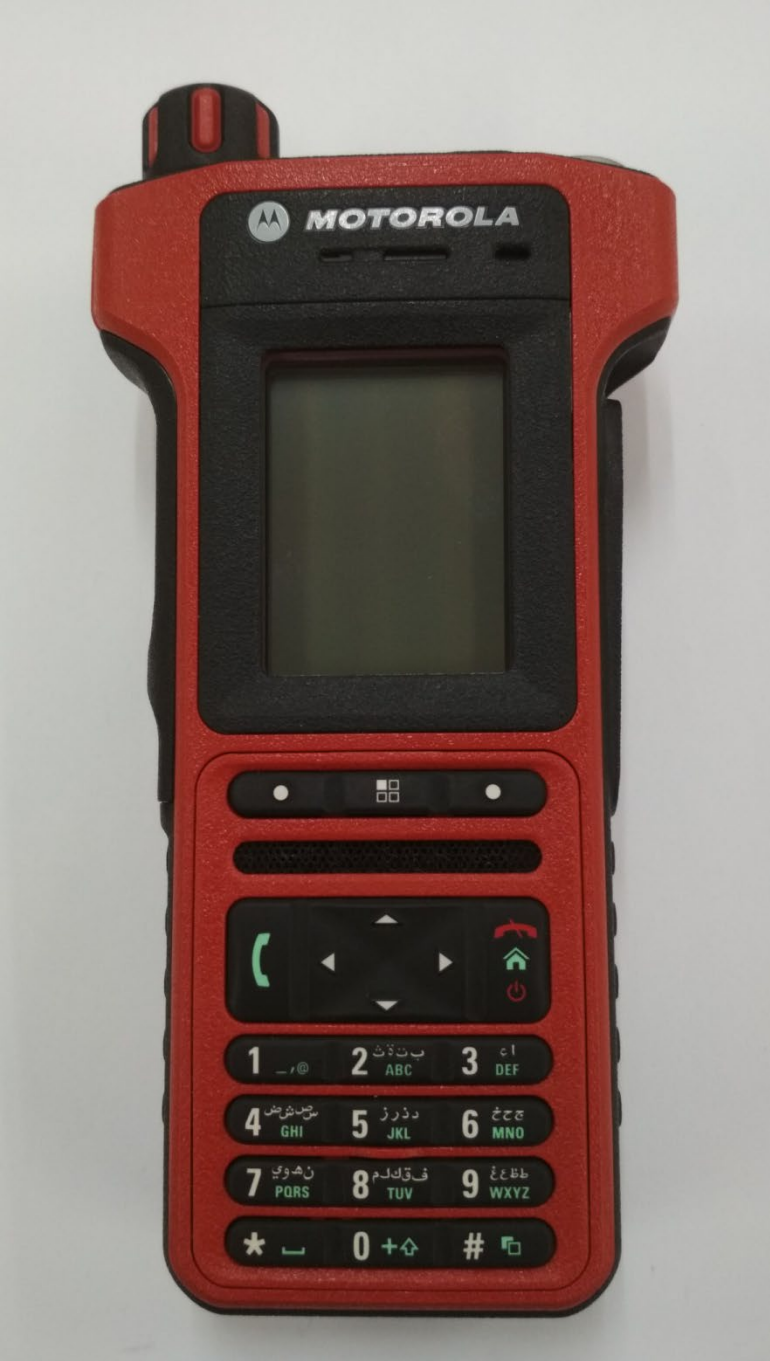
Front view with display and full keypad model, Model MTP8550Ex