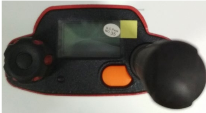
Top View (with Antenna), Model MTP8550Ex / MTP8500Ex