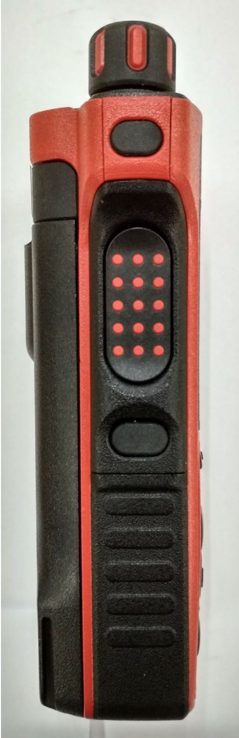
Side View (Left), Model MTP8550Ex / MTP8500Ex