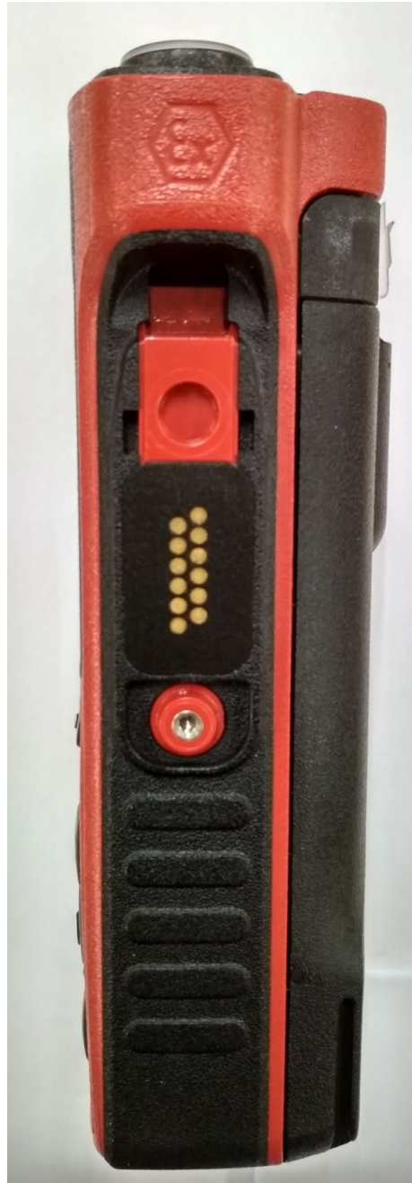
Side View (Right), Model MTP8550Ex / MTP8500Ex