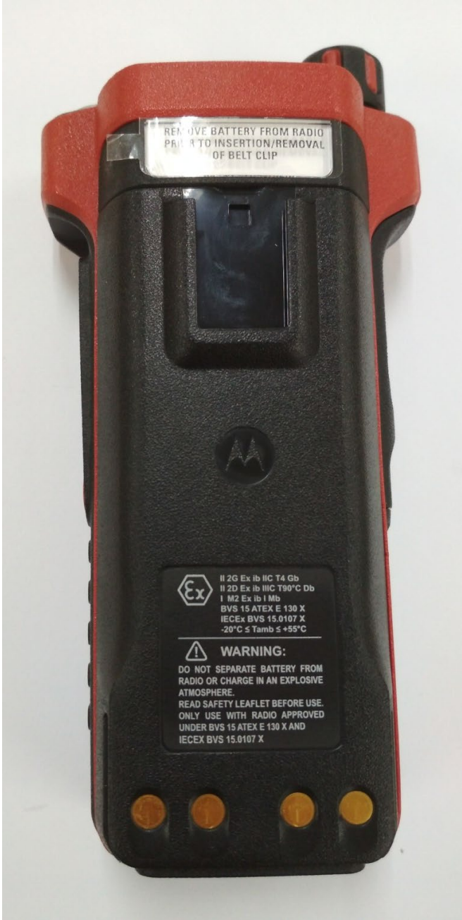
Back View with Battery, Model MTP8550Ex / MTP8500Ex