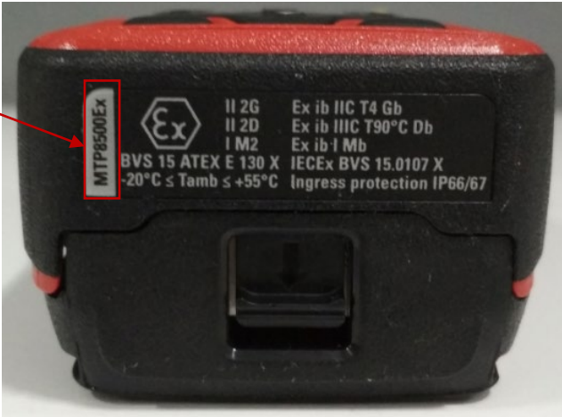
Bottom View with Battery, Model MTP8550Ex / MTP8500Ex