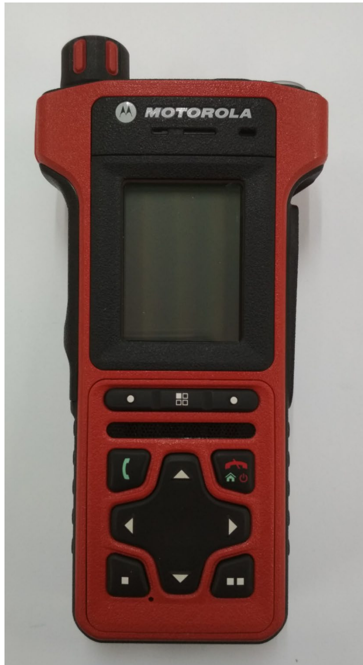
Front view with display and limited keypad model, Model MTP8500Ex