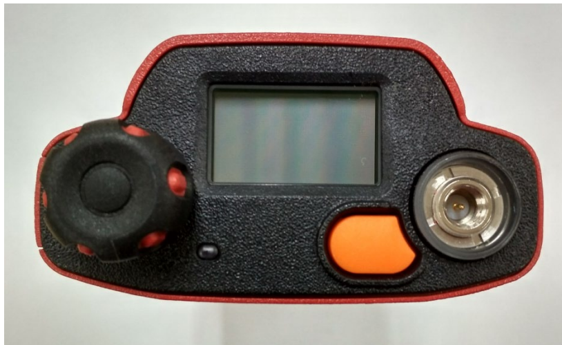
Top View (without Antenna), Model MTP8550Ex / MTP8500Ex