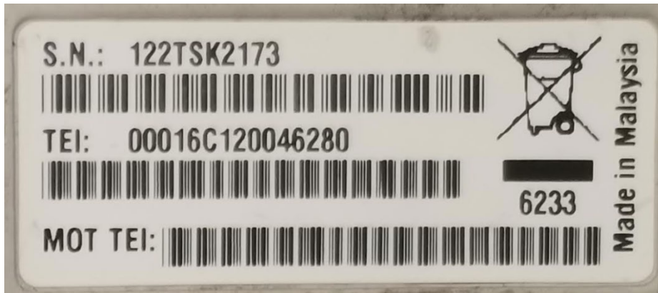
Figure 1: Manufacturer Location Label