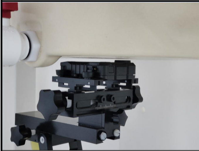
Front Face of EUT with 0.5 cm Gap