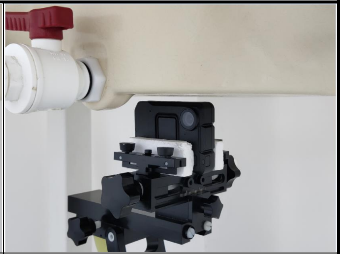
Left Side of EUT with 0.5 cm Gap