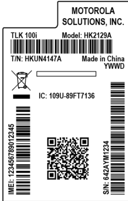
Figure 2: IC Label