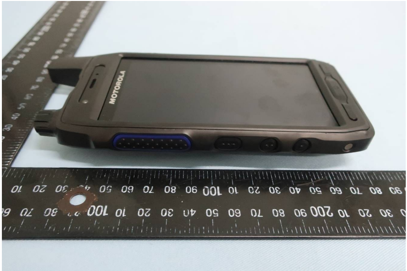
Side View (Left)