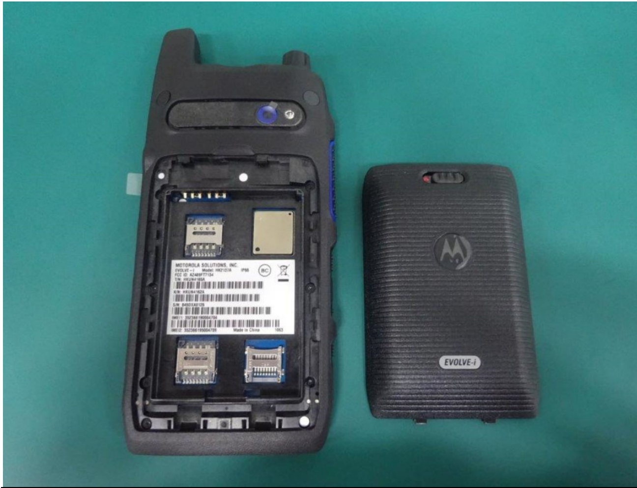
Back View [FCC Label Location]