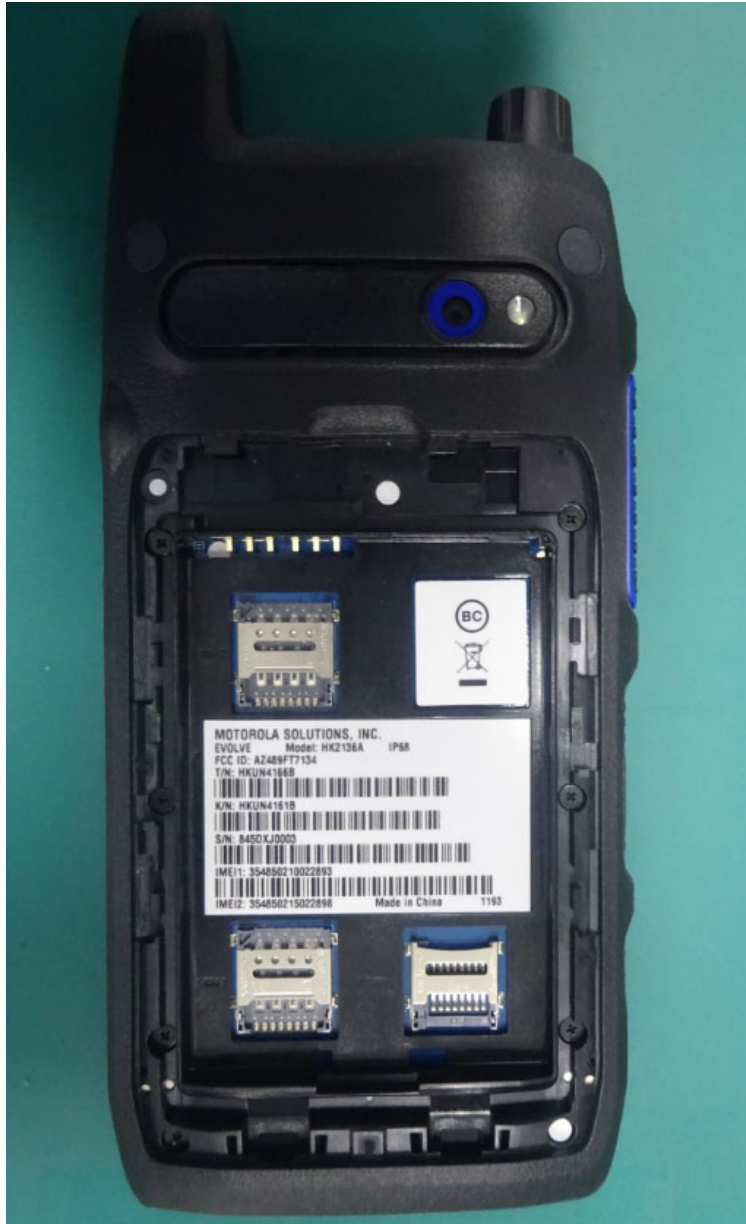
Back View [FCC Label Location]