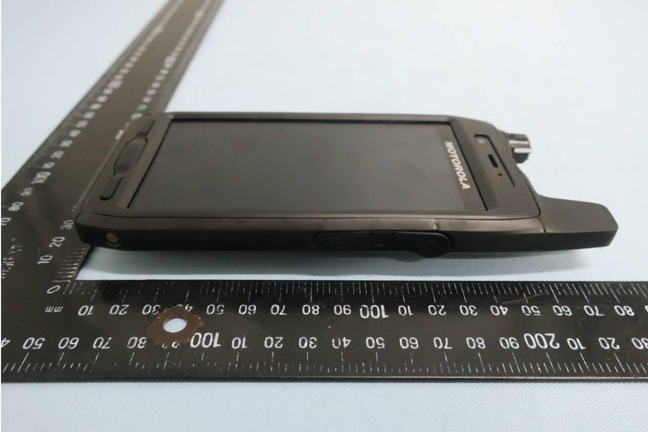
Side View (Right)