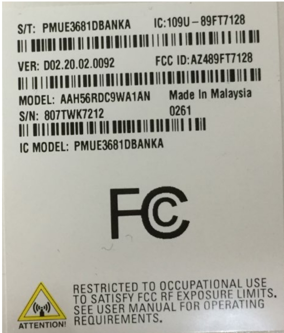
Figure 1D: Label for Non Keypad Model (NKP) AAH56RDC9WA1AN / PMUE3681DBANKA