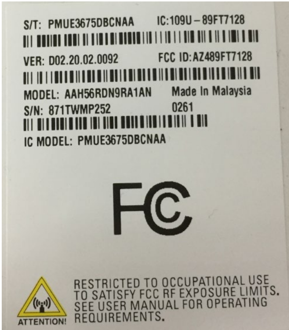
Figure 1A: Label for Full Keypad with Display Model (FKP) AAH56RDN9RA1AN / PMUE3675DBCNAA