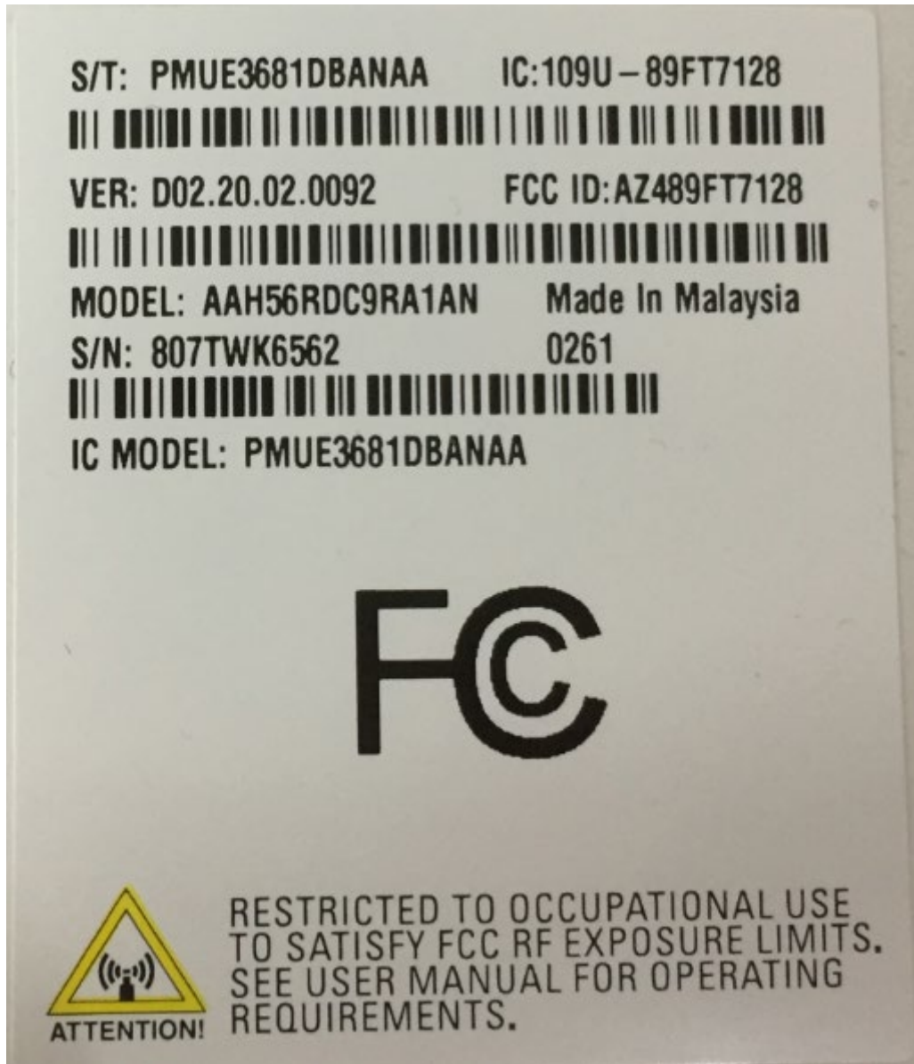
Figure 1C: Label for Non Keypad Model (NKP) AAH56RDC9RA1AN / PMUE3681DBANAA