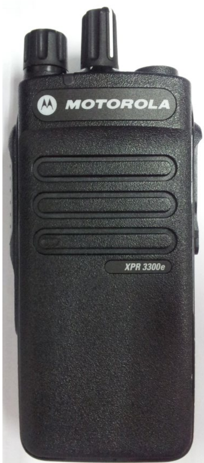
Front view with non keypad Plain model – (XPR 3300e)