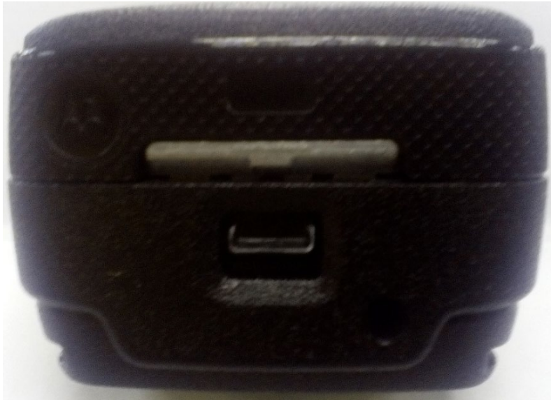
Bottom View with Battery for Limited Keypad and Plain Model – XPR 3500e & XPR 3300e