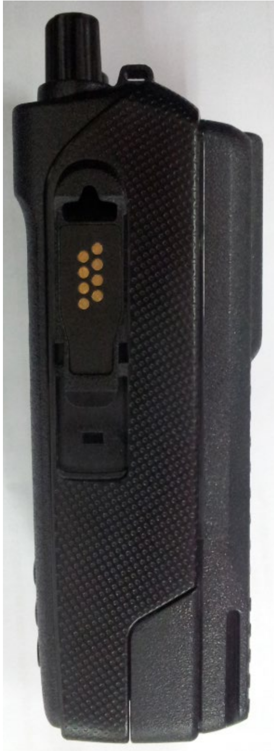
Side View for Limited Keypad and Plain Model (Right) – XPR 3500e & XPR 3300e