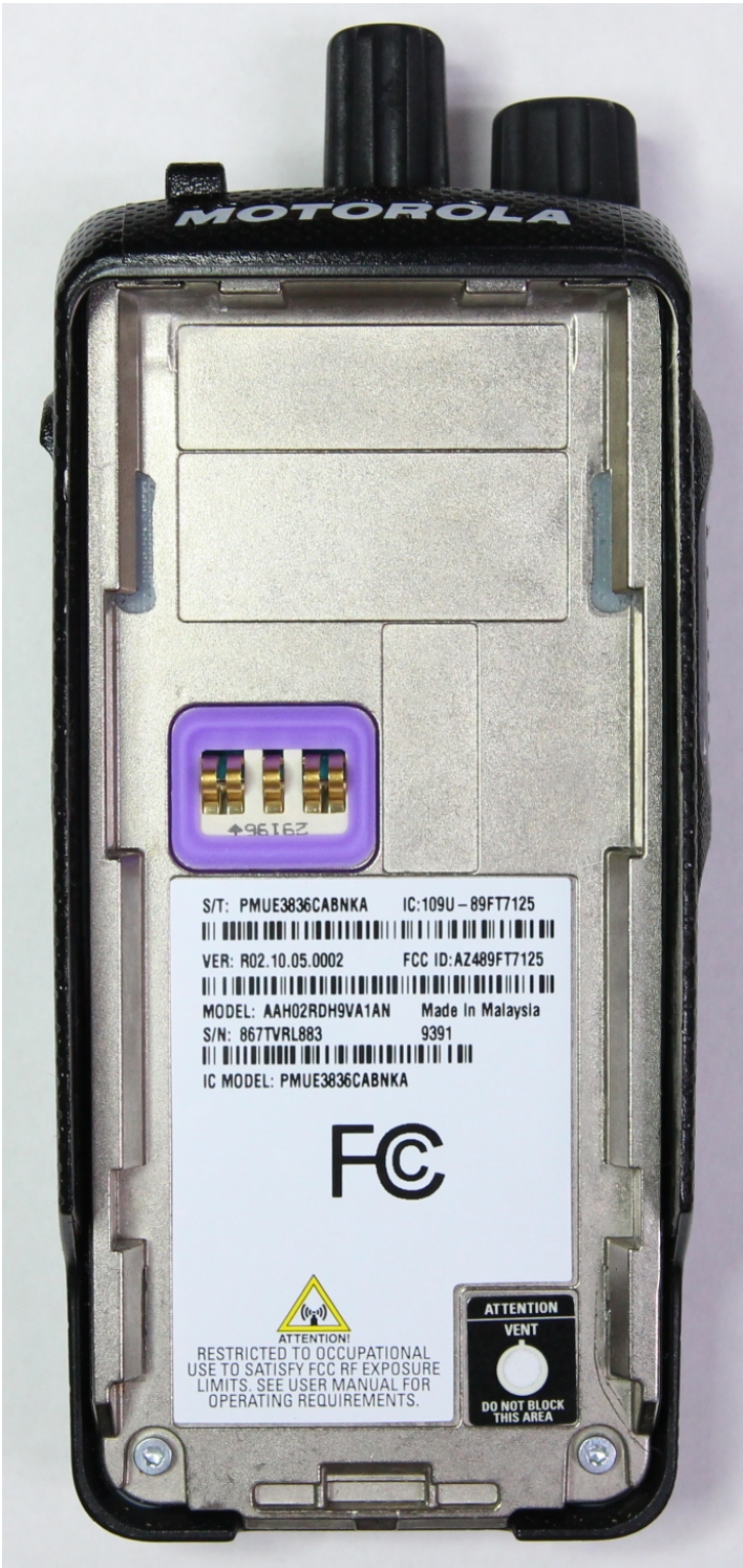
Back View for Limited Keypad and Plain Model (FCC/IC label) – XPR 3500e & XPR 3300e