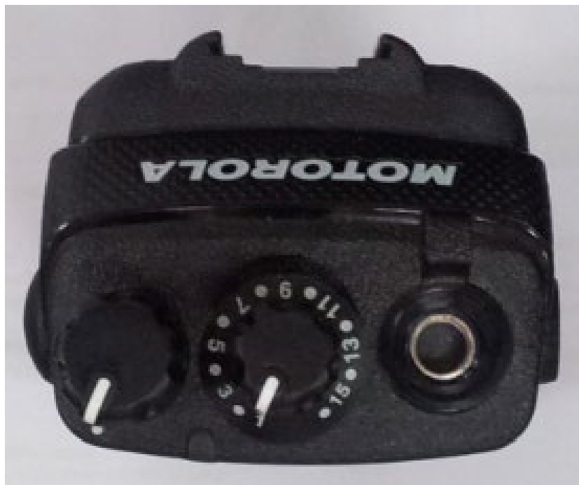
Top View for Limited Keypad and Plain Model (without Antenna) – XPR 3500e & XPR 3300e