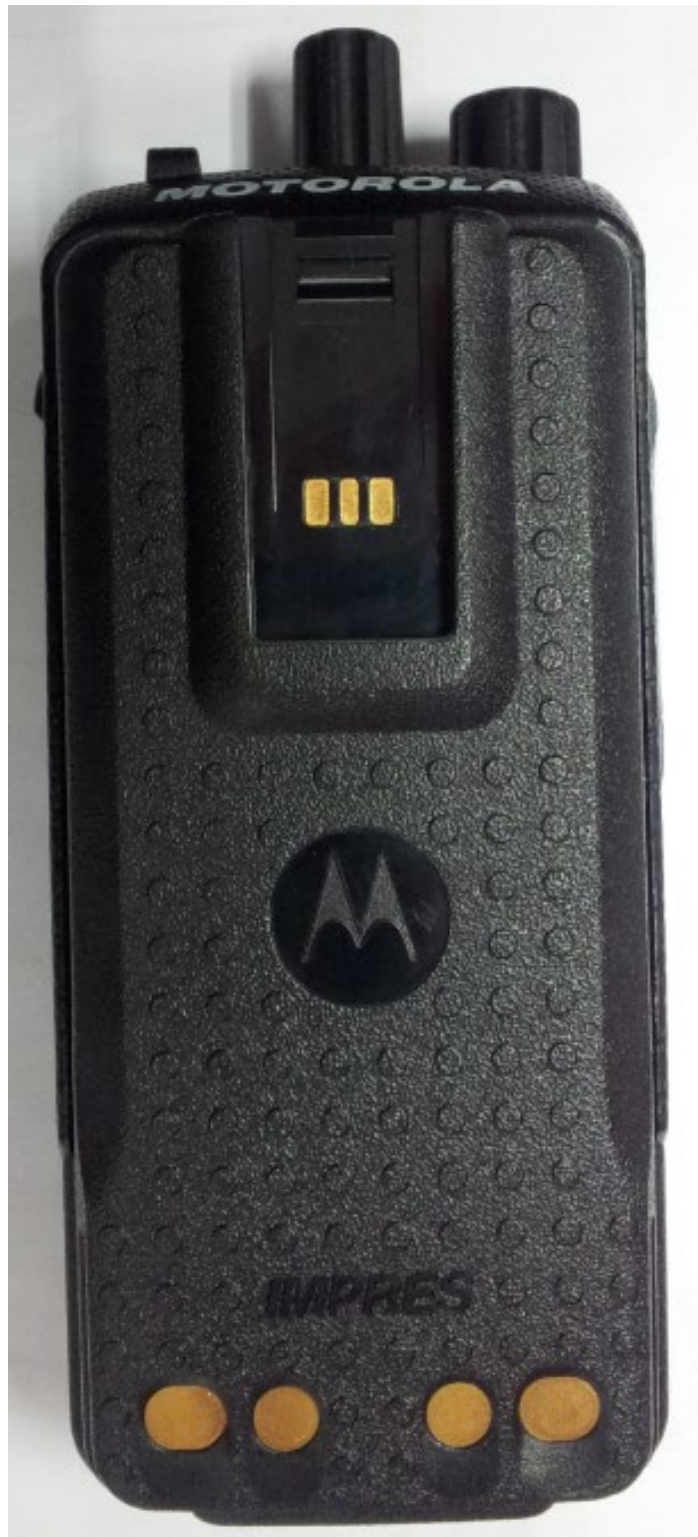
Back View with battery for Limited Keypad and Plain Model (XPR 3500e & XPR 3300e)