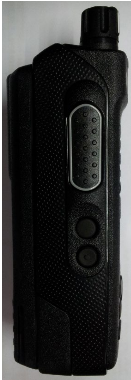
Side View for Limited Keypad and Plain Model (Left) – XPR 3500e & XPR 3300e