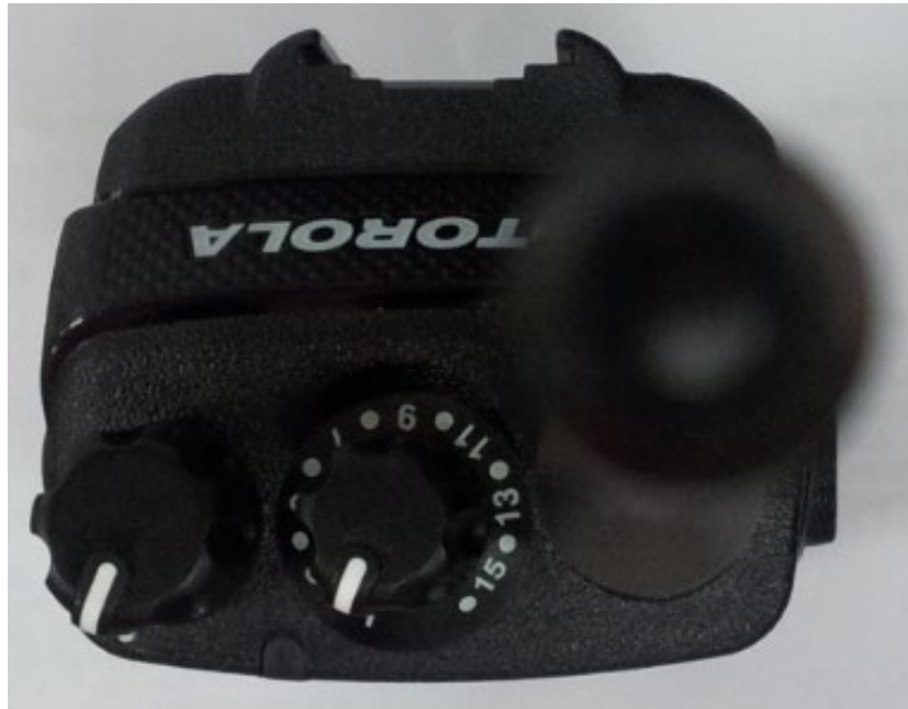
Top View for Limited Keypad and Plain Model (with Antenna) – XPR 3500e & XPR 3300e