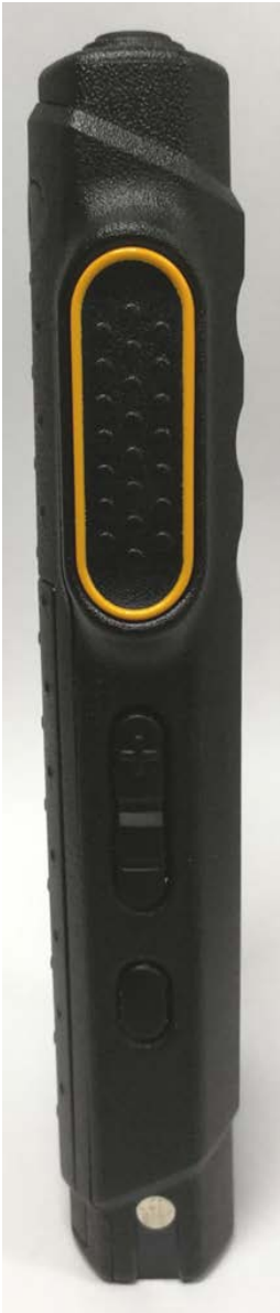
Side View (Right)