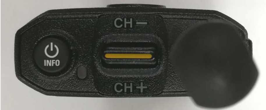
Top View (with Antenna)