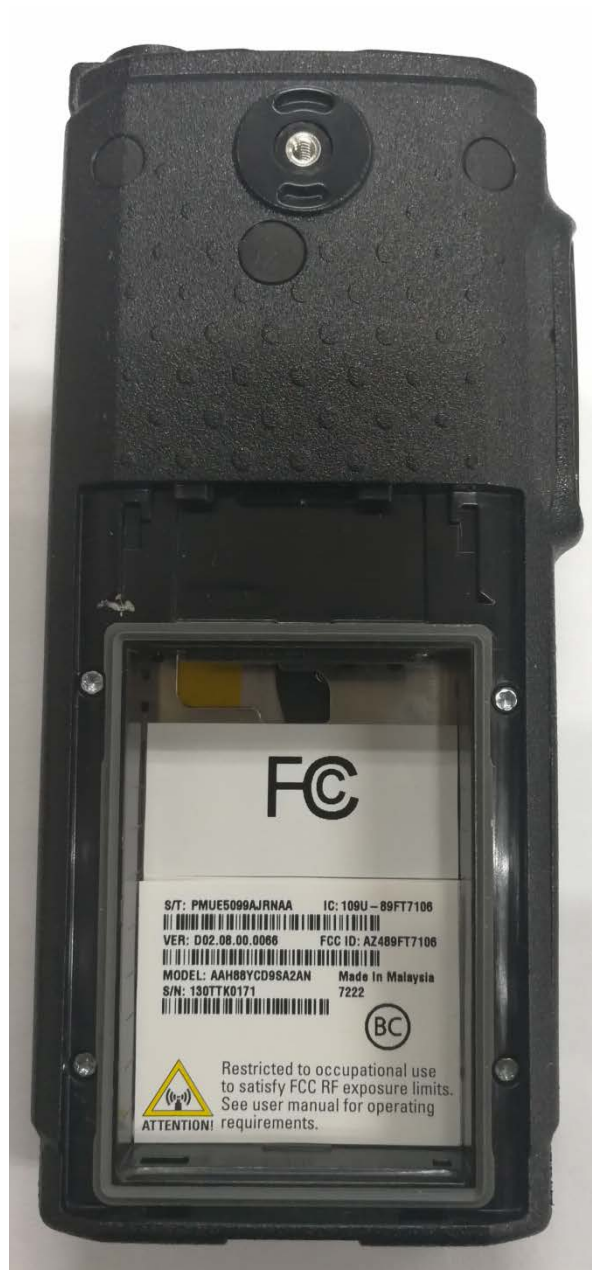
Back View (FCC/IC label for Limited Keypad Version)