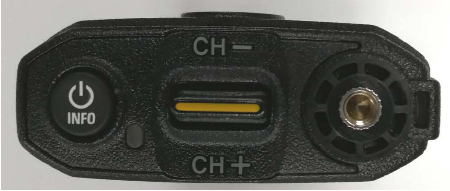
Top View (without Antenna)