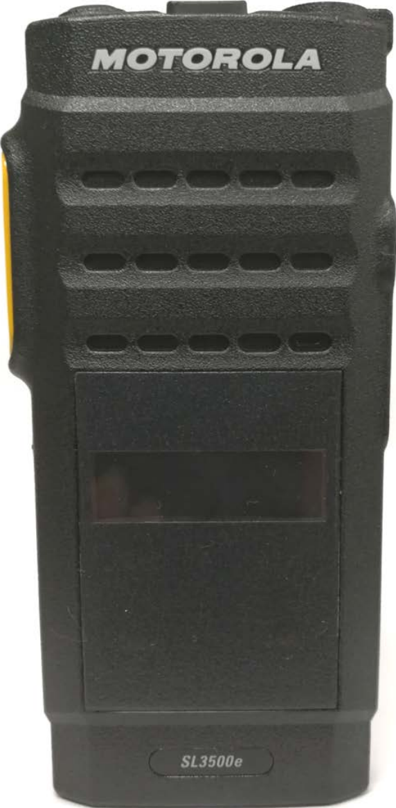
Front View Limited Keypad Model