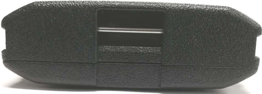
Bottom View with Battery