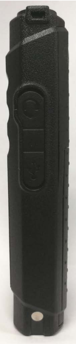
Side View (Left)