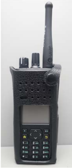
PMLN5838A (Front View)