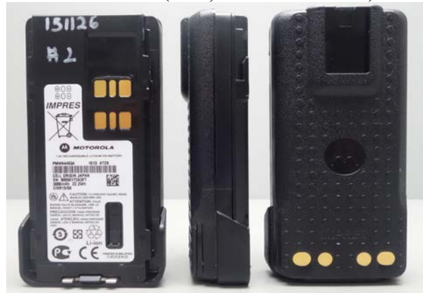
PMNN4493A (front, side and back View)