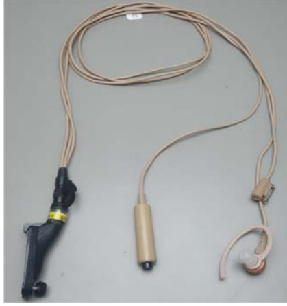
ZMN6031A w/ NNTN7869B