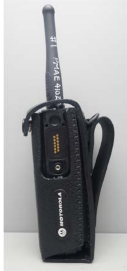
PMLN5838A (Side View)