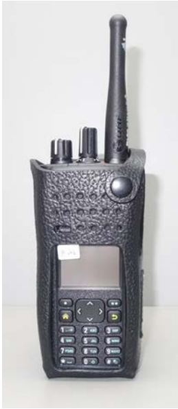
PMLN5842A (front View)