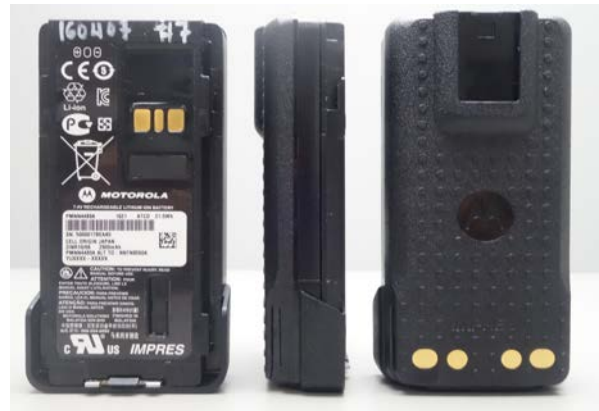
PMNN4489A (front, side and back View)