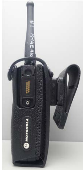
PMLN5842A (Side View)