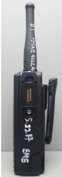
PMLN7008A (Side View)