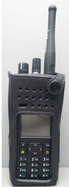
PMLN5844A (front View)