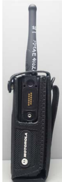
PMLN5844A (Side View)