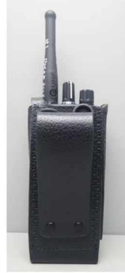
PMLN5838A (Back View)