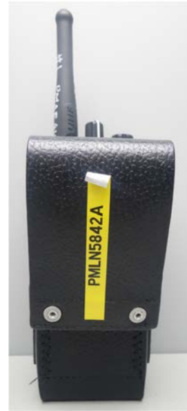
PMLN5842A (Back View)