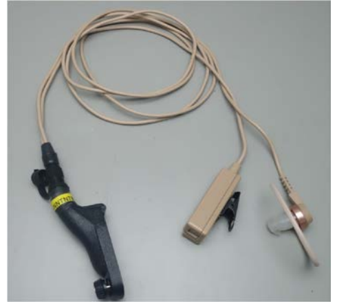
ZMN6038A w/ NNTN7869B