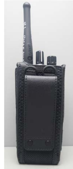
PMLN5844A (Back View)