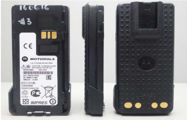
NNTN8128B (front, side and back View)