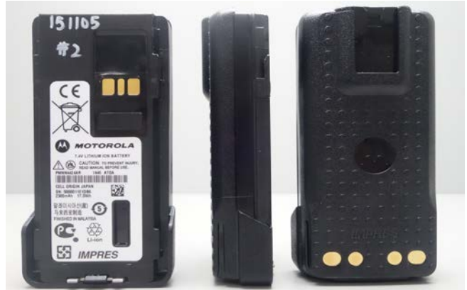
PMNN4424A (front, side and back View)