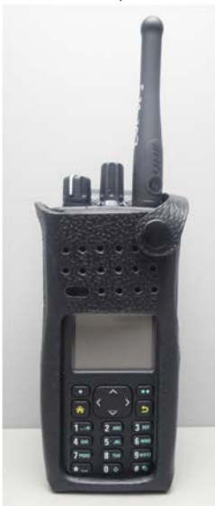
PMLN5840A (front View)