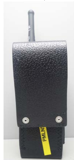
PMLN5840A (Back View)