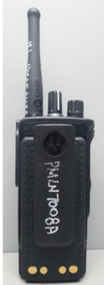
PMLN7008A (Back View)