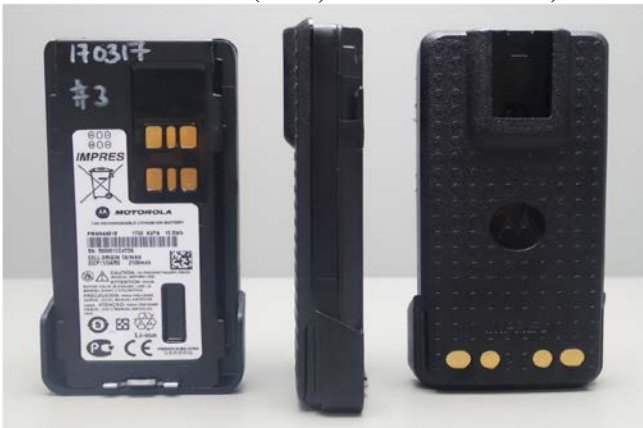
PMNN4491B (front, side and back View)