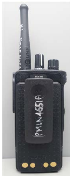
PMLN4651A (Back View)