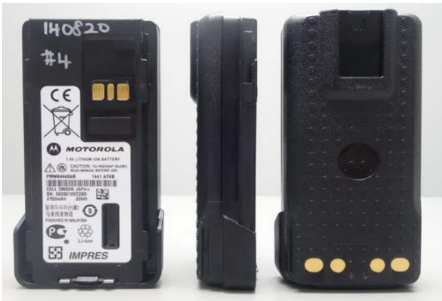
PMNN4448A (front, side and back View)