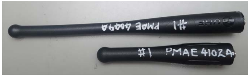
Top to bottom: PMAE4049A, PMAE4102A