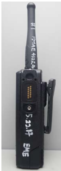
PMLN4651A (Side View)