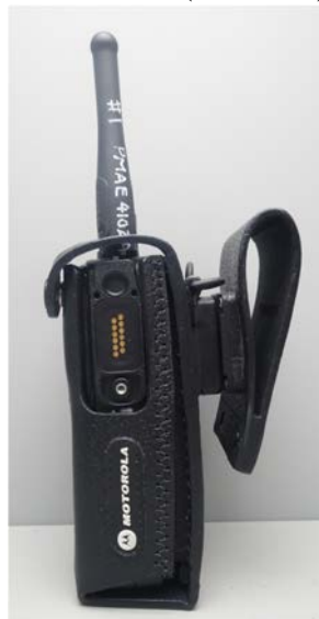
PMLN5840A (Side View)