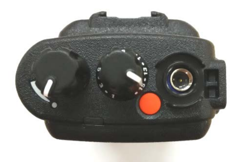
Top View (without Antenna) (APX900)