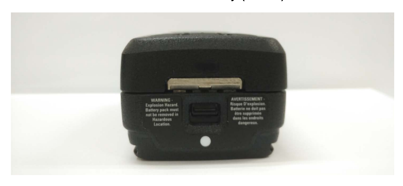
Bottom View with Battery (VX-P949)