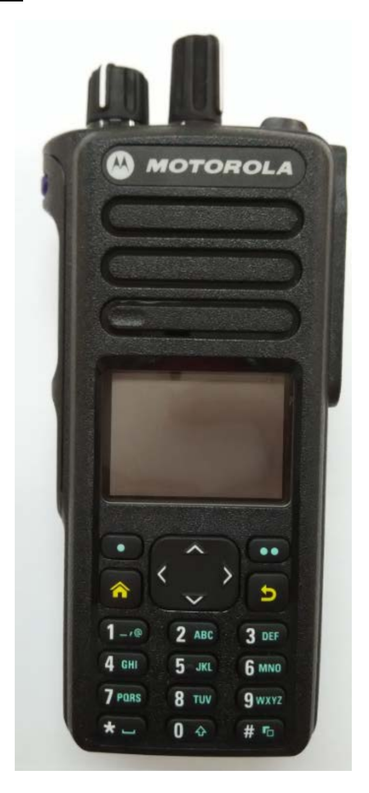
Exhibit 3A – Front View

Front view with display and full keypad model (APX900)