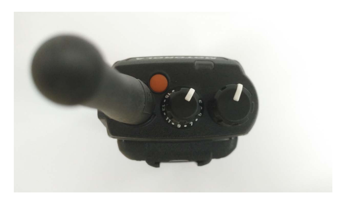
Top View (with Antenna) (VX-P949)