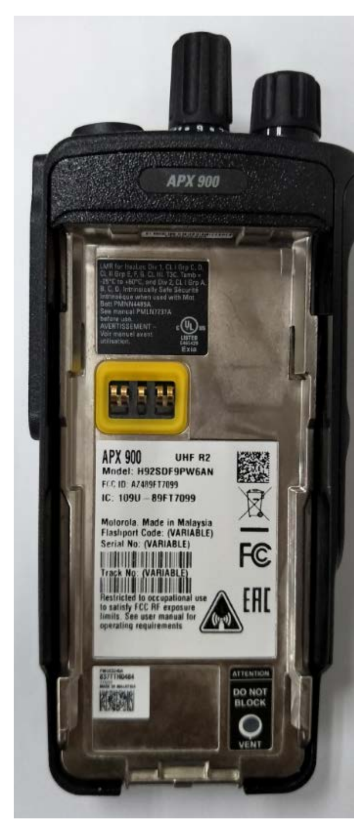
Back View (FCC/IC label for Limited Keypad Version) (APX900)