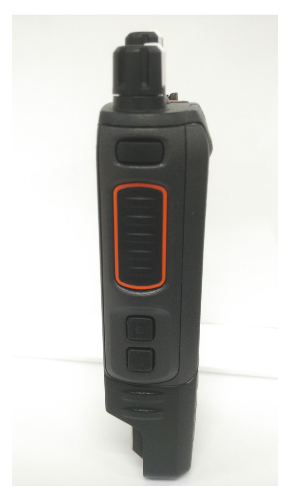
Side View (Right) (VX-P949)