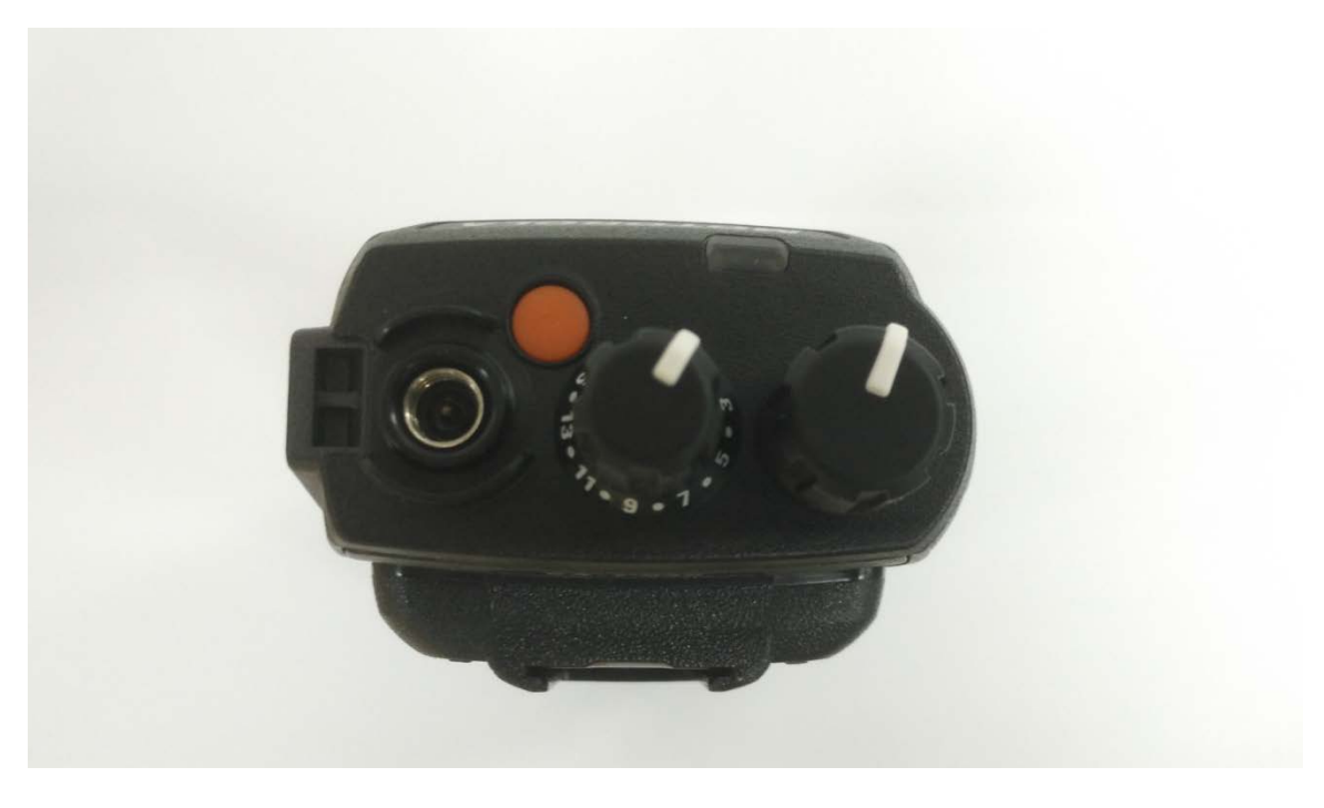
Top View (without Antenna) (VX-P949)