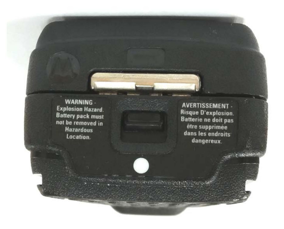
Bottom View with Battery (APX900)