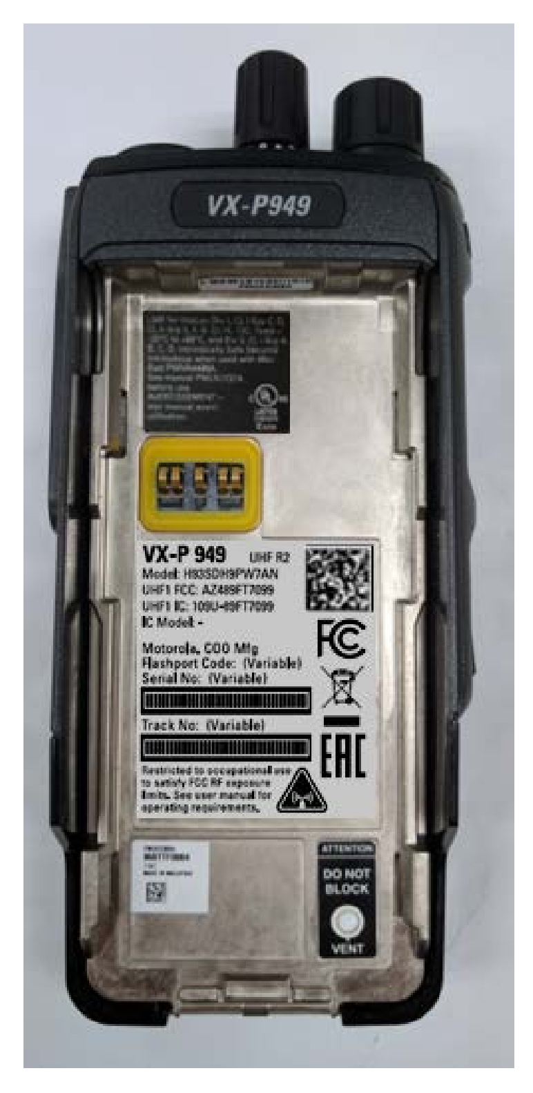
Back View (FCC/IC label for Full Keypad Version) (VX-P949)