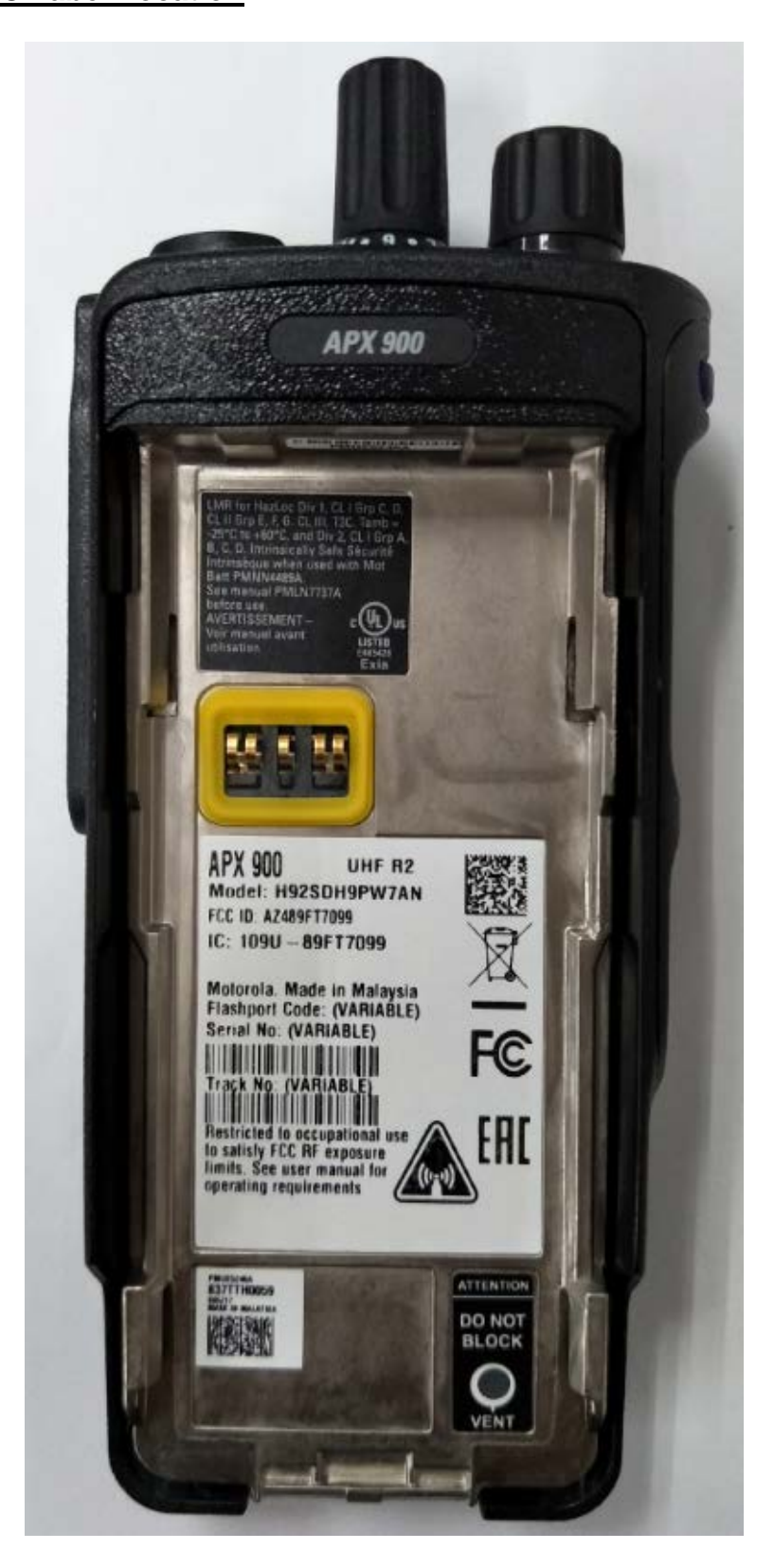
Exhibit 3C - FCC/IC Label Location

Back View (FCC/IC label for Full Keypad Version) (APX900)