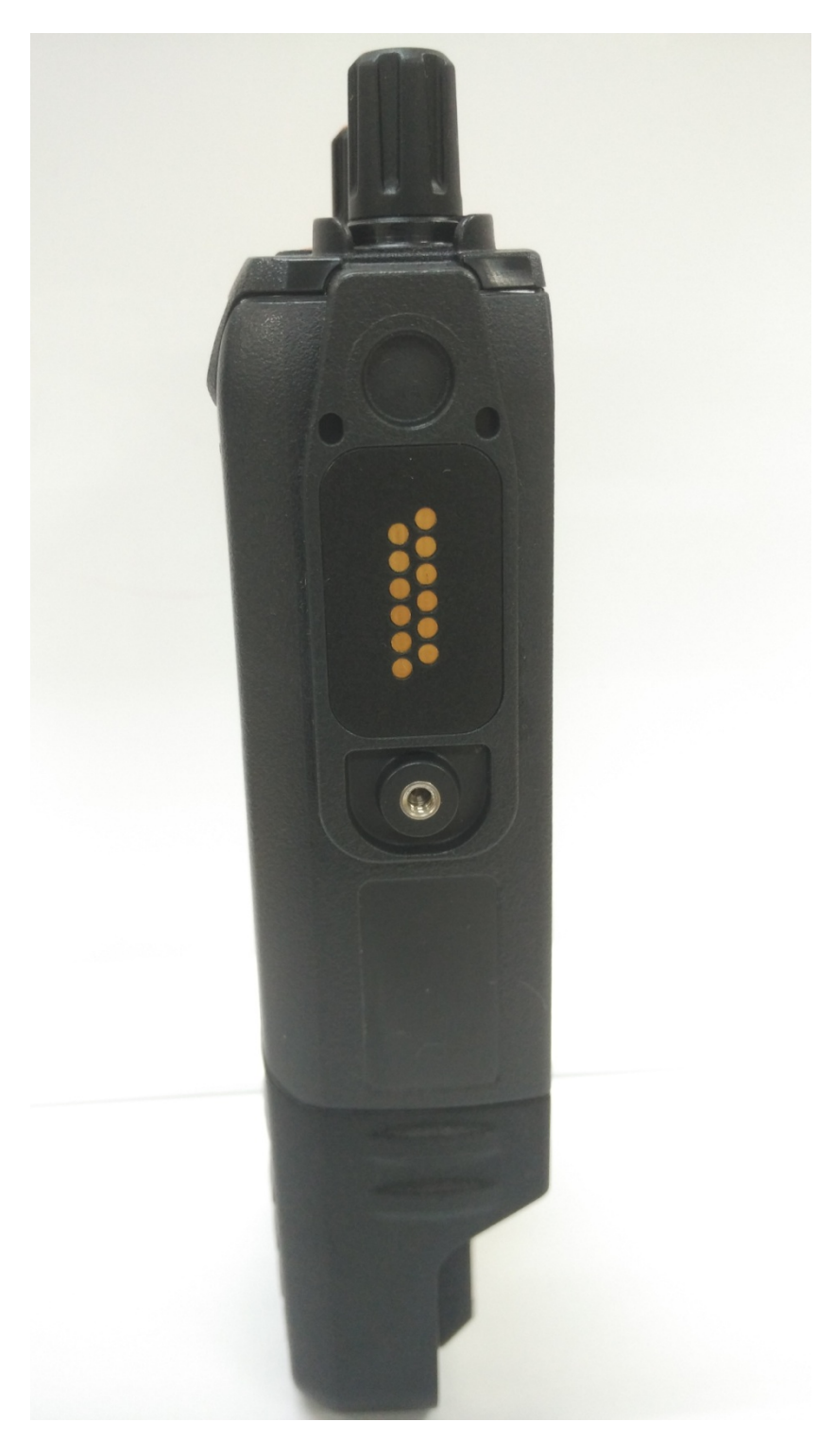
Side View (Left) (VX-P949)