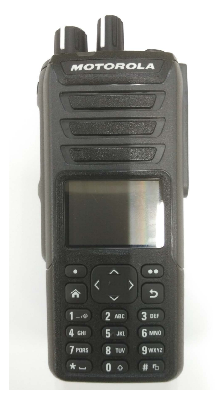
Front view with display full keypad model (VX-P949)