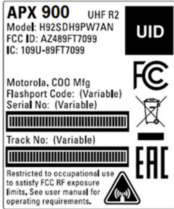
Figure 1A: FCC/IC Label for Model 3 (Full Keypad)