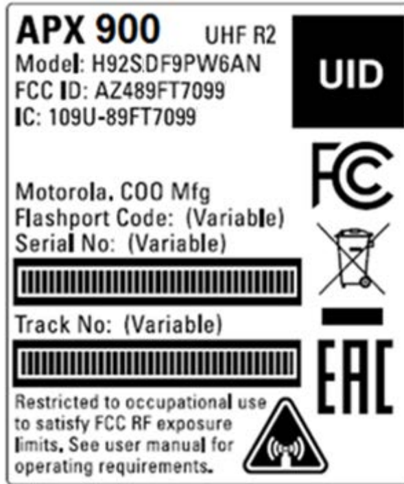
Figure 1B: FCC/IC Label for Model 2 (Limited Keypad)