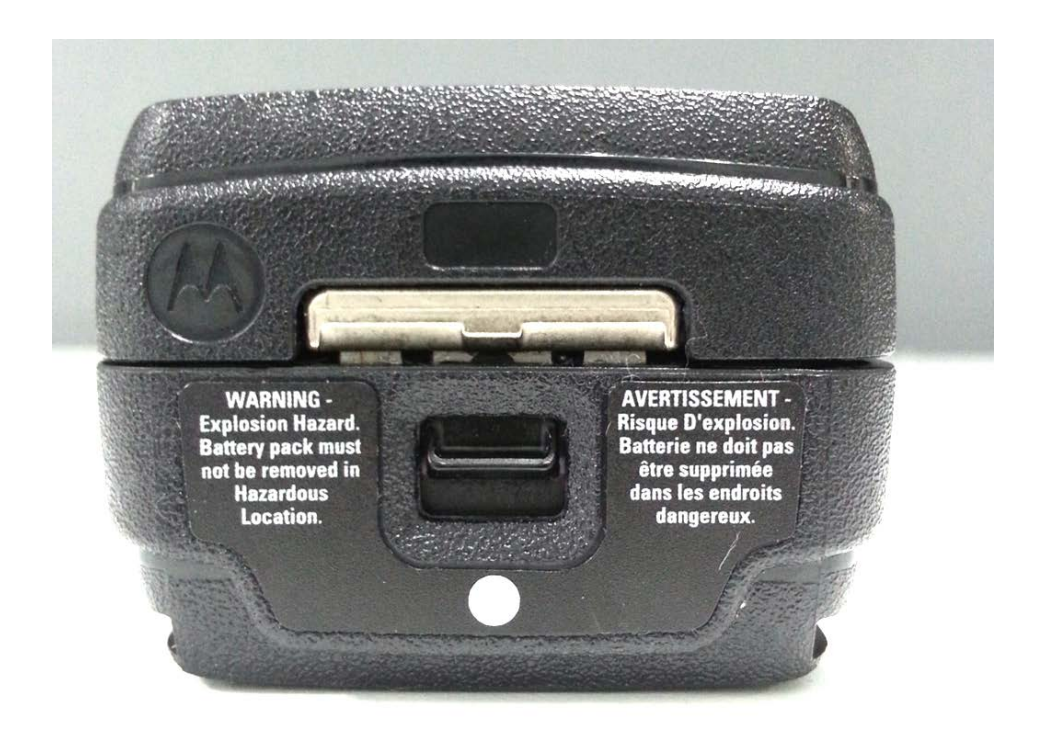
Bottom View with Battery