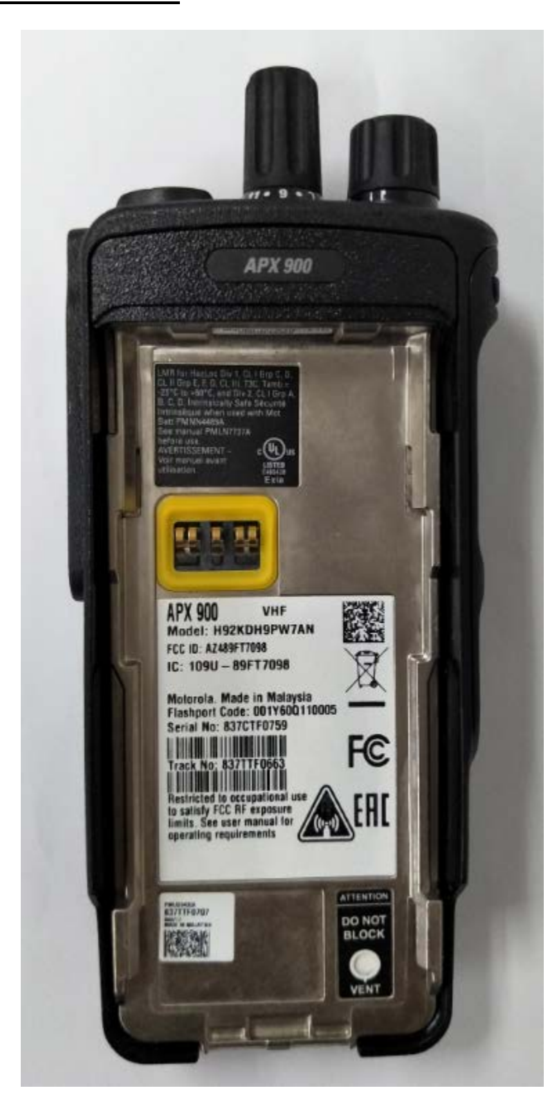
Back View (FCC/IC label for Full Keypad Version)