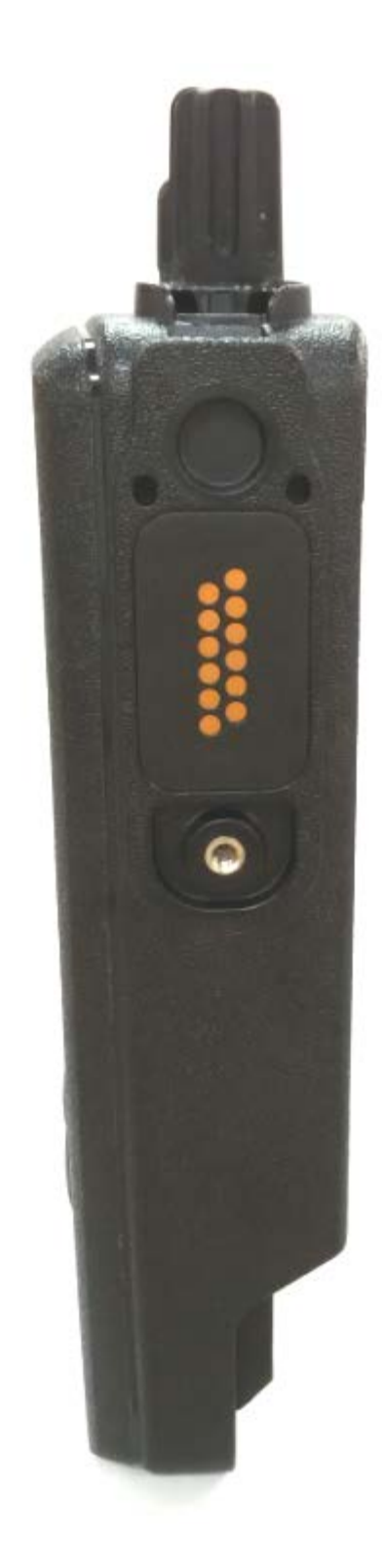
Side View (Left)