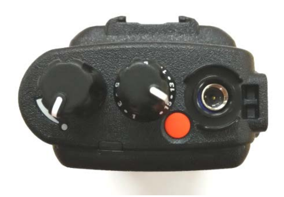
Top View (without Antenna)