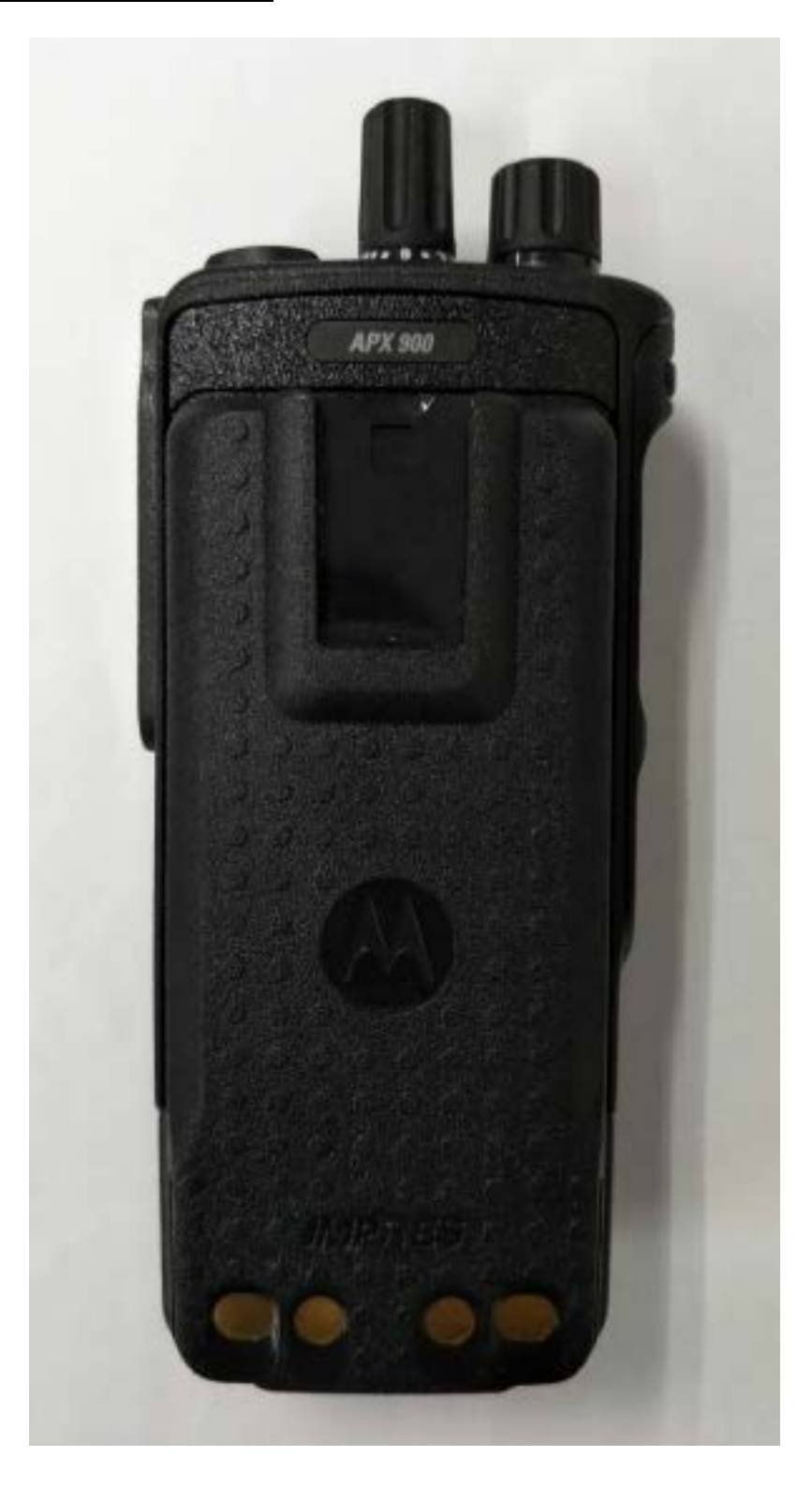
Back View with Battery