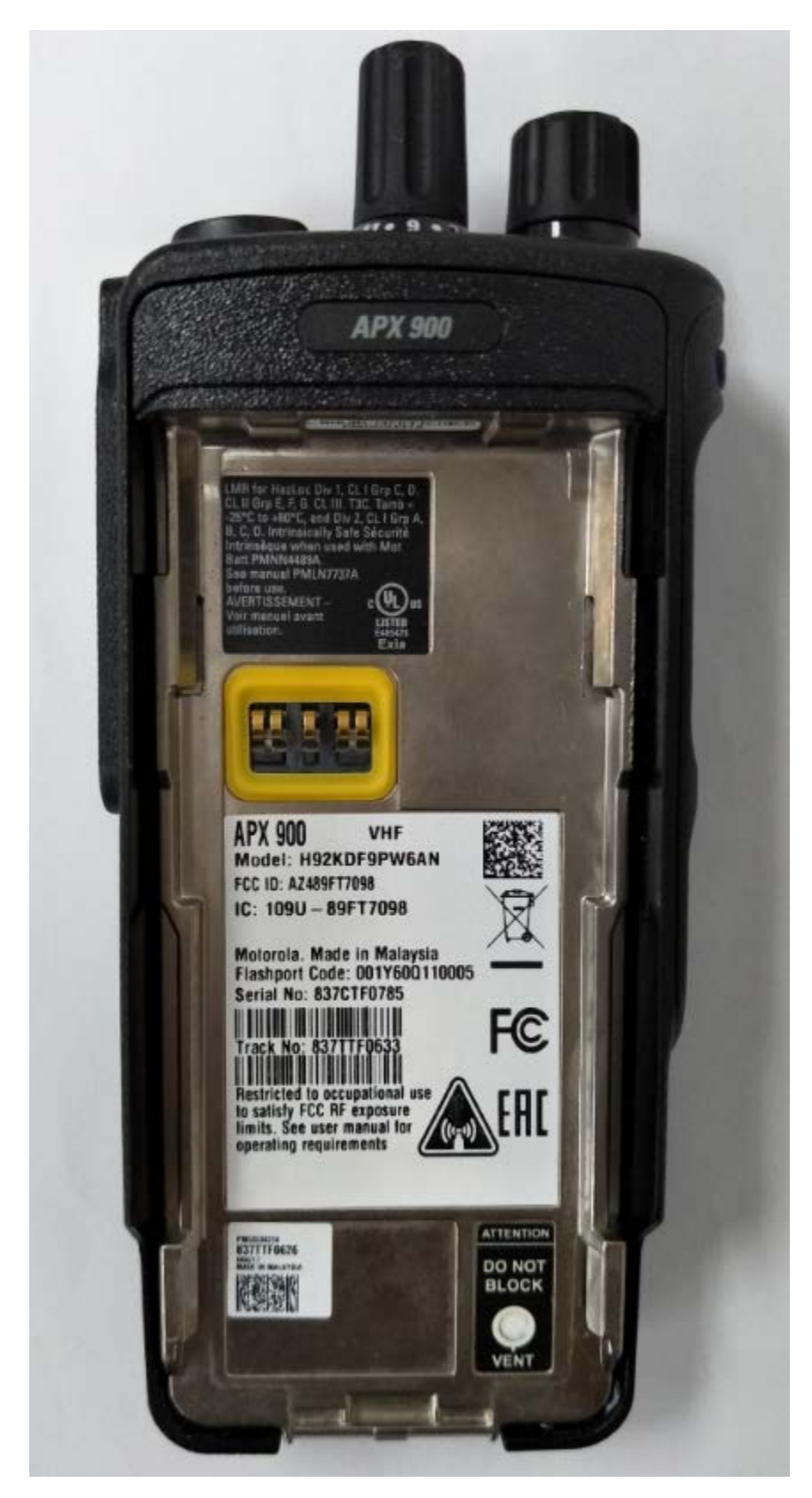
Back View (FCC/IC label for Limited Keypad Version)