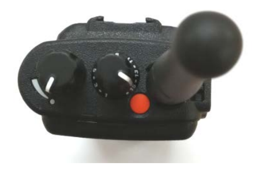
Top View (with Antenna)