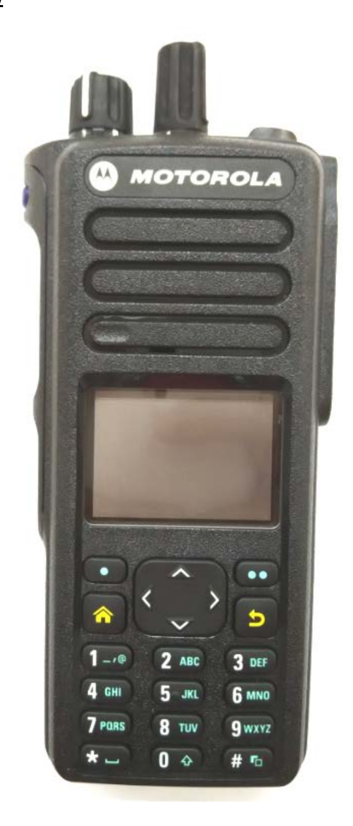
Front view with display and full keypad model