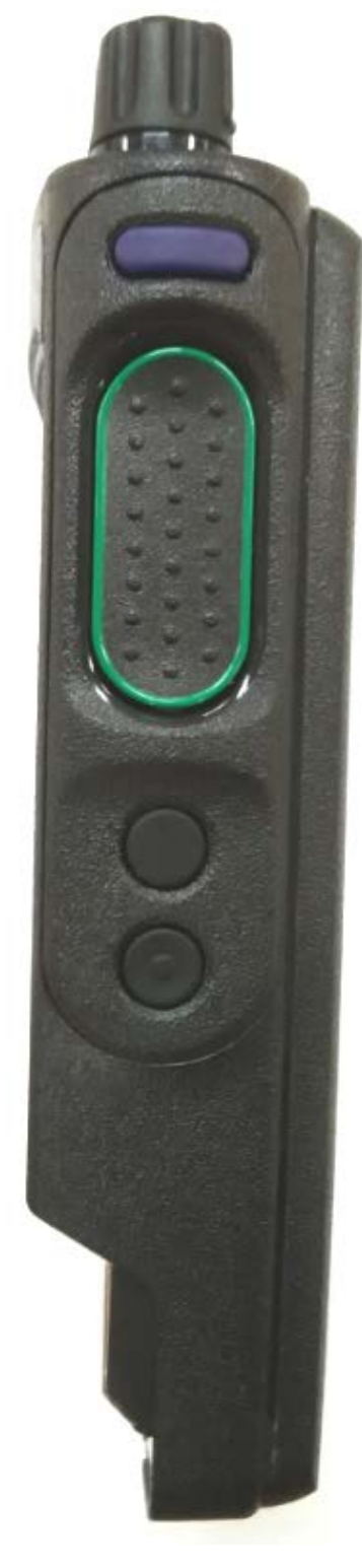
Side View (Right)