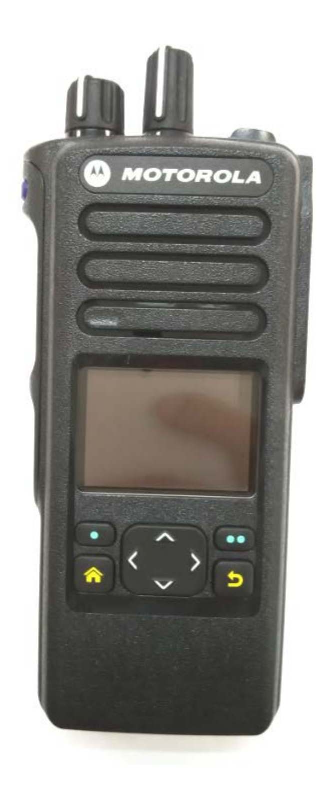
Front view with display and limited keypad model