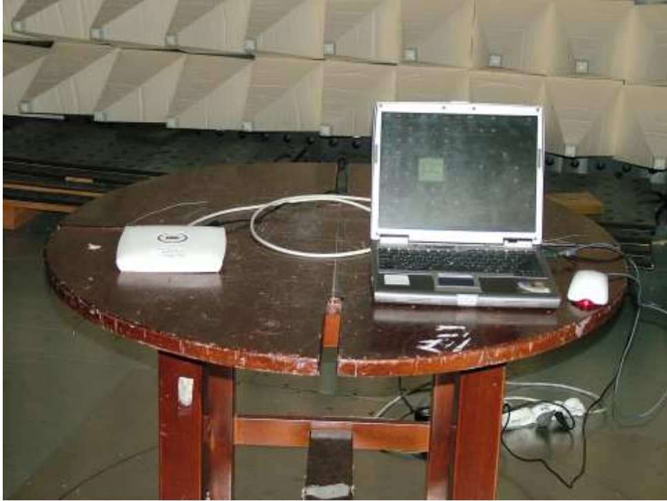
Photograph 10: Radiated Emission peripheral equipment