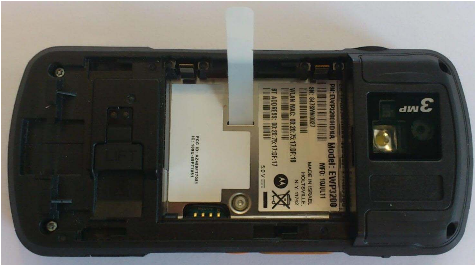
EXHIBIT 1A: General Information --- 47 CFR 2.1031

1A.1. Production Plans -- Pursuant 47 CFR 2.1031