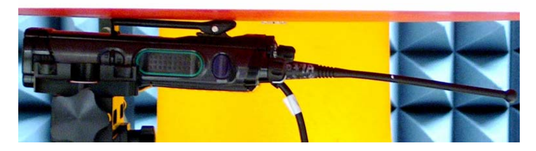
DUT with carry accessory PMLN5322A against the phantom. Audio accessory HMN4104A attached.