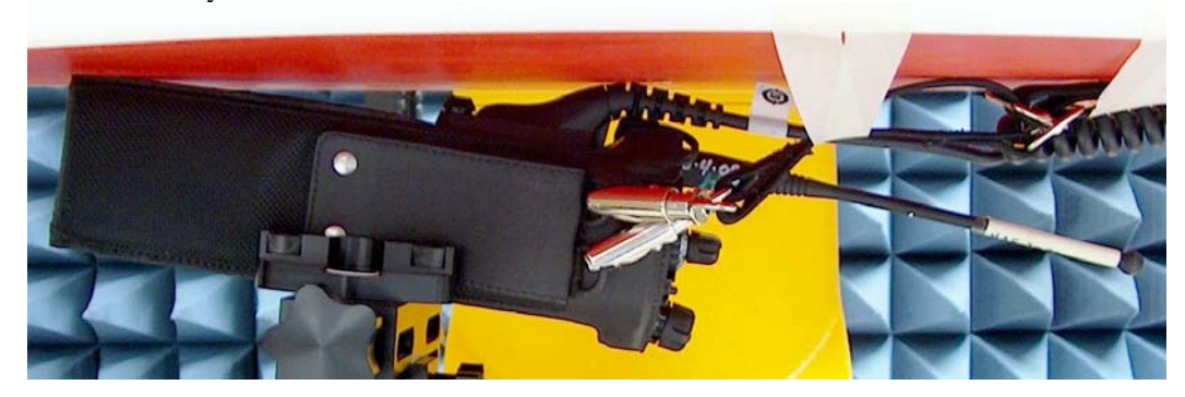
DUT with back side against the phantom with carry accessory PMLN5328A and NTN5243A. Audio accessory HMN4104A attached.

DUT with accessory side against the phantom with carry accessory PMLN5328A and NTN5243A. Audio accessory HMN4104A attached.