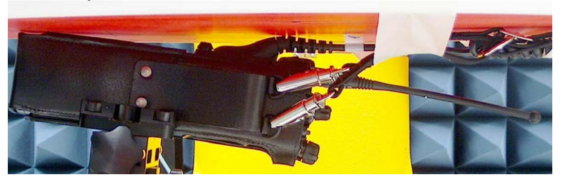
DUT with back side against the phantom with carry accessory PMLN5329A and NTN5243A. Audio accessory HMN4104A attached.

DUT with accessory side against the phantom with carry accessory PMLN5329A and NTN5243A. Audio accessory HMN4104A attached.