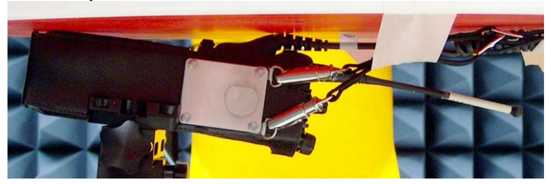
DUT with back side against the phantom with carry accessory PMLN5330A and NTN5243A. Audio accessory HMN4104A attached.

DUT with accessory side against the phantom with carry accessory PMLN5330A and NTN5243A. Audio accessory HMN4104A attached.