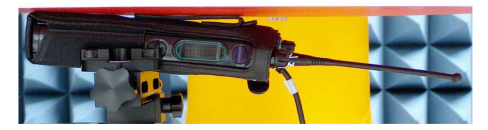
DUT with carry accessory PMLN5329A against the phantom. Audio accessory HMN4104A attached.

DUT with carry accessory PMLN5328A against the phantom. Audio accessory HMN4104A attached.