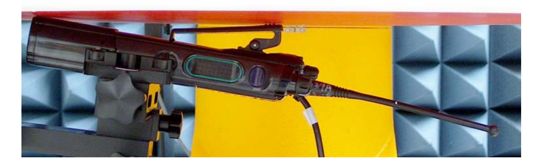
DUT with belt clip NTN8266B against the phantom. Audio accessory HMN4104A attached. (Same position used for all other tested audio accessories)

DUT with belt clip HLN6875A against the phantom. Audio accessory HMN4104A attached.