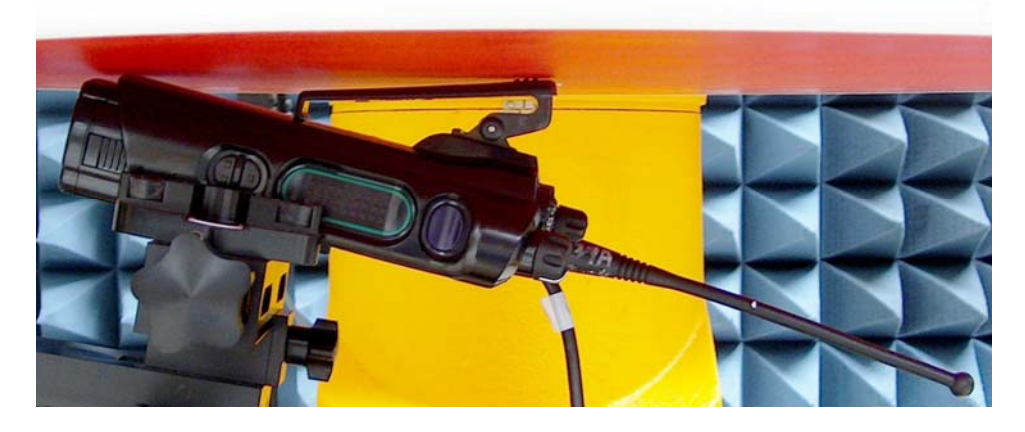
DUT with carry accessory PMLN5331A and belt clip NTN8266B against the phantom. Audio accessory HMN4104A attached.