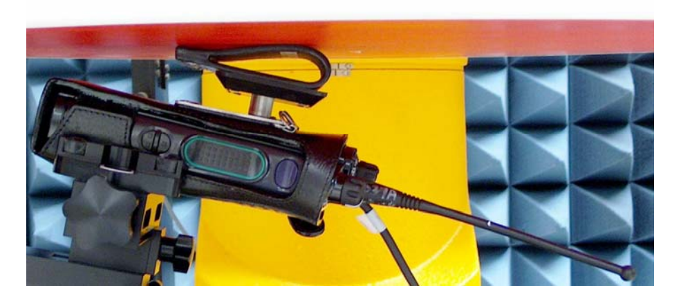
DUT with carry accessory PMLN5324A/PMLN5408A 2.75" swivel loop against the phantom. Audio accessory HMN4104A attached.

DUT with carry accessory PMLN5324A/PMLN5407A 2.5" swivel loop against the phantom. Audio accessory HMN4104A attached.