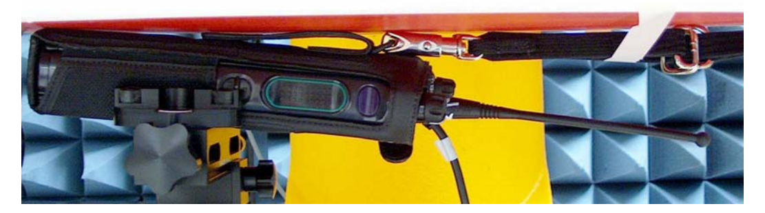
DUT with PTT side against the phantom with carry accessory PMLN5328A and NTN5243A. Audio accessory HMN4104A attached.