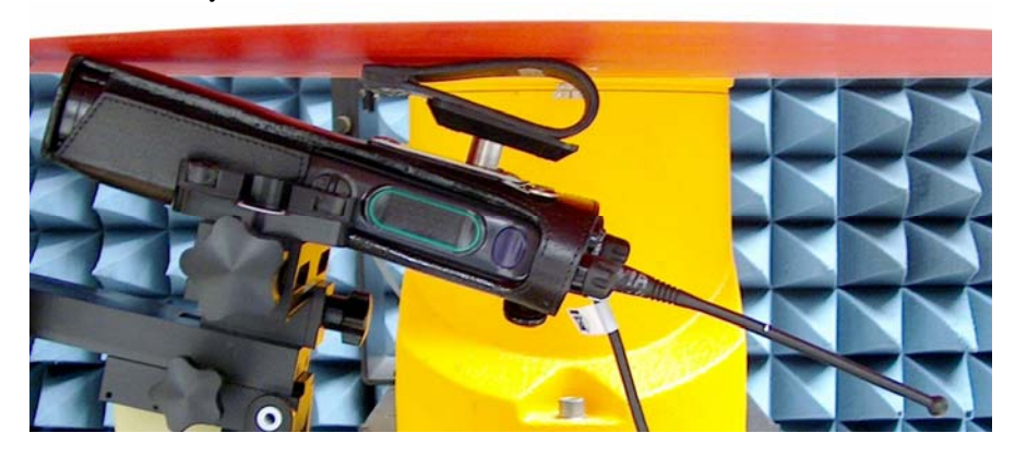
DUT with carry accessory PMLN5330A/PMLN5409A 3.0" swivel loop against the phantom. Audio accessory HMN4104A attached.