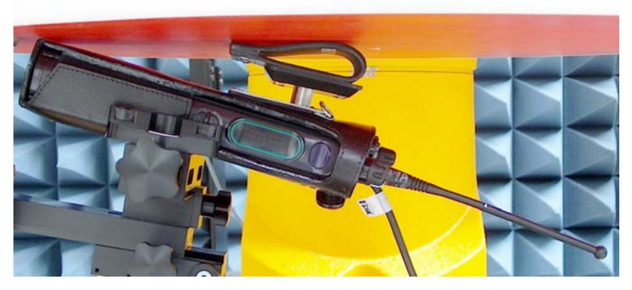
DUT with carry accessory PMLN5330A/PMLN5408A 2.75" swivel loop against the phantom. Audio accessory HMN4104A attached.

DUT with carry accessory PMLN5330A/PMLN5407A 2.5" swivel loop against the phantom. Audio accessory HMN4104A attached.