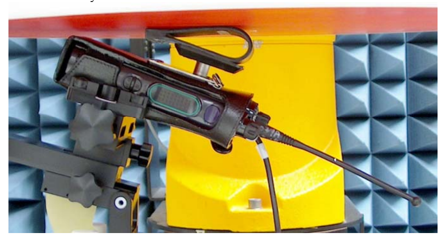
DUT with carry accessory PMLN5324A/PMLN5409A 3.0" swivel loop against the phantom. Audio accessory HMN4104A attached.