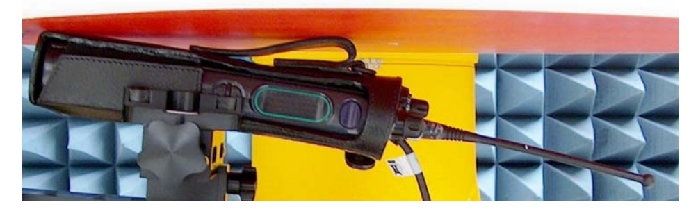
DUT with carry accessory PMLN5331A and belt clip HLN6875A against the phantom. Audio accessory HMN4104A attached.