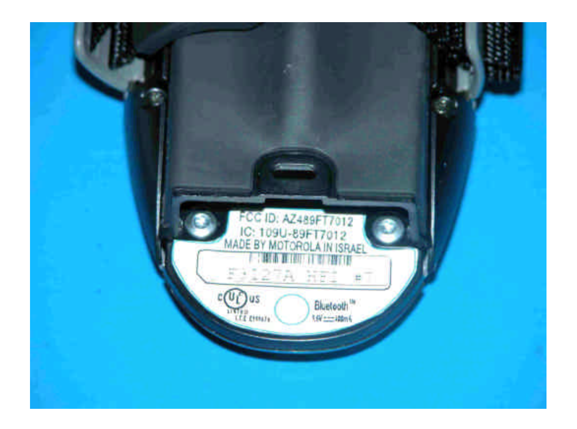
Exhibit 1 Page: 1-2