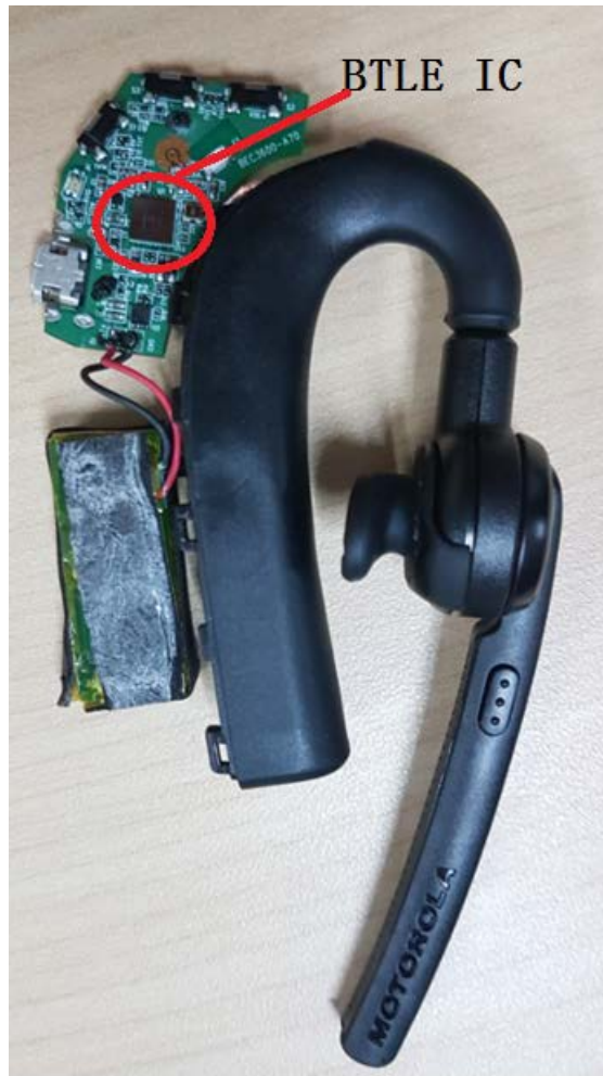
Overall Internal Assembly