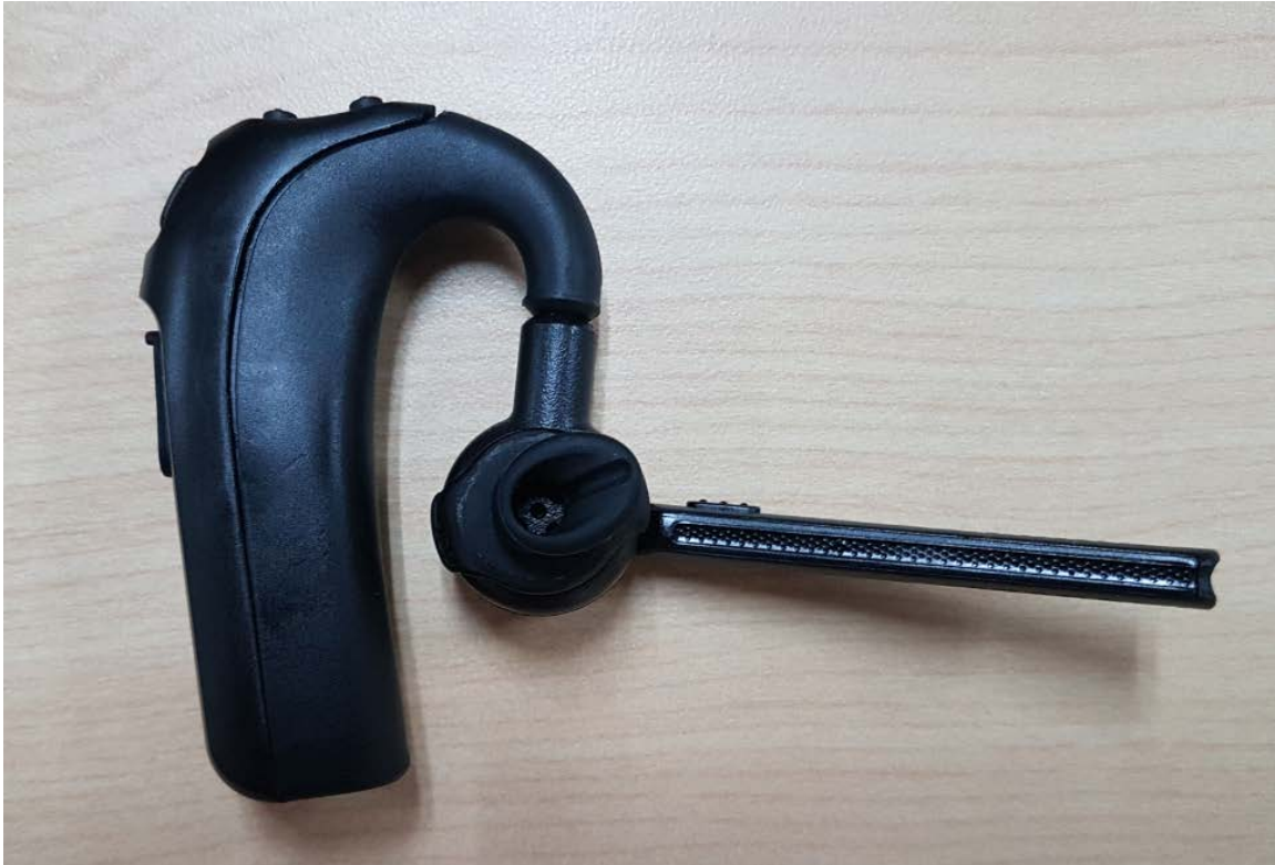
SIDE VIEW (RIGHT)