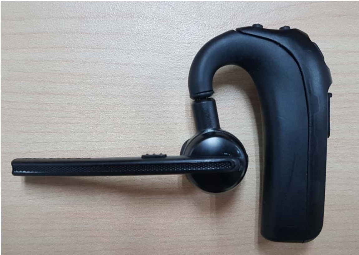
SIDE VIEW (LEFT)