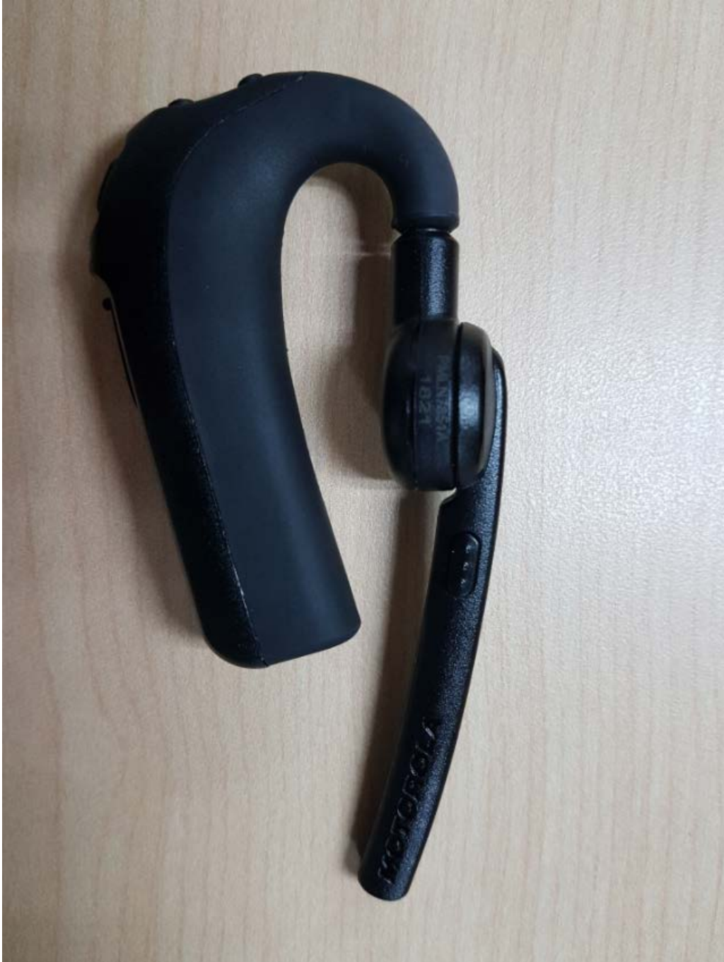
SIDE VIEW WITH BATTERY