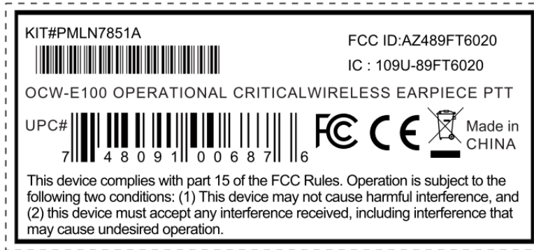
Figure 1B: FCC/IC LABEL FOR SALES MODEL PMLN7851A ON PACKAGING BOX