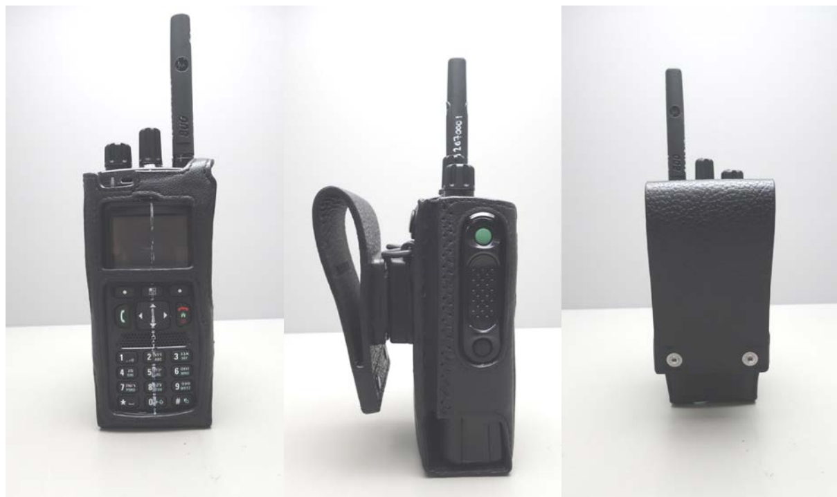
PMLN5887B with DUT: Front, side and back views (left to right)