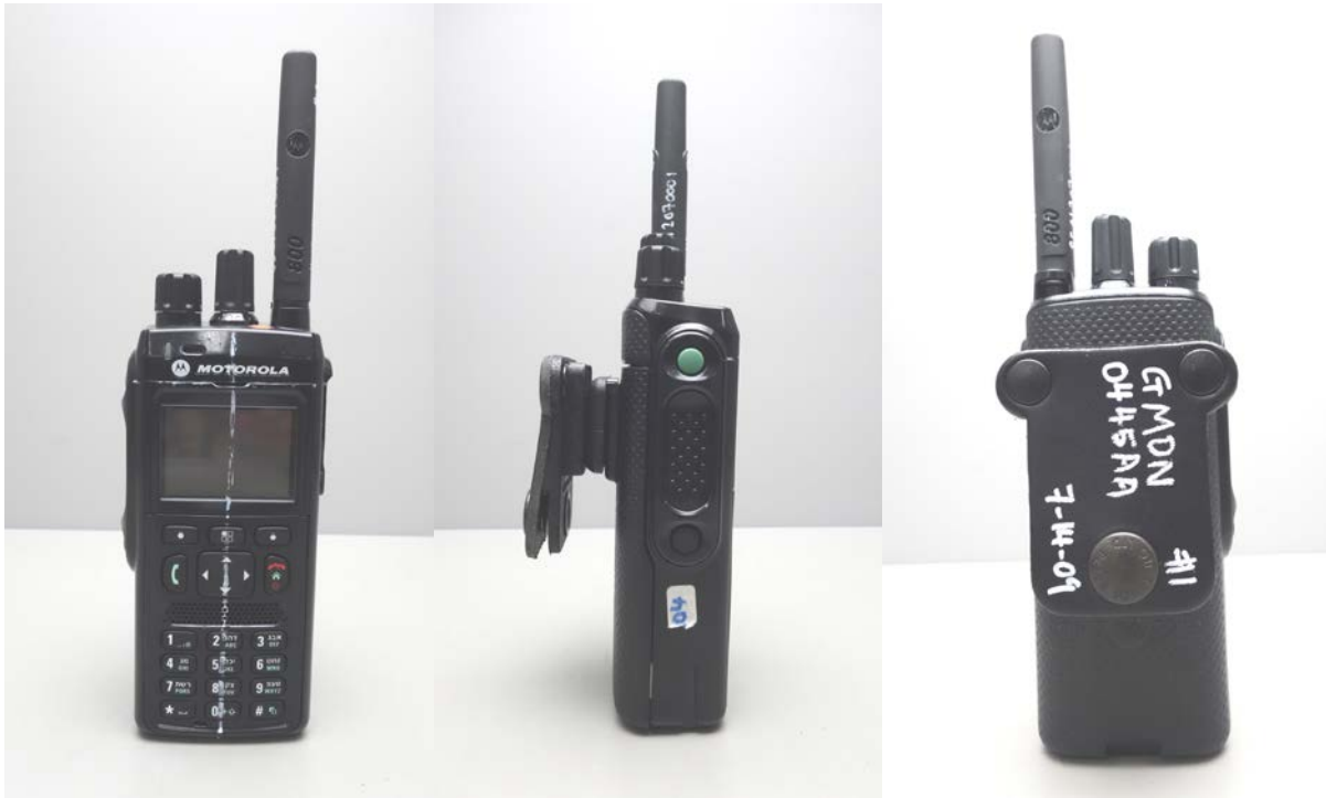
PMLN5004A w/GMDN0445AA with DUT: Front, side and back views (left to right)