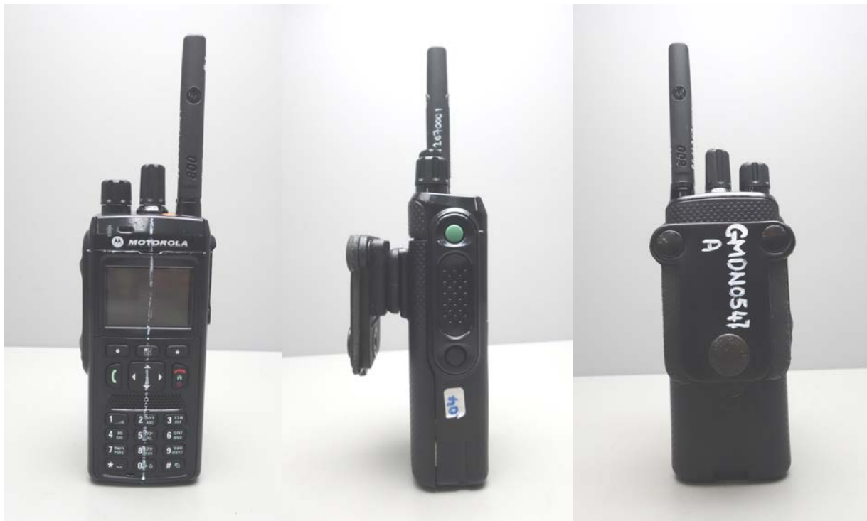
PMLN5004A w/GMDN0547A with DUT: Front, side and back views (left to right)