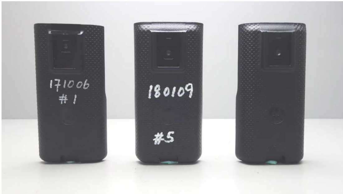
Back View: NNTN8020B, NNTN8023C & PMNN4522A (left to right)