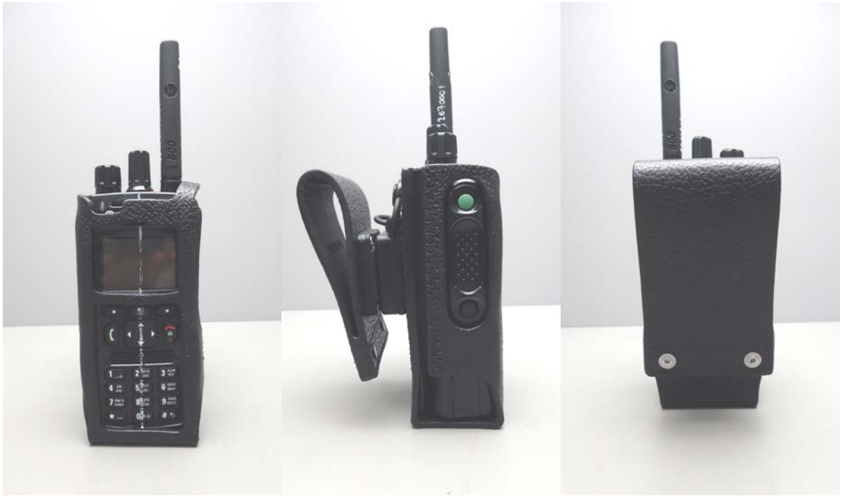
PMLN5885B with DUT: Front, side and back views (left to right)