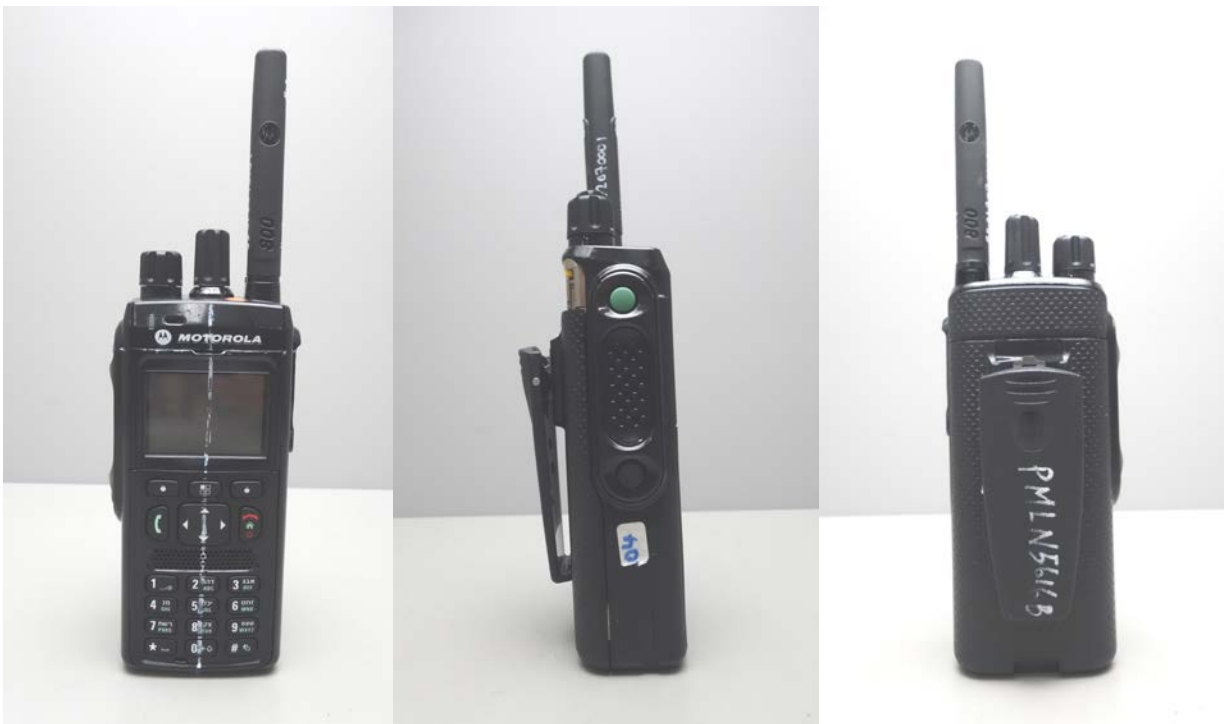
PMLN5616B with DUT: Front, side and back views (left to right)