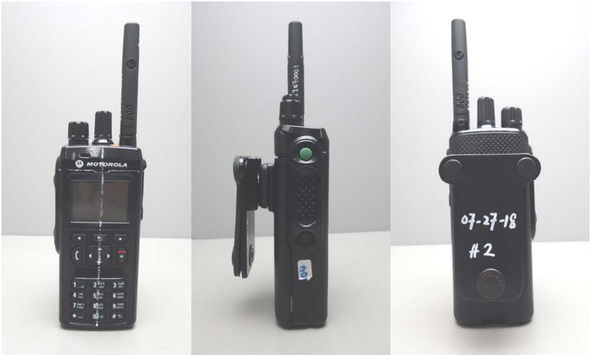
PMLN5004B w/PMLN7961A with DUT: Front, side and back views (left to right)