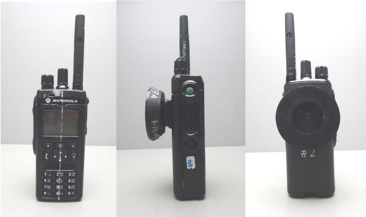
PMLN5004A w/WALN4307A with DUT: Front, side and back views (left to right)