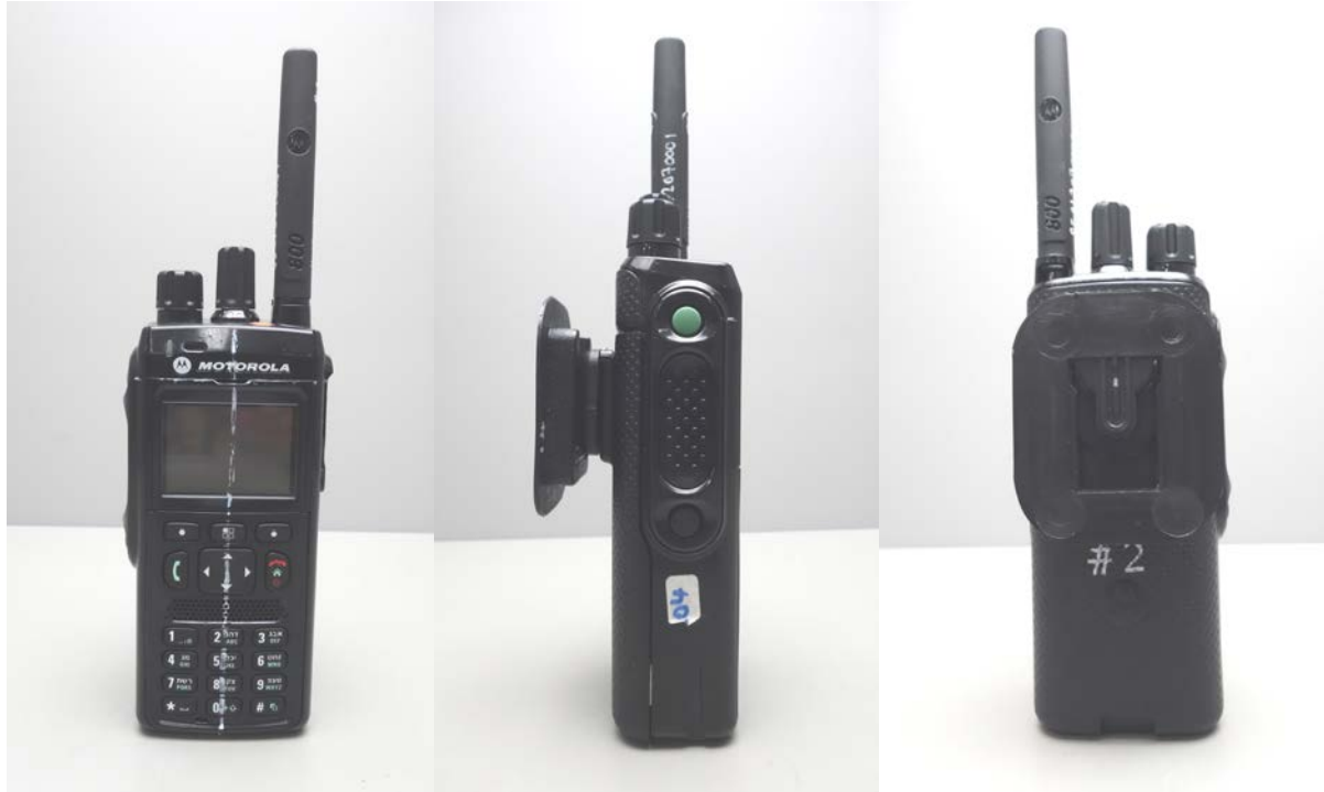
PMLN5004A w/GMDN0386A with DUT: Front, side and back views (left to right)