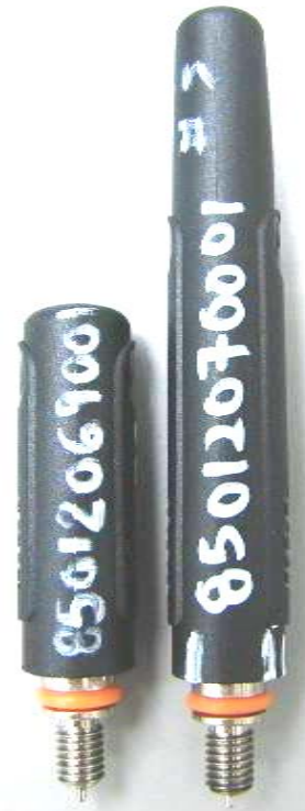
Antennas: 85012069001 (left) & 85012070001 (right)