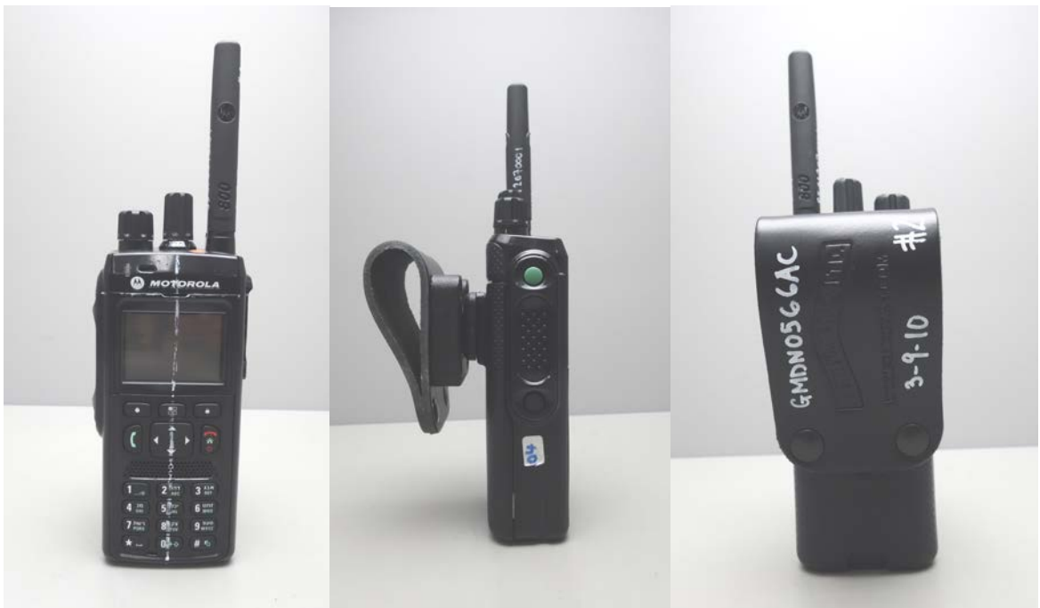
PMLN5004B w/GMDN0566AC with DUT: Front, side and back views (left to right)