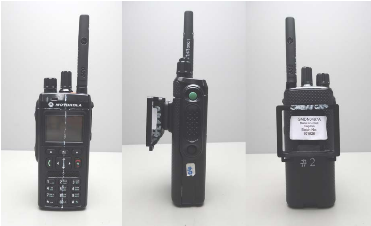
PMLN5004A w/GMDN0497A with DUT: Front, side and back views (left to right)