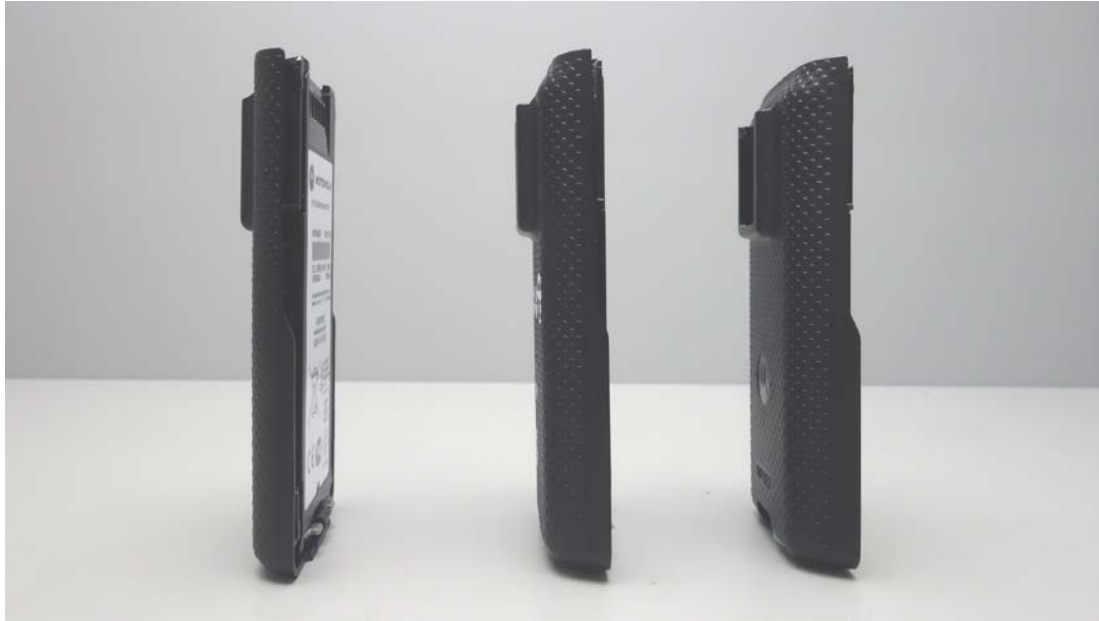
Side View: NNTN8020B, NNTN8023C & PMNN4522A (left to right)