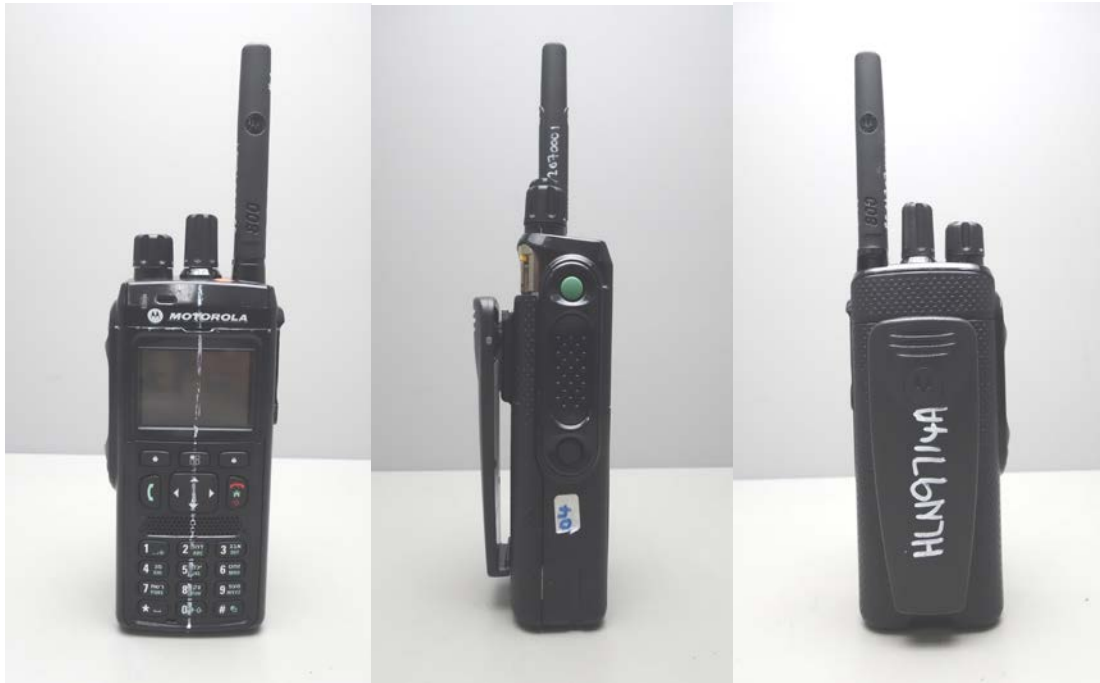
HLN9714A with DUT: Front, side and back views (left to right)