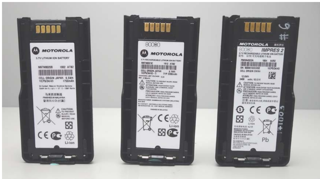
Front View: NNTN8020B, NNTN8023C & PMNN4522A (left to right)