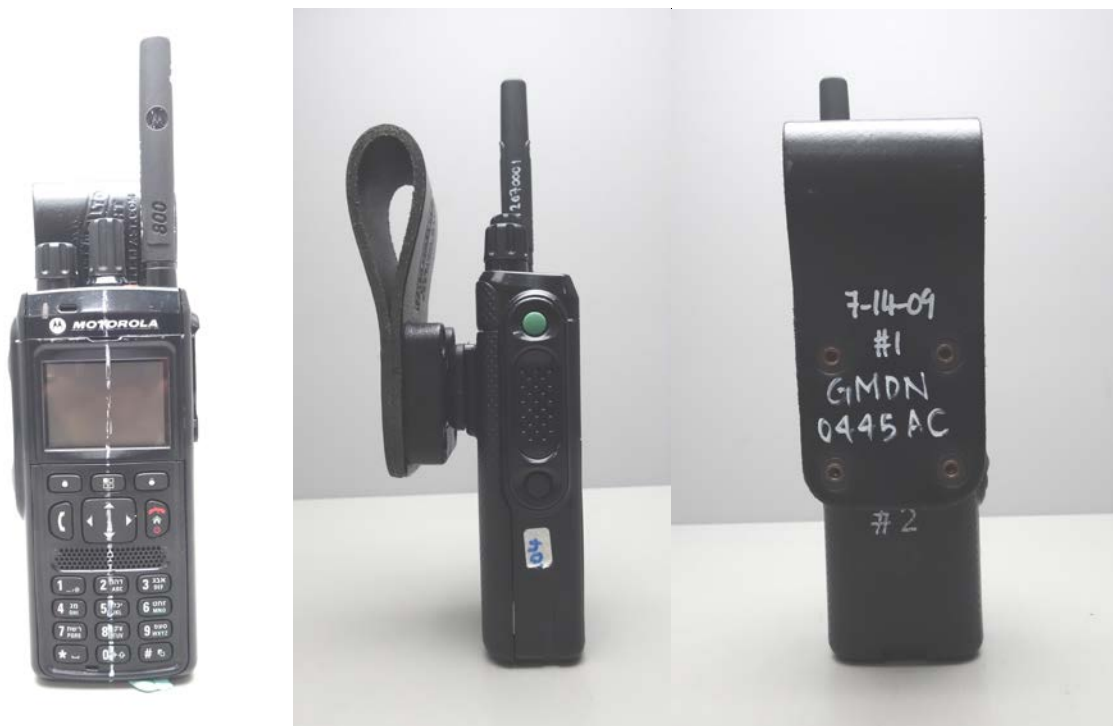
PMLN5004A w/GMDN0445AC with DUT: Front, side and back views (left to right)