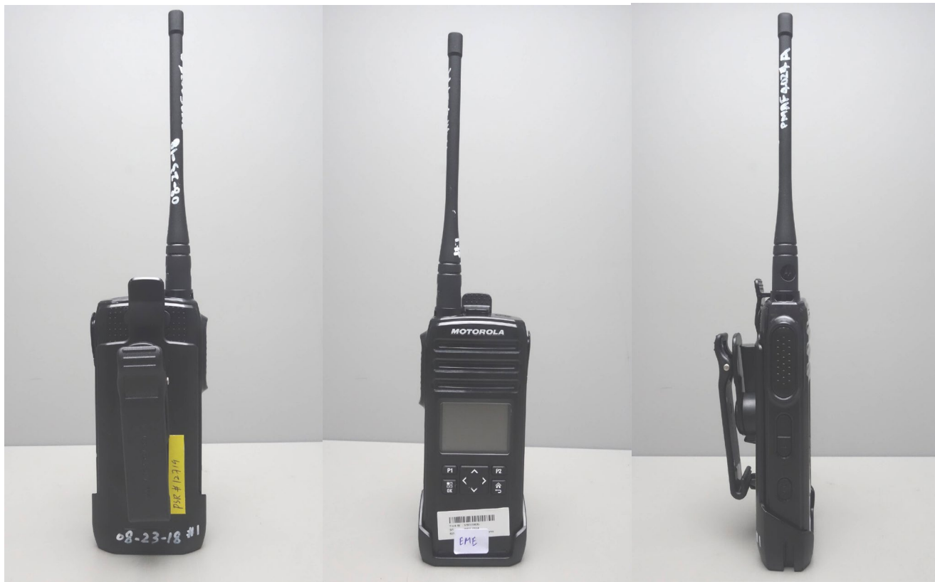
PMLN7939A (Back View)