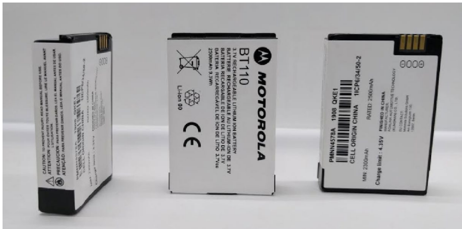
PMNN4578A (Side, Front and Back view)