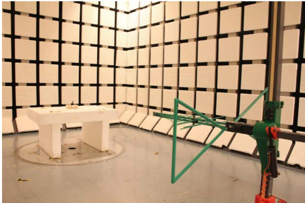
Frequency: 30MHz to 1GHz