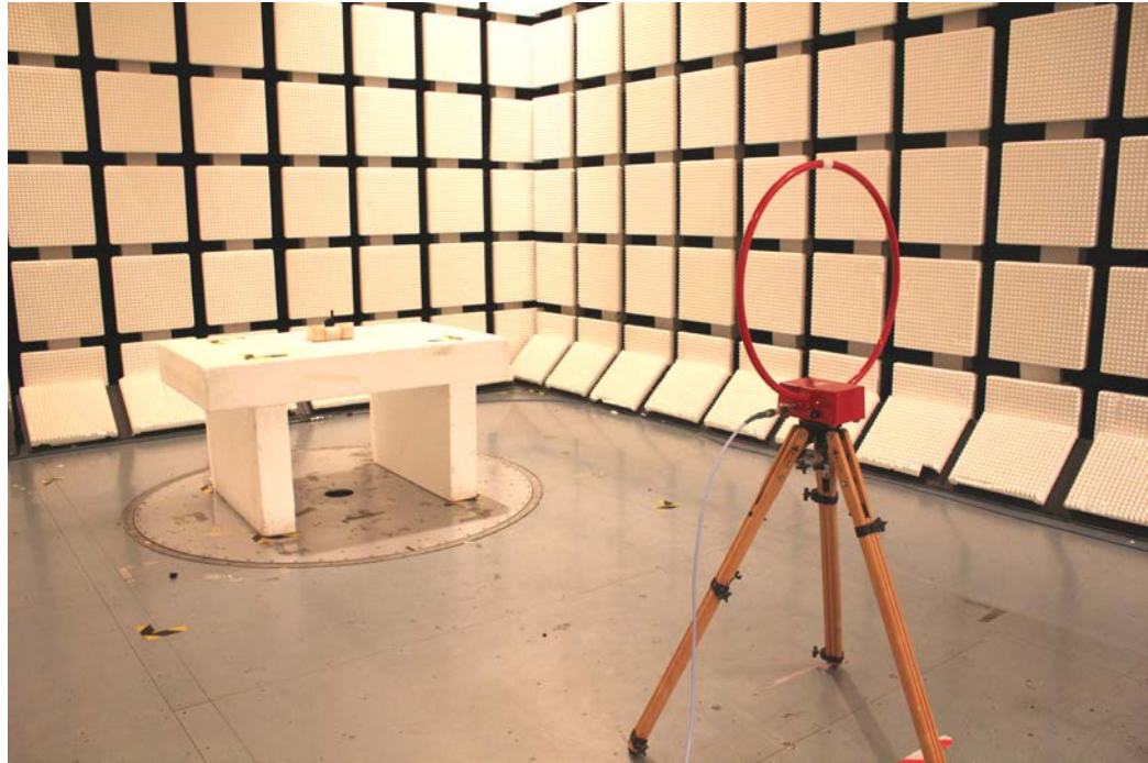
Frequency: 9kHz to 30MHz