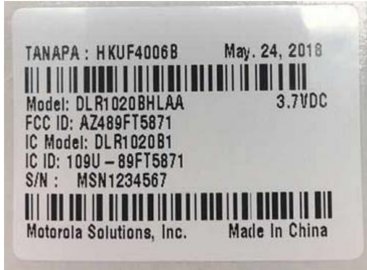
Figure 1A: FCC/IC Label for DLR1020 (DLR1020BHLAA/DLR1020B1)