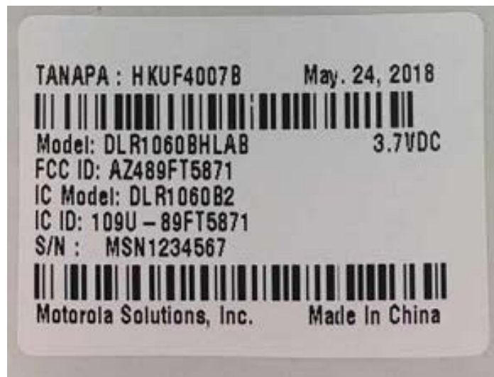
Figure 1D: FCC/IC Label for DLR1060 (DLR1060BHLAB/DLR1060B2)