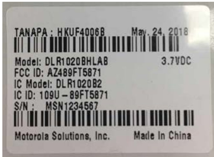
Figure 1B: FCC/IC Label for DLR1020 (DLR1020BHLAB/DLR1020B2)