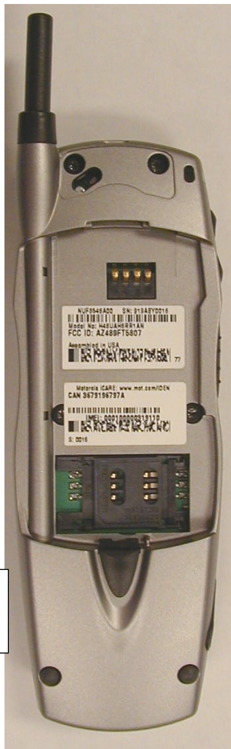
Photograph 3-5: Rear View of radio, battery removed to show FCC label location.