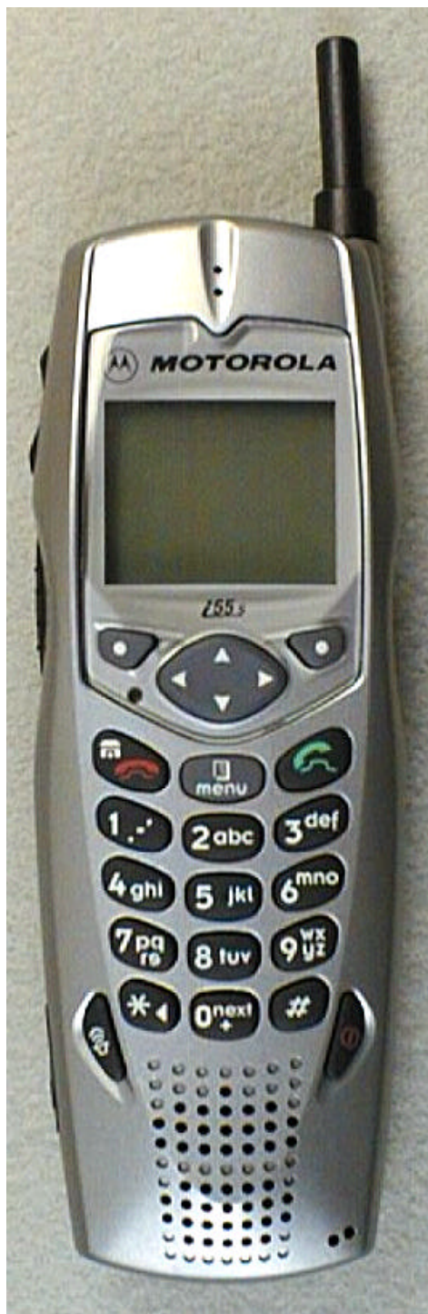
Photograph 3-1: Front View of radio, antenna retracted.