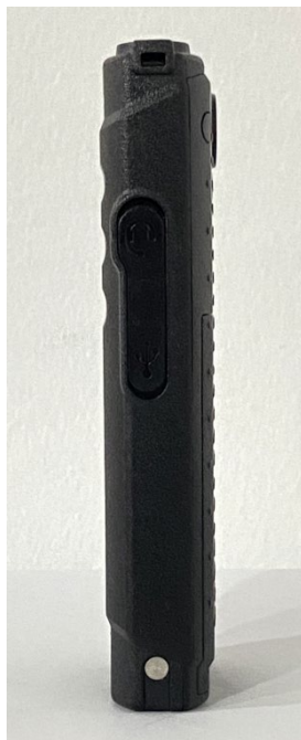
Side view (Left) with Battery & Battery Cover (SL300 - Display & Plain model)