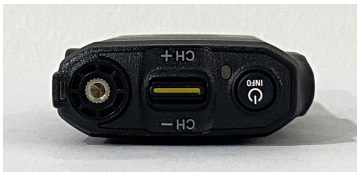
Top view with Battery & Battery Cover (SL300 - Display model)