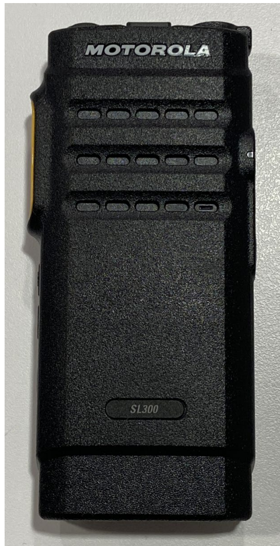
Front View with Battery & Battery Cover (SL300 - Display & Plain model)