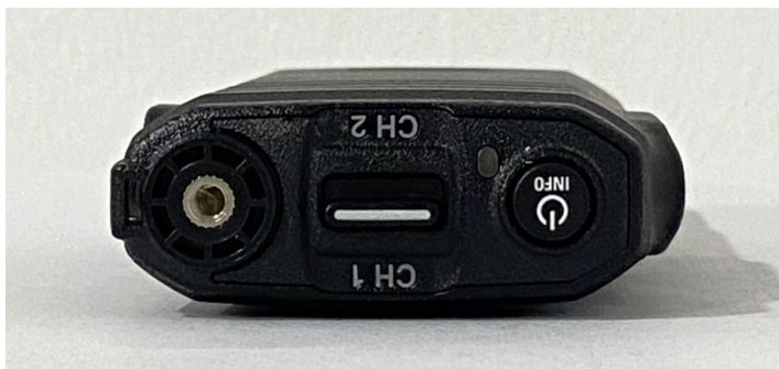
Top view with Battery & Battery Cover (SL300 - Plain model)