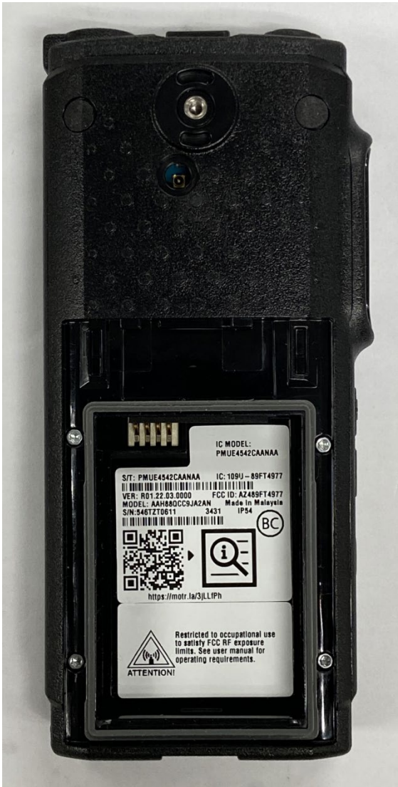
View of FCC/IC label location (SL300 - Plain model)