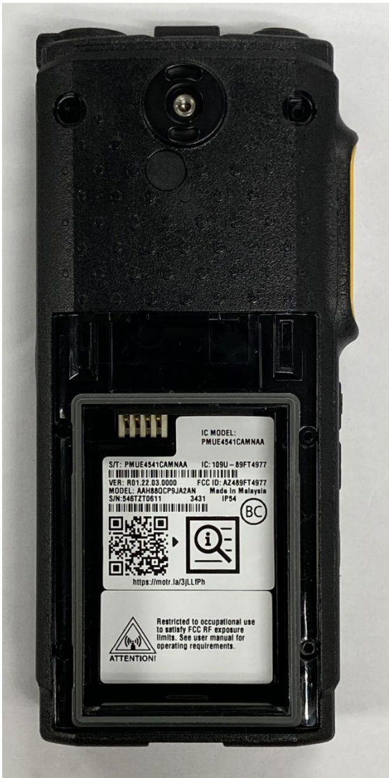
View of FCC/IC label location (SL300 - Display model)