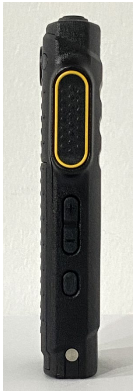
Side view (Right) with Battery & Battery Cover (SL300 - Display model)