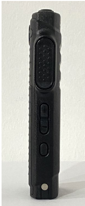
Side view (Right) with Battery & Battery Cover (SL300 - Plain model)