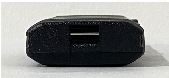
Bottom view with Battery & Battery Cover (SL300 - Display & Plain model)