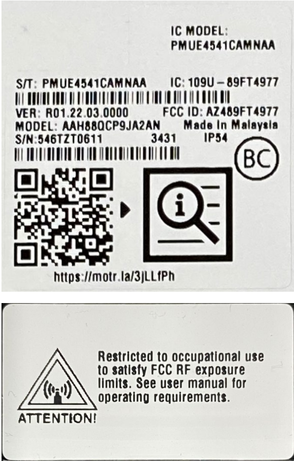
Figure 1: FCC/IC Label for SL300 403-470MHz 2-3W DISPLAY