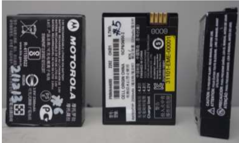
Left to Right; Back, front and side views: PMNN4468B