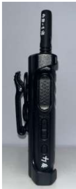
DUT Side View Swivel Carry Holster PMLN7190A