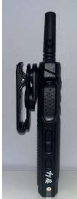
DUT Side View Belt clip PMLN7128A