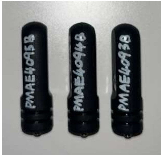
Left to Right: PMAE4095B, PMAE4094B, PMAE4093B