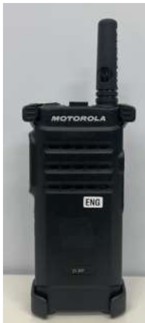
DUT Front View Swivel Carry Holster PMLN7190A