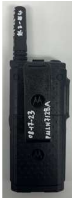
DUT Back View Belt clip PMLN7128A