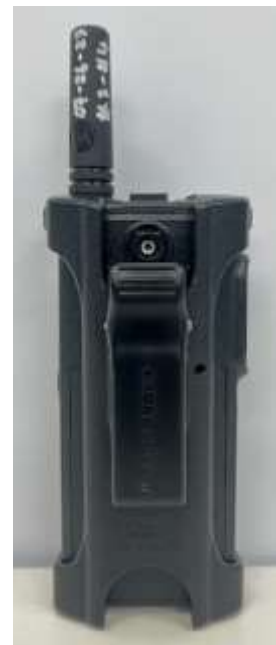
DUT Back View Swivel Carry Holster PMLN7190A