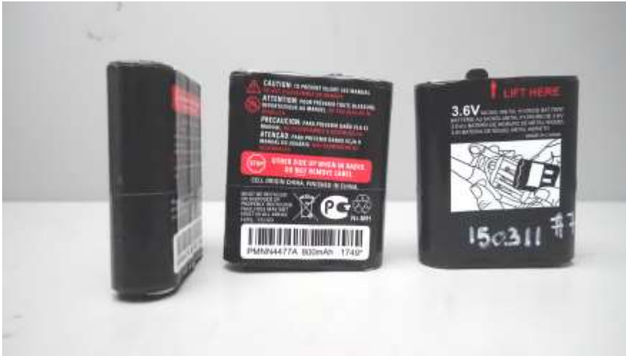
PMNN4477A: Side, front and back