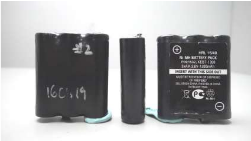
1532: Back, side and front view