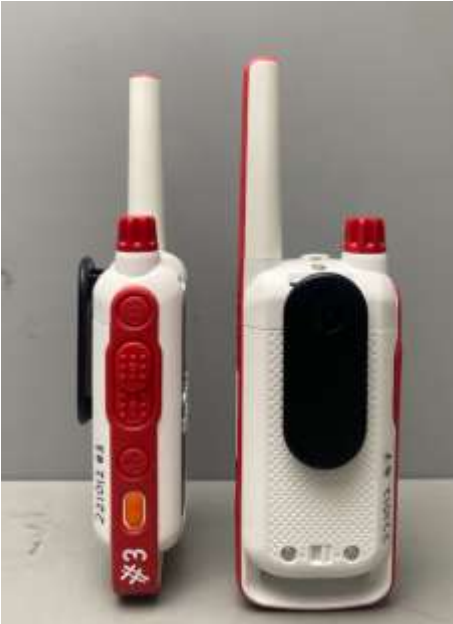
DUT w/ Belt Clip 1564028V01 (PMLN7438A) Side view and back view