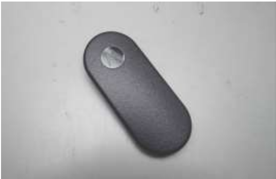
Belt clip 1564028V01 (PMLN7438A)